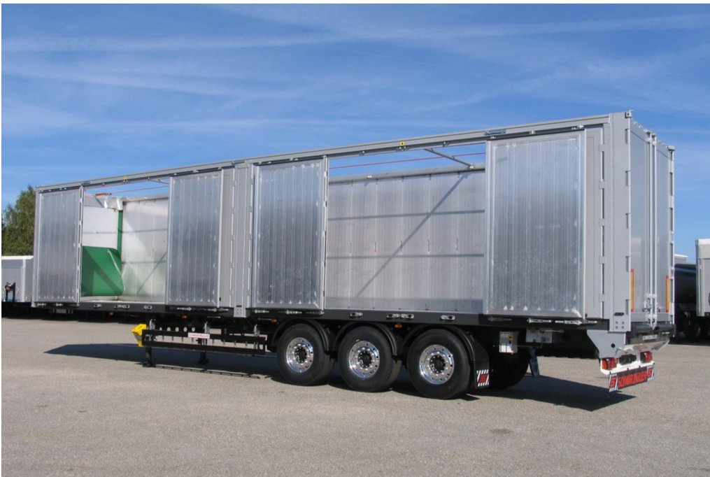
Left side with 2 4-leaf doors, for (un)loading on the side