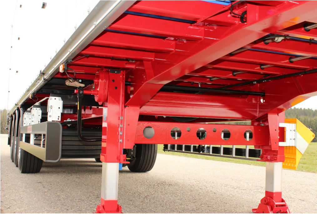
Torsionally rigid, continuous steel frame construction