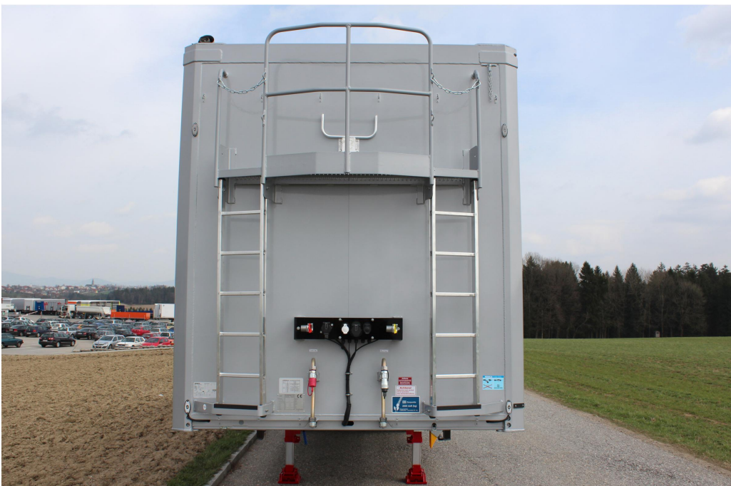
Aluminium hollow profile front wall, fixed with upper stabiliser frame