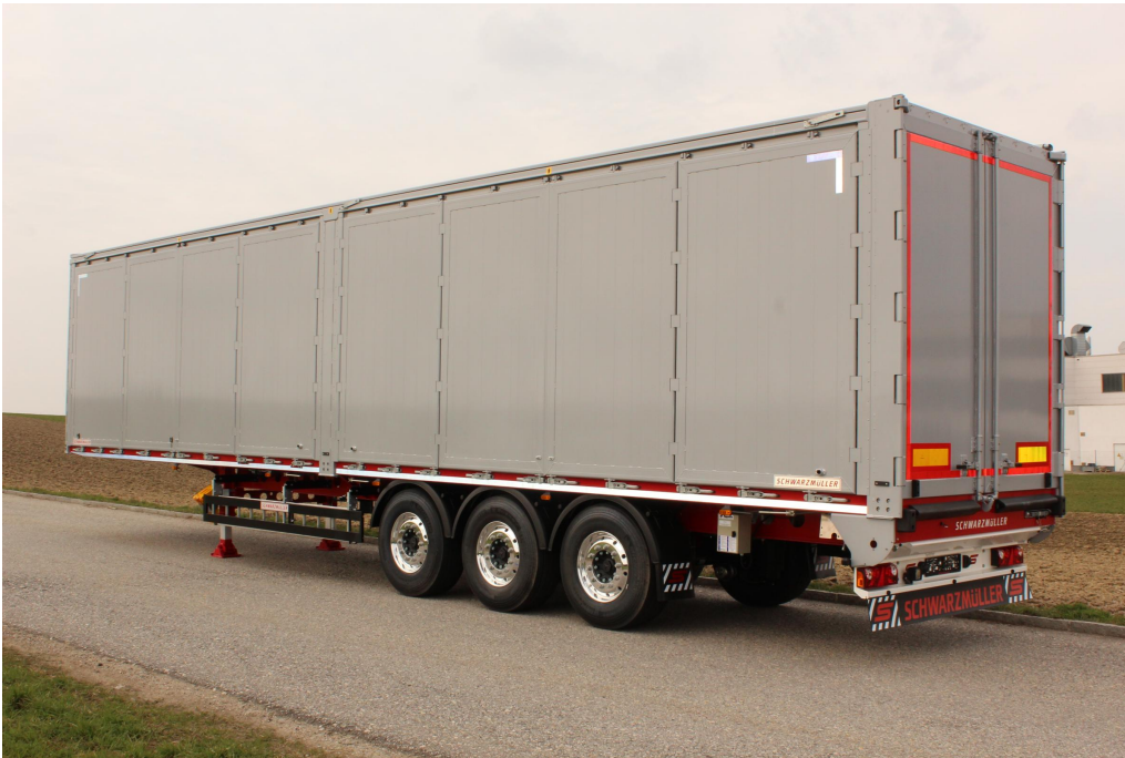
3-axe sliding floor semitrailer with side doors