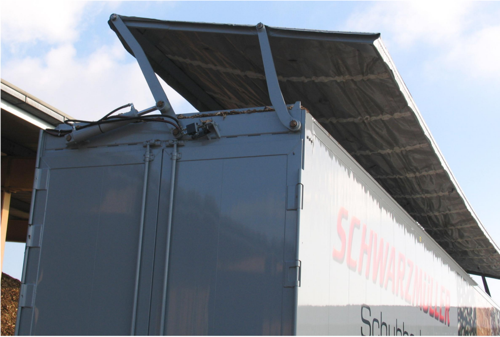
OPTIONAL: Hydraulic folding roof with all-round frame and plastic tarpaulin