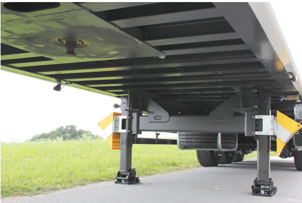
Aluminium lightweight design and therefore a payload advantage of up to 500 kg