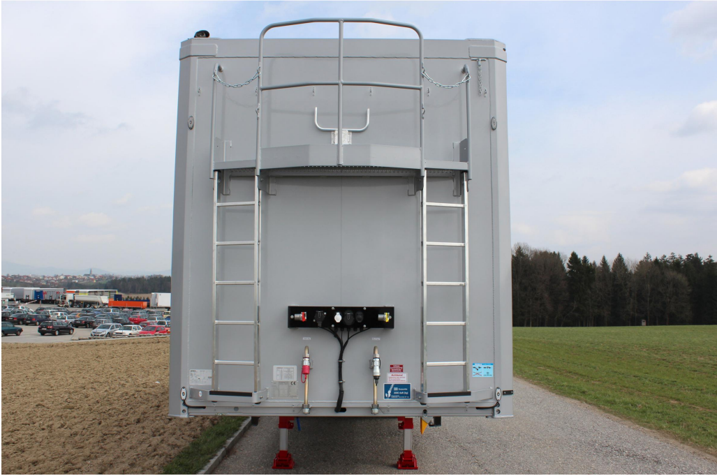
Aluminium hollow profile front wall, fixed with upper stabiliser frame