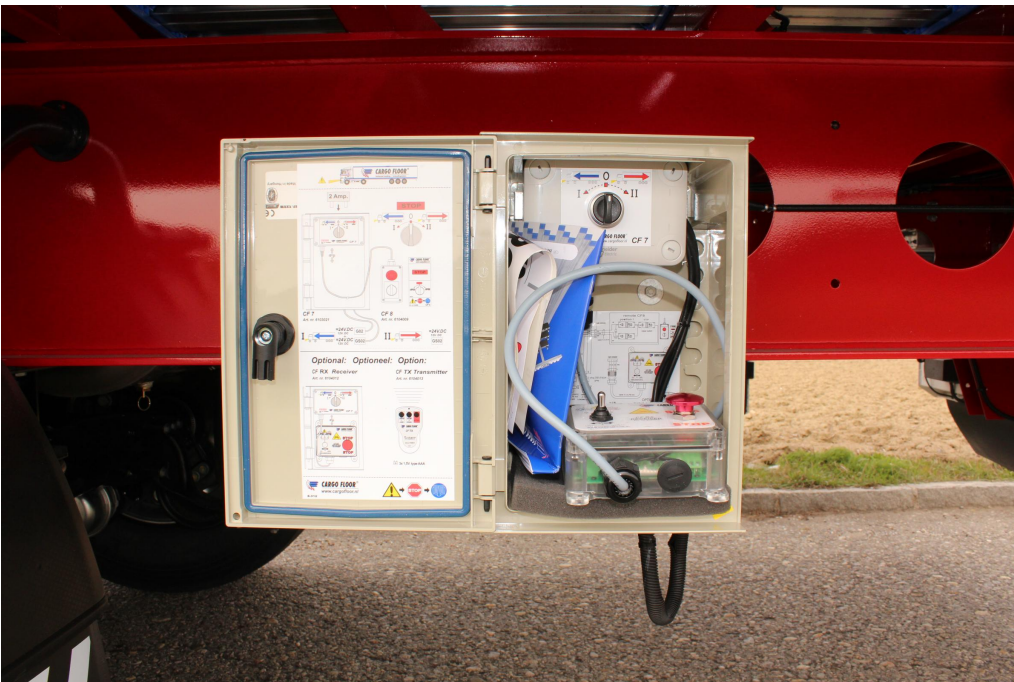
Floor control unit housed in waterproof box, incl. remote control with 10 m cable