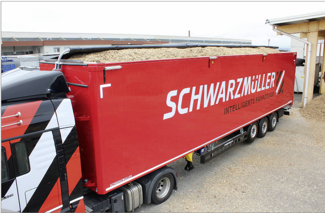
3-axle sliding floor semitrailer with aluminium frame - optional: with electric roller cover