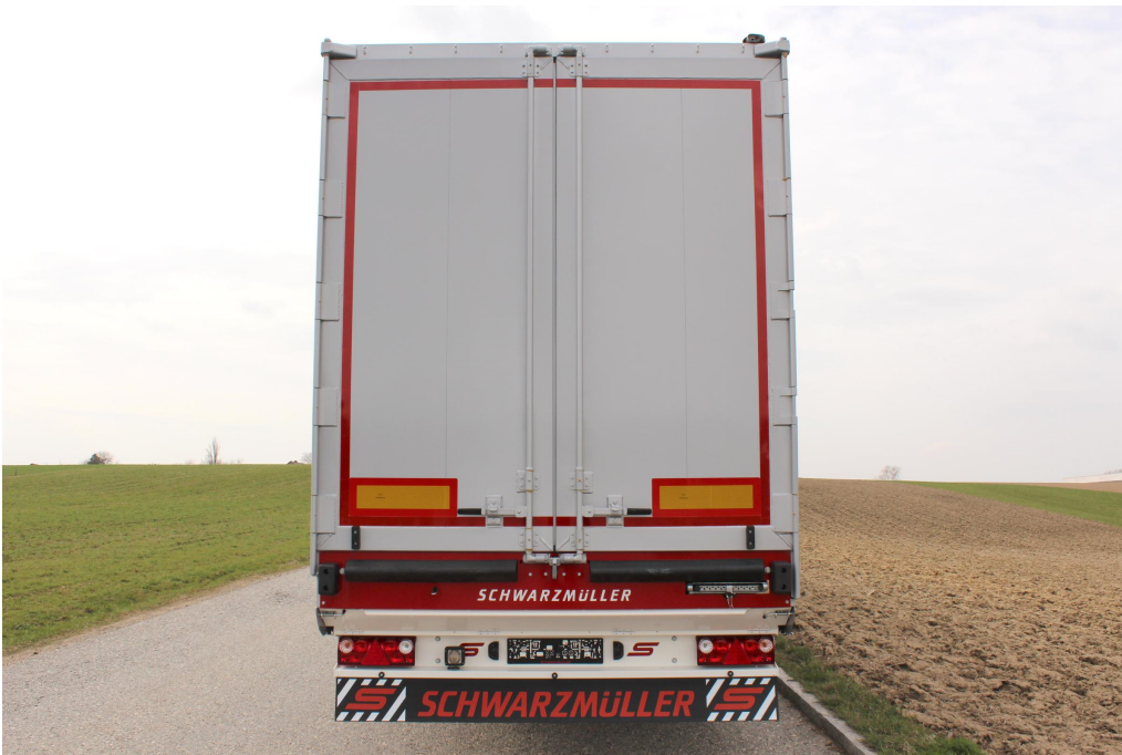
Rear wall = two-leaf door with one espagnolette on the outside of each door leaf and additional pneumatically operated safety lock