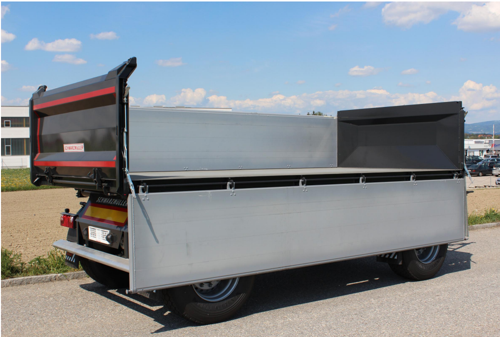
2-axle 3-way tipper trailer with folding side wall