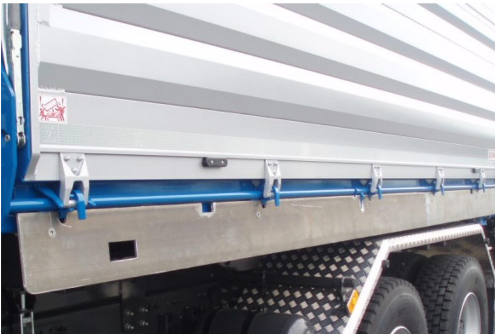
OPTIONAL: Aluminium flap on lateral central locking shaft