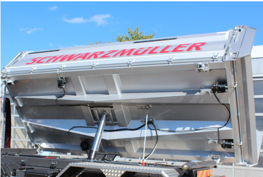
Tipper body design with conical trapezoidal profile side members in high-strength, lightweight design with small bottom panels for high dent resistance and shock absorption