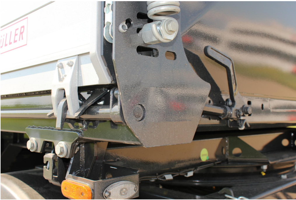
Manual central locking to open the side walls using a lever and central locking shaft