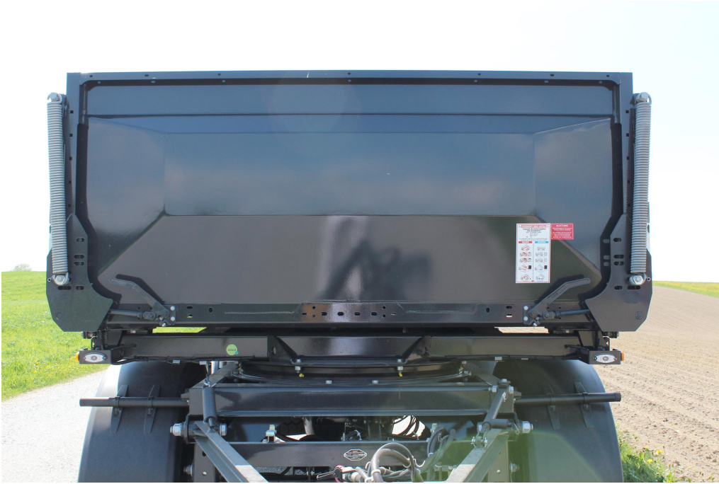
Fixed steel-sheet front wall