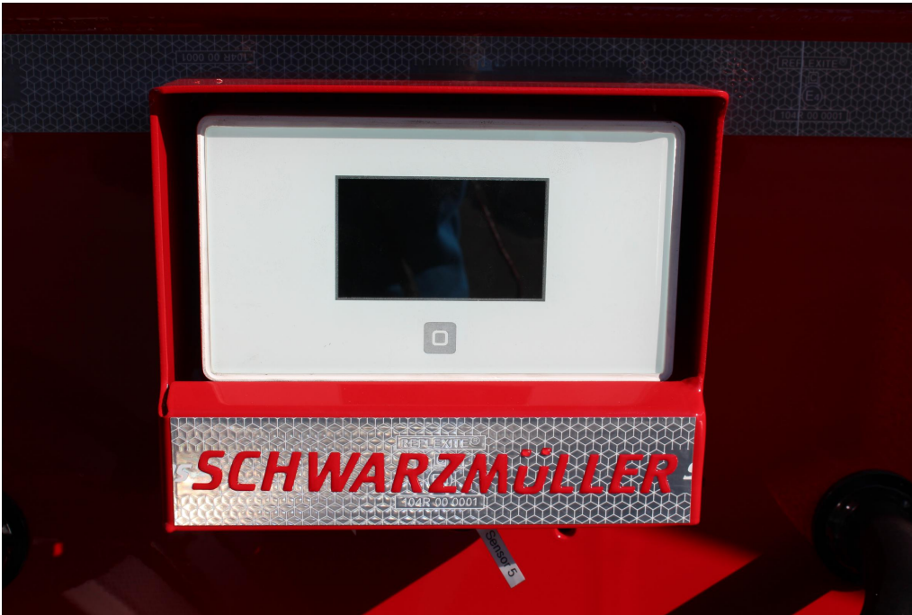
Temperature analysis unit in a sturdy box