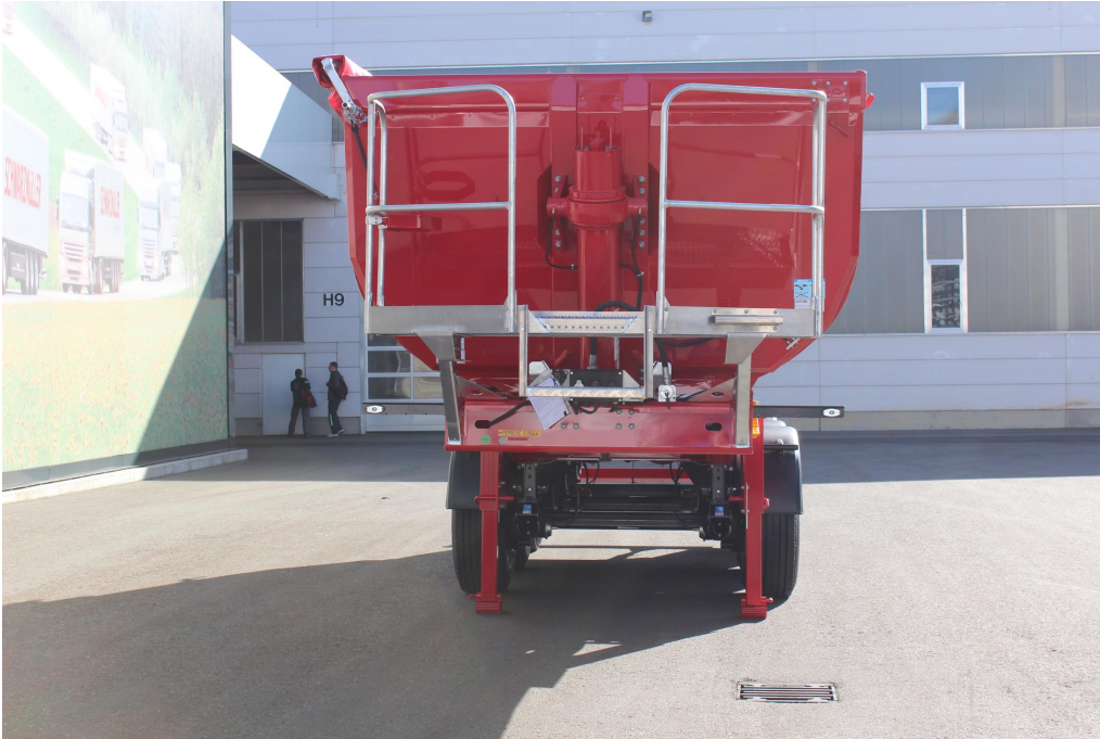
Insulated front wall with hard chrome-plated, high-grade front tilt cylinder