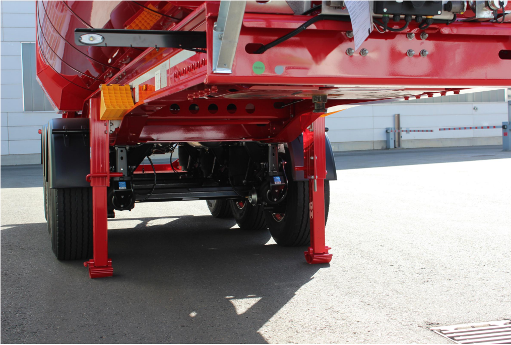
Stable, torsionally rigid aluminium chassis design with additional torsion tubes for high tipping stability