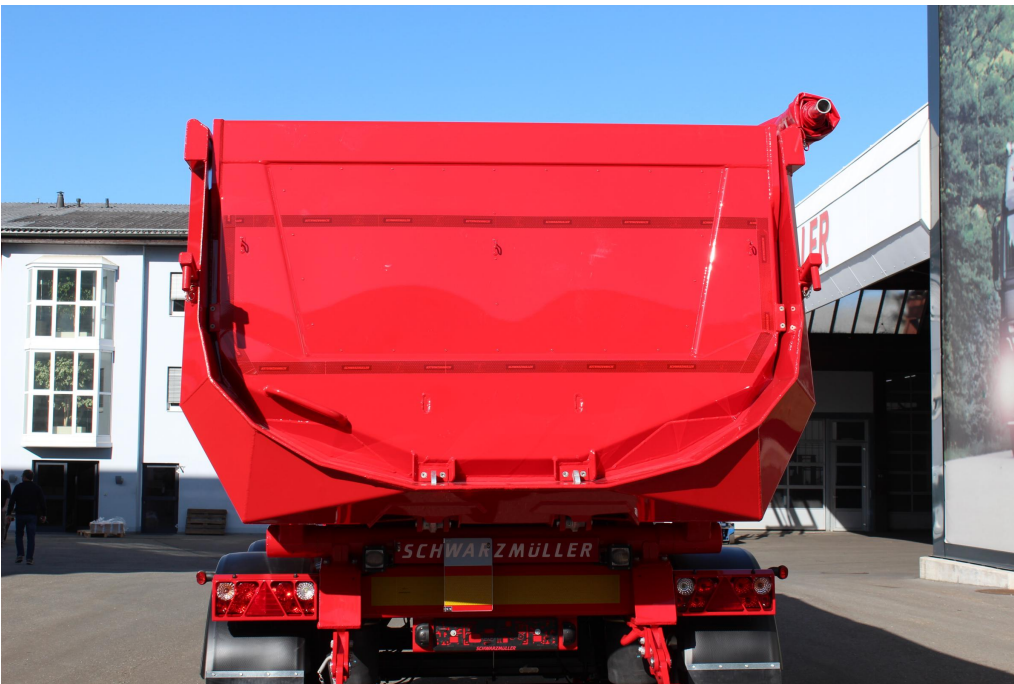
Insulated rear wall = hinged wall with recessed bearing and autom. mech. 2-hook central locking