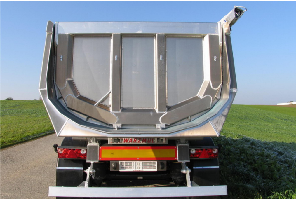
Rear wall = hinged wall with recessed bearing and autom. mech. dual-hook central locking