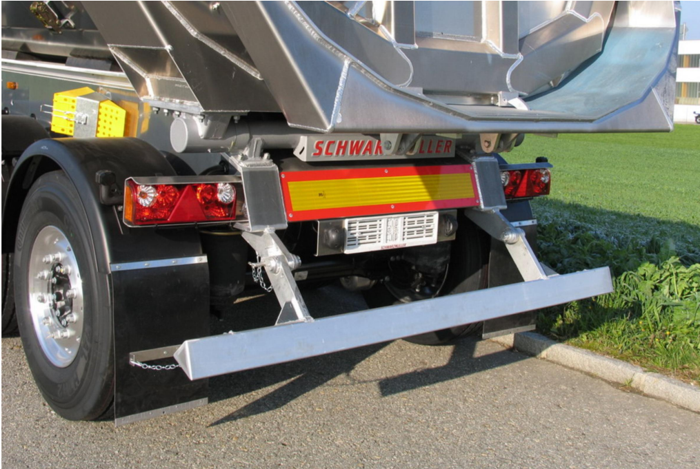
Foldable aluminium trapezoidal underride protection