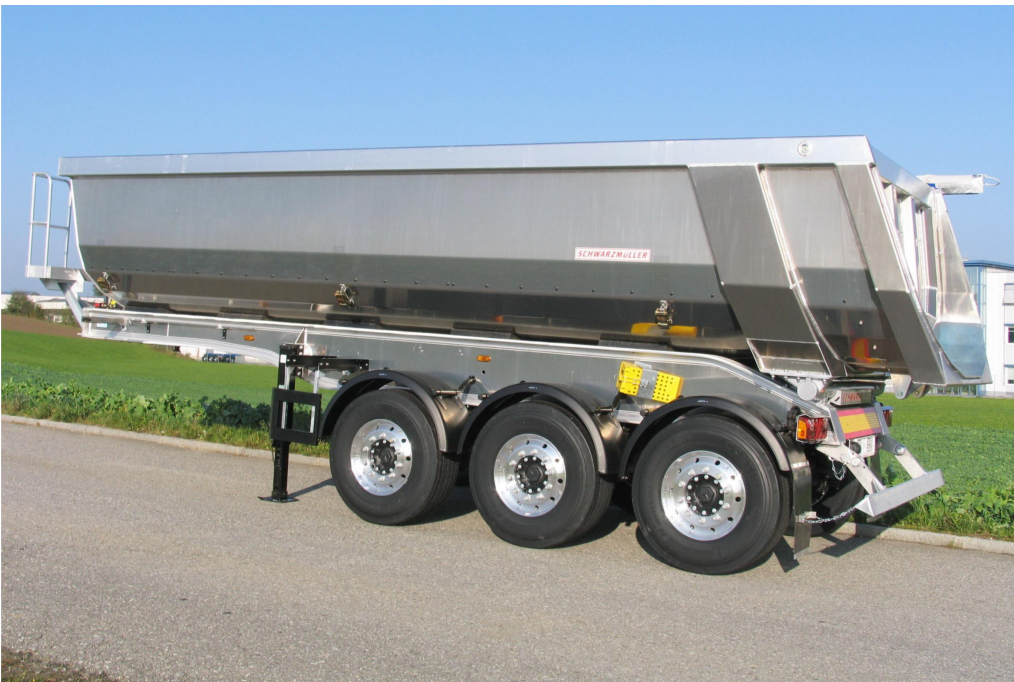
3-axle full aluminium segment tipper semitrailer