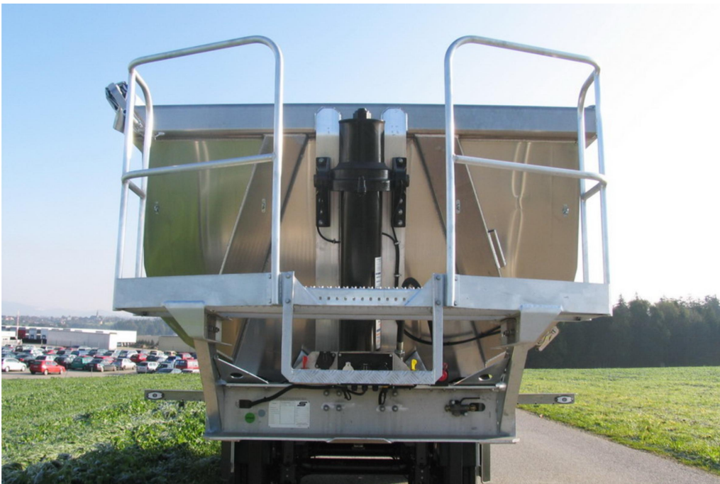
Inclined front wall with hard chrome-plated, high-grade front tilt cylinder