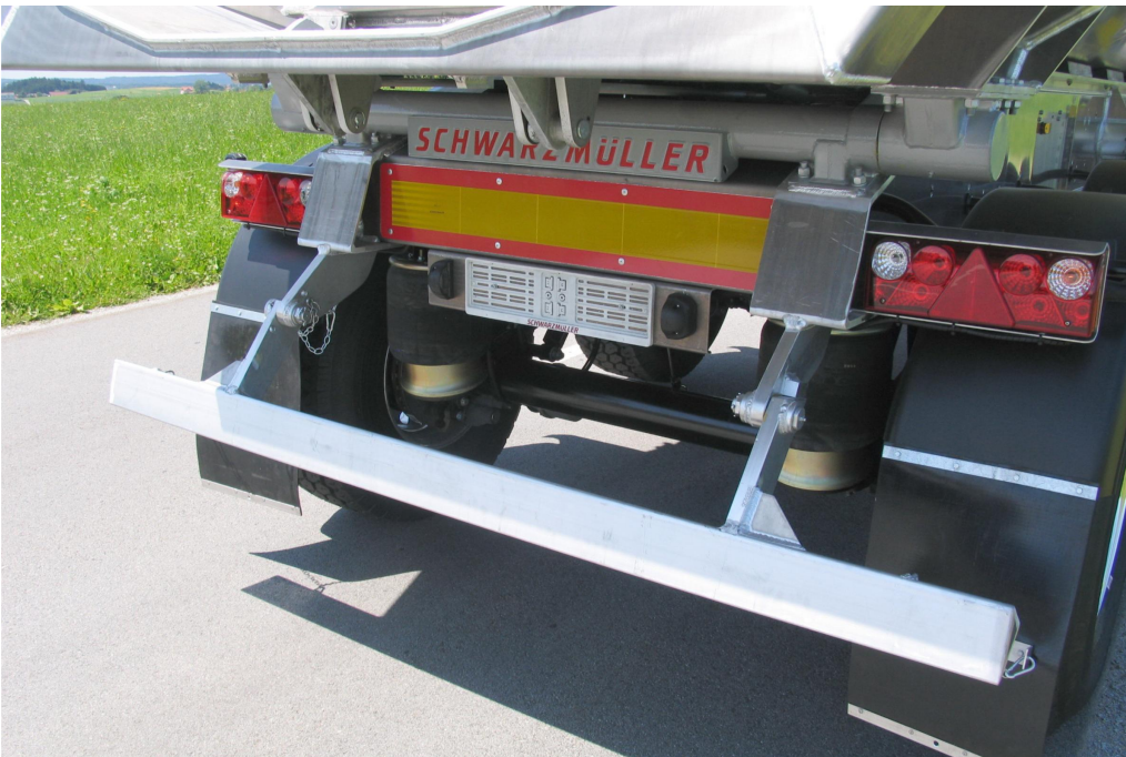
Foldable aluminium trapezoidal underride protection