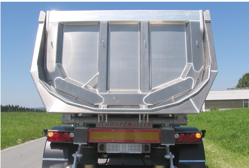
Rear wall = hinged wall with recessed bearing and autom. mech. dual-hook central locking