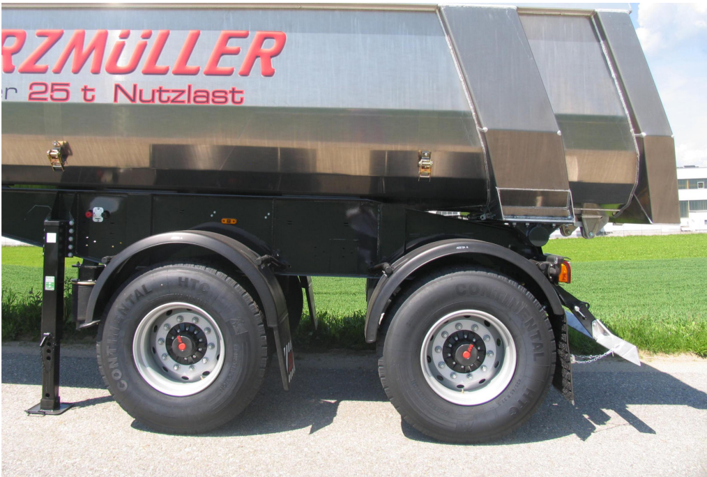
Axles with a wheelbase of 1,810 mm