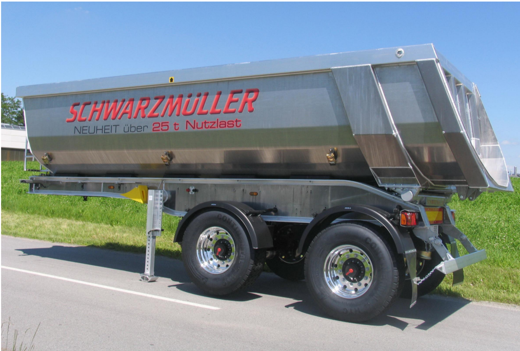
2-axle full aluminium segment tipper semitrailer - wheelbase 1,810 mm