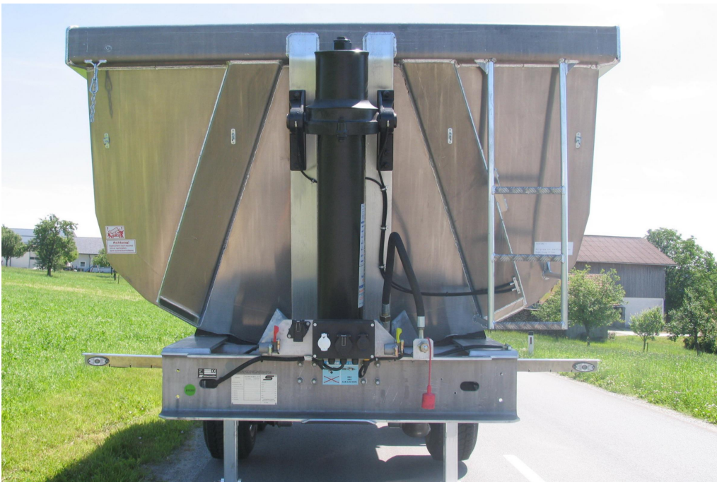
Inclined front wall with hard chrome-plated, high-grade front tilt cylinder