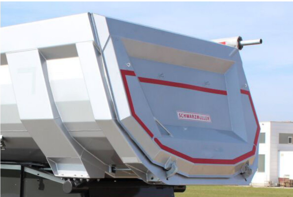
OPTIONAL: External rear wall for higher load volume