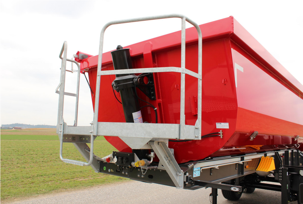
Standing platform on the front wall for operating the roller tarpaulin