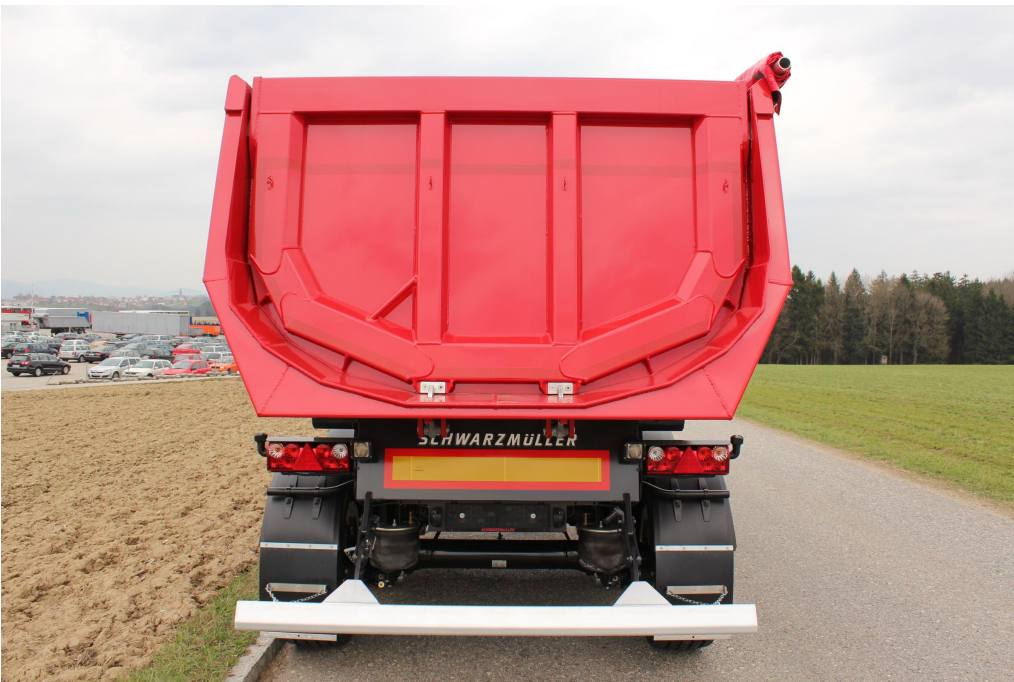
Rear wall = hinged wall with recessed bearing and autom. mech. dual-hook central locking