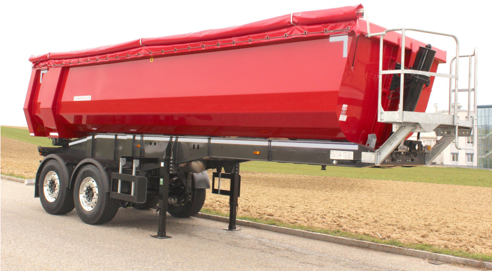
2-axle aluminium segment tipper semitrailer