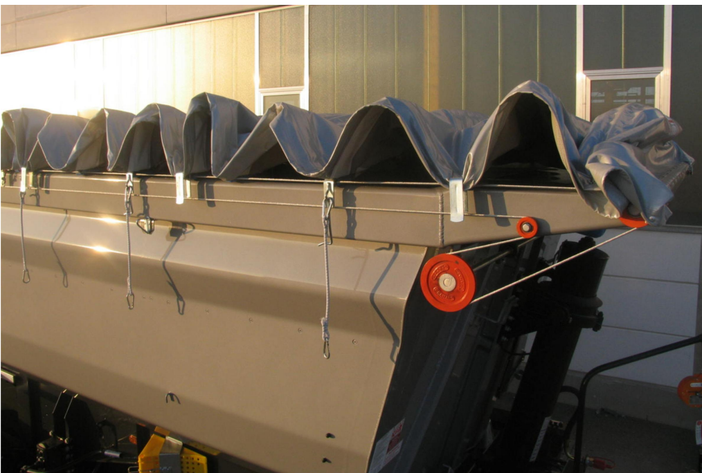
OPTIONAL: Roller cover - operated manually or via electric remote control