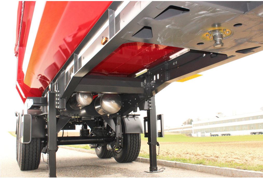
Stable and torsionally rigid chassis design with additional torsion tubes