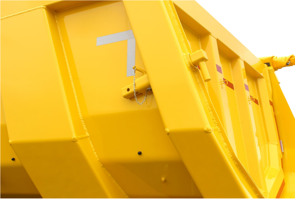
OPTIONAL: Dosing unit for hinged rear wall with pull-out pipe stop