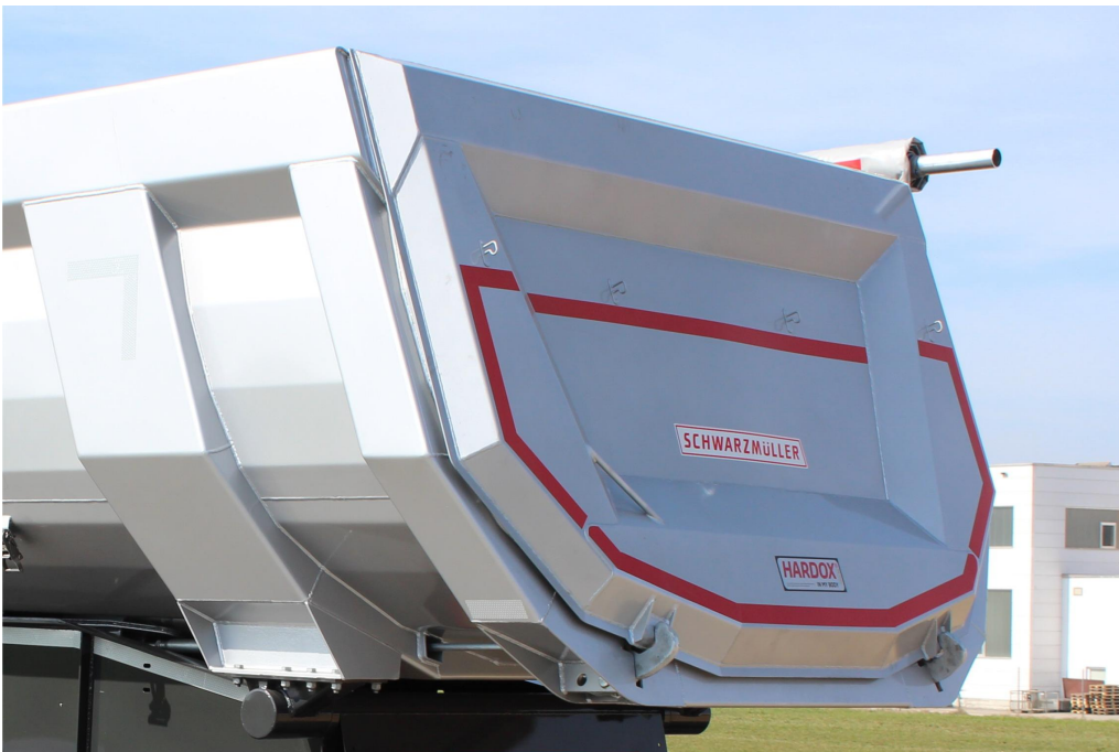
OPTIONAL: External rear wall for higher load volume