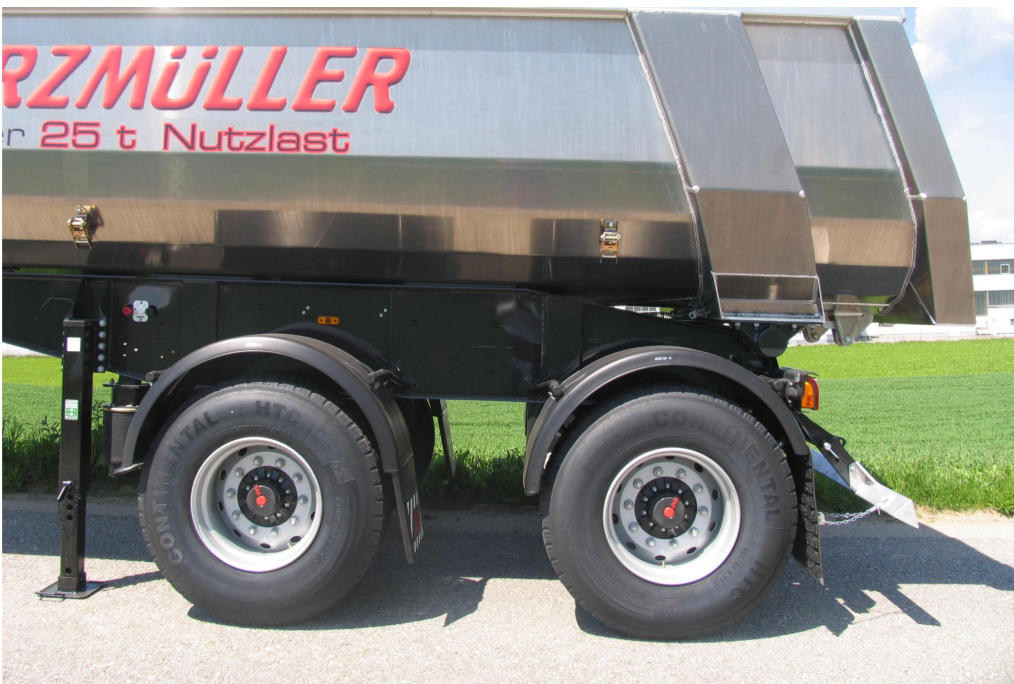
Axles with a wheelbase of 1,810 mm