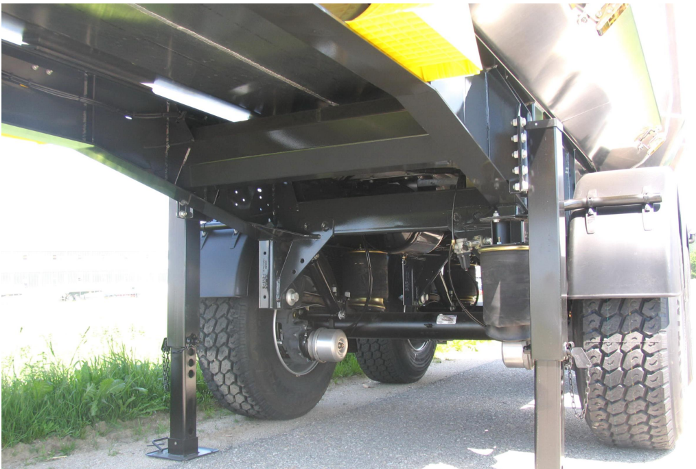
Stable and torsionally rigid chassis design with additional torsion tubes