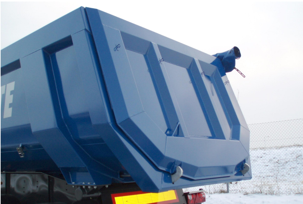
OPTIONAL: External rear wall for higher load volume