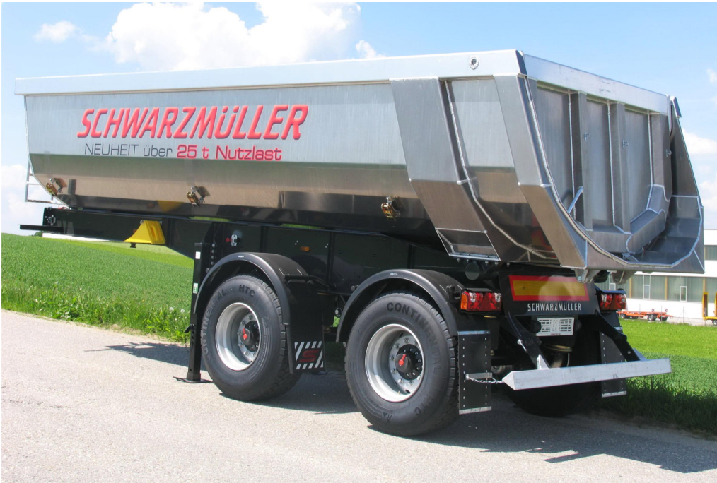
2-axle aluminium segment tipper semitrailer - wheelbase 1,810 mm