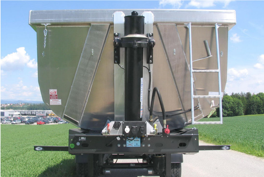
Inclined front wall with hard chrome-plated, high-grade front tilt cylinder