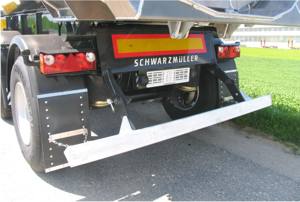
Foldable aluminium trapezoidal underride protection