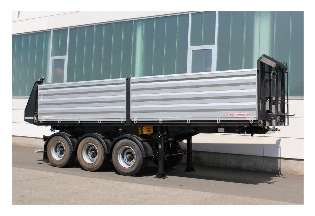
3-axle 3-way tipper semitrailer - building site