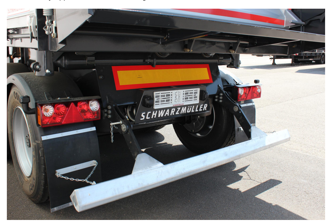
Foldable underride protection for road-finishing use