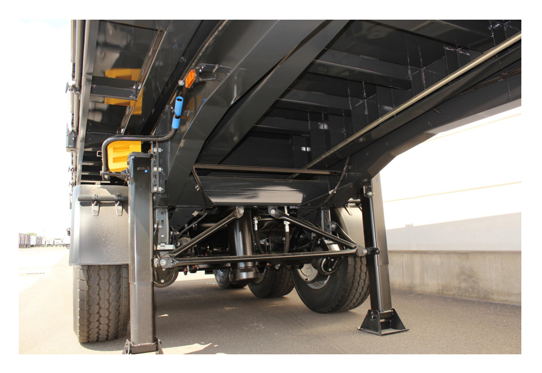
Stable and torsionally rigid chassis design with additional torsion tubes for 3-way tipping