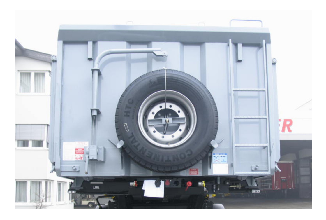
OPTIONAL: Spare wheel bracket with swivel boom and winch on front wall