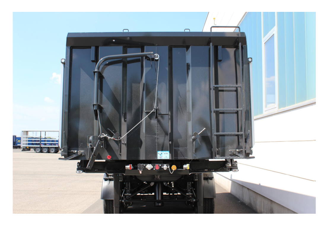
Fixed steel sheet front wall with lashing eyes, ladder and retaining brackets