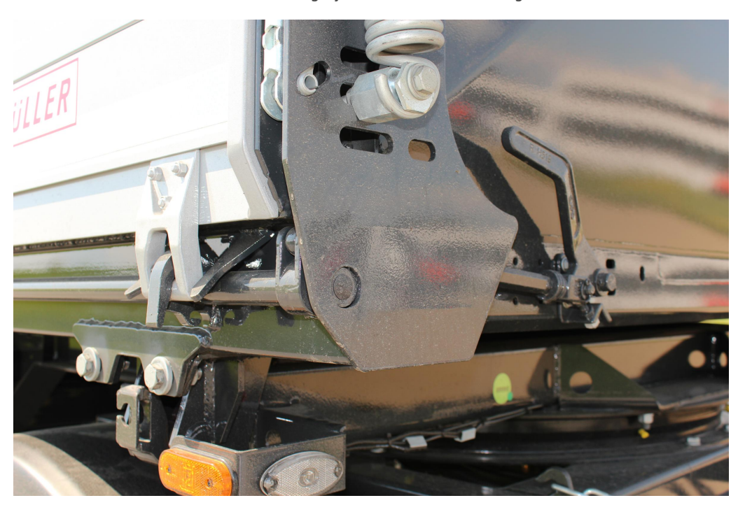
Manual central locking to open the side walls using a lever and central locking shaft