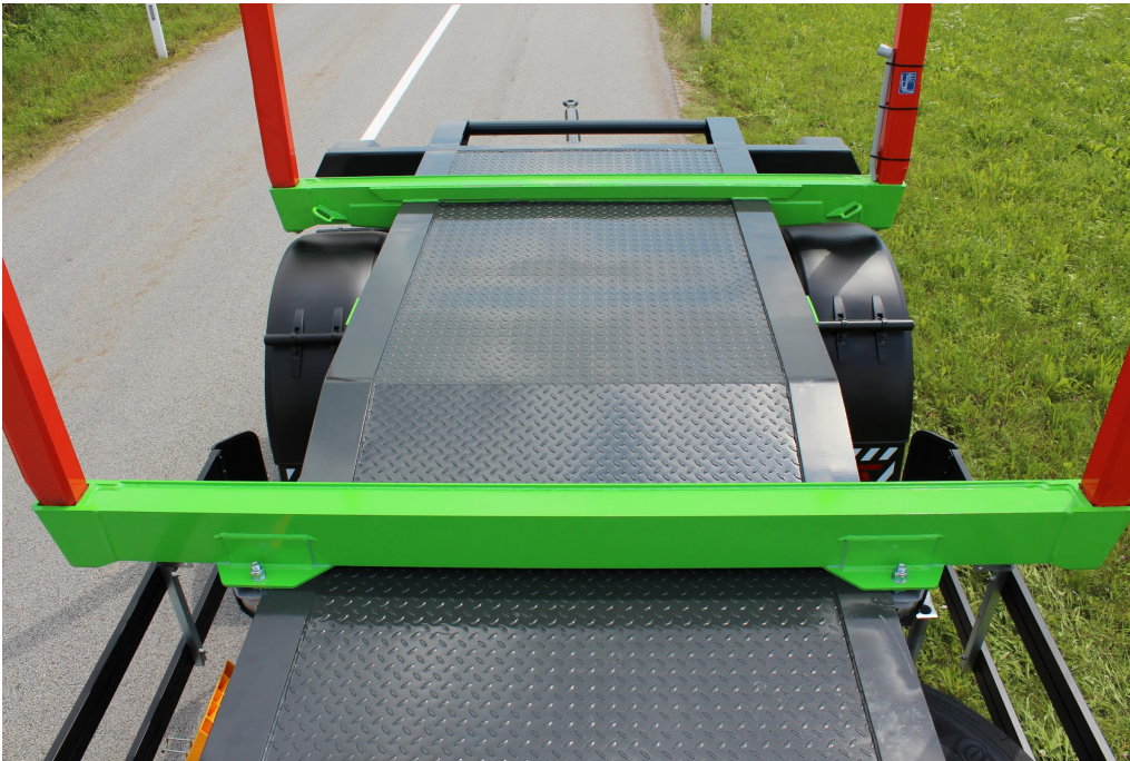
Steel stud plate cover between frame side members