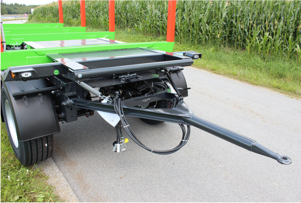
Bogie at front incl. fitted drawbar