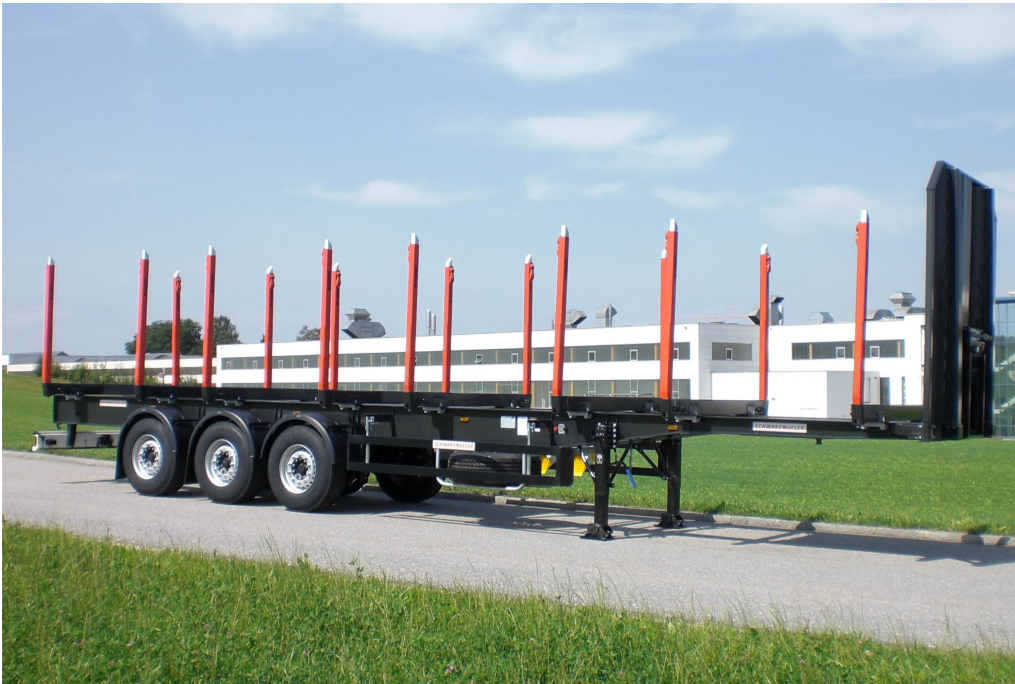
3-axle stanchion semitrailer - without platform