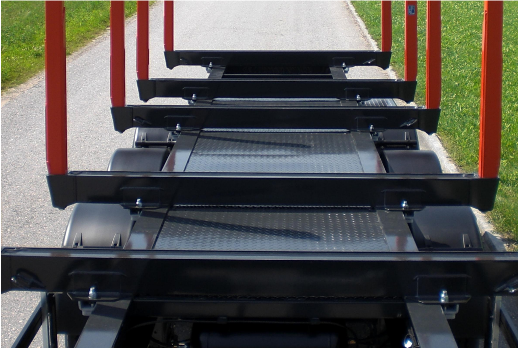
Chequered steel plate cover between frame side members over the chassis and at the front