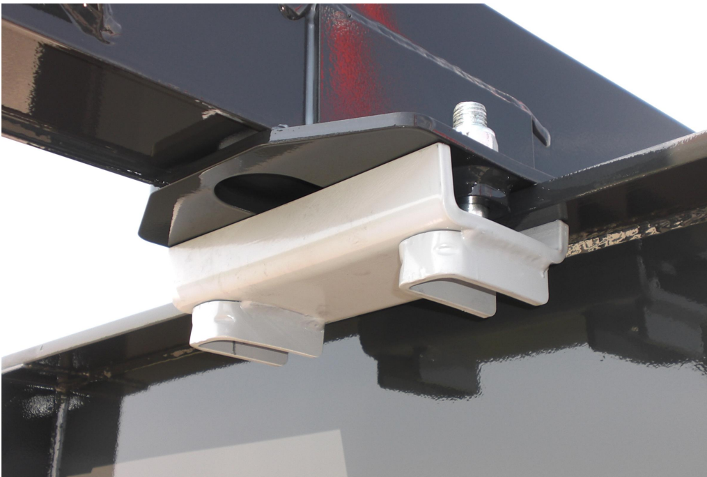
Stanchions mounted via welded clamps = can be moved