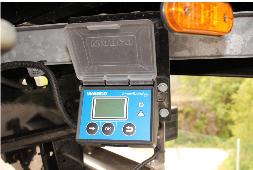
OPTIONAL: SmartBoard for reading data on vehicle display (mileage, axle assembly load, brake diagnostics etc.)