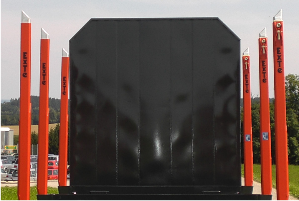
OPTIONAL: Extra-strong steel profile front wall, approx. 2,500 mm high with centre supports