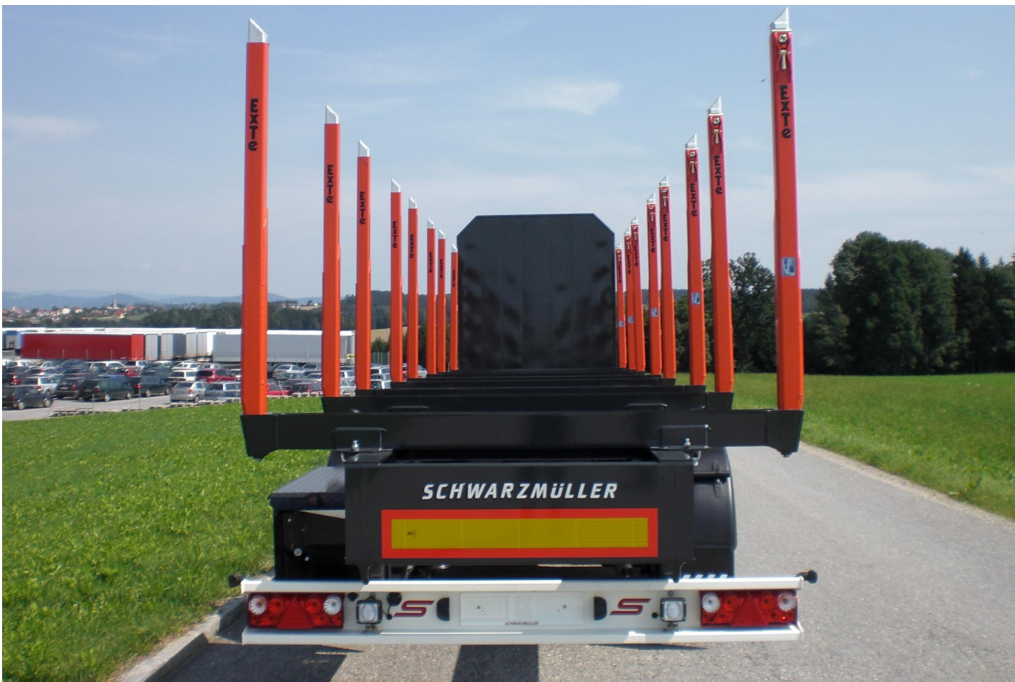
Rear closing element incl. fitted aluminium underride protection