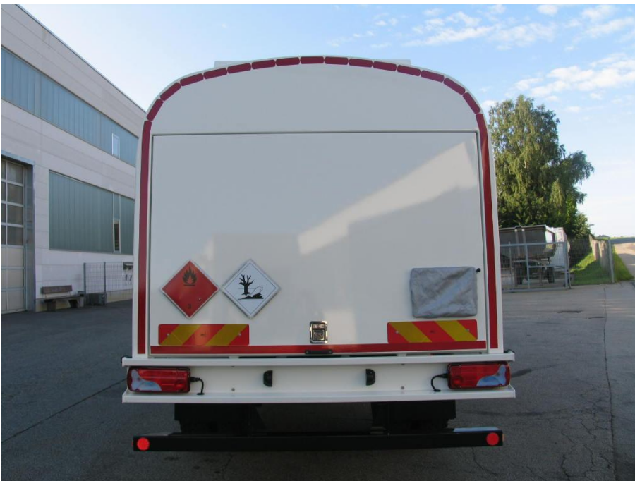
OPTIONAL: Choice of aluminium or steel bumper