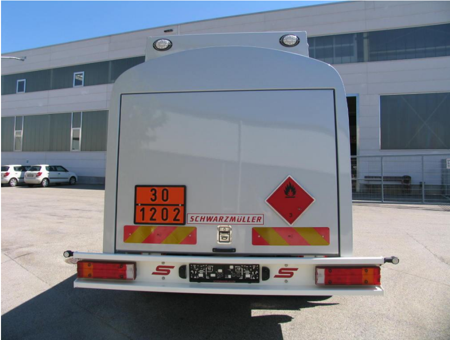
OPTIONAL: 2 high-set tail lights recessed in rear cabinet