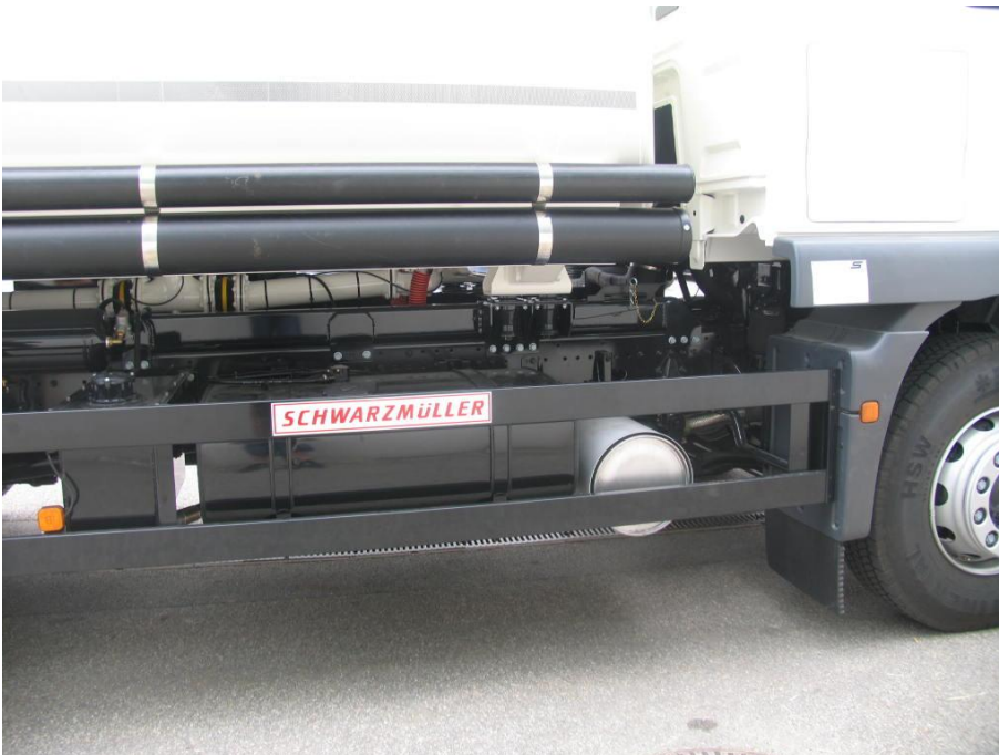
Lateral protection with aluminium profiles