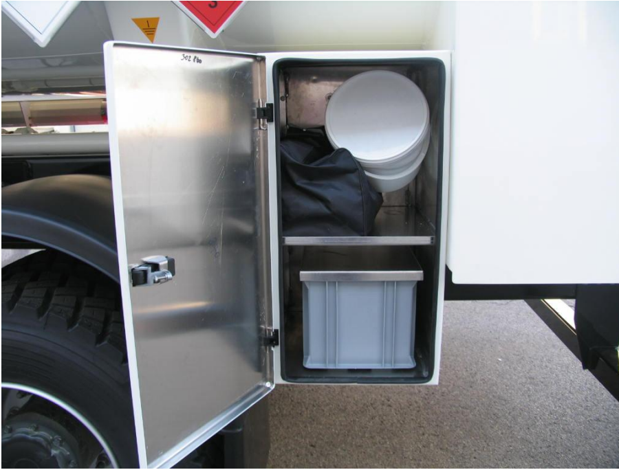
Accessories box with side-opening door offers plenty of storage space