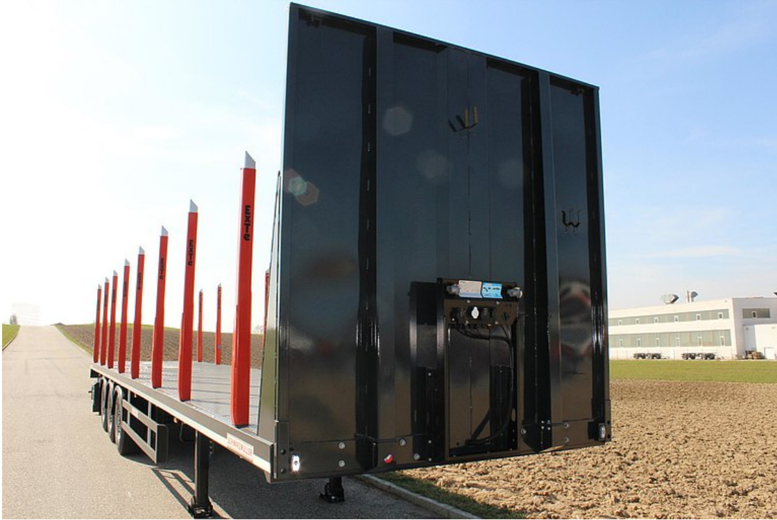
Extra-strong steel profile front wall with centre supports