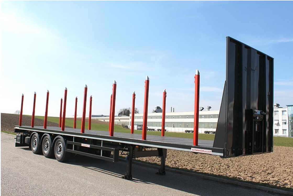
3-axle stanchion platform semitrailer