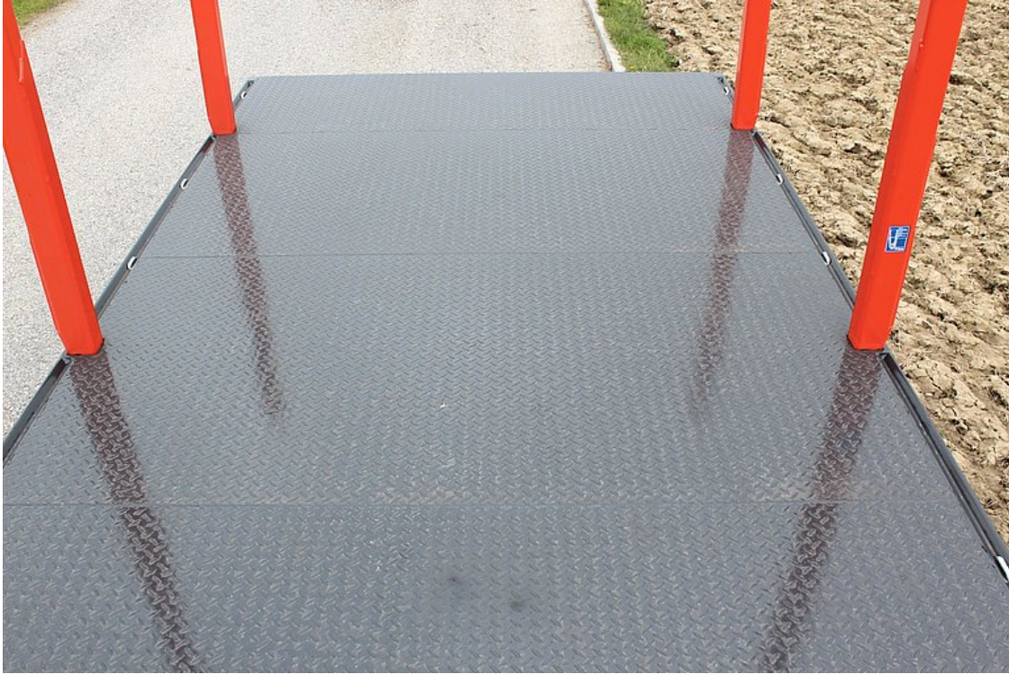
Steel stud plate floor, 5/7 mm, tack-welded