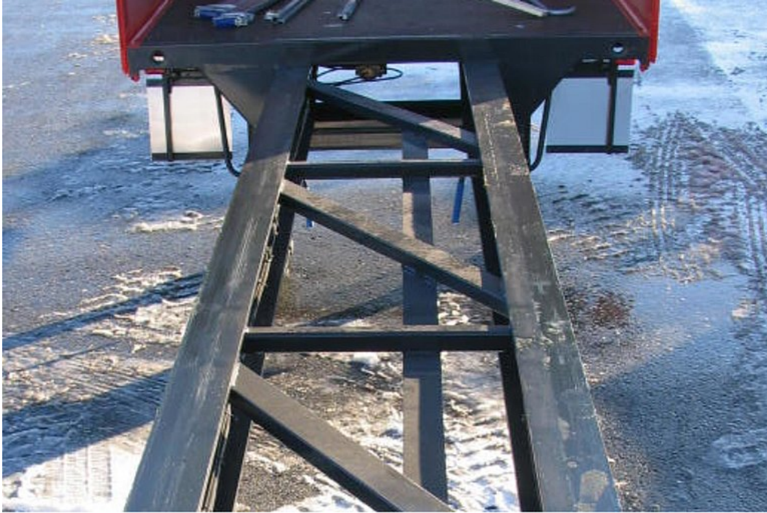
Extendible lightweight frame with an extension length of 6 m for long materials transport up to 22 m