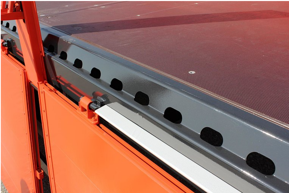
OPTIONAL: Perforated external frame with approx. 100 mm hole spacing, 50/30 mm slot, for securing 2 t per lashing point