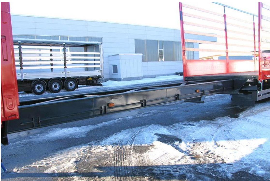
Torsionally rigid, pull-out welded steel frame design, with 7-step pneumatic locking