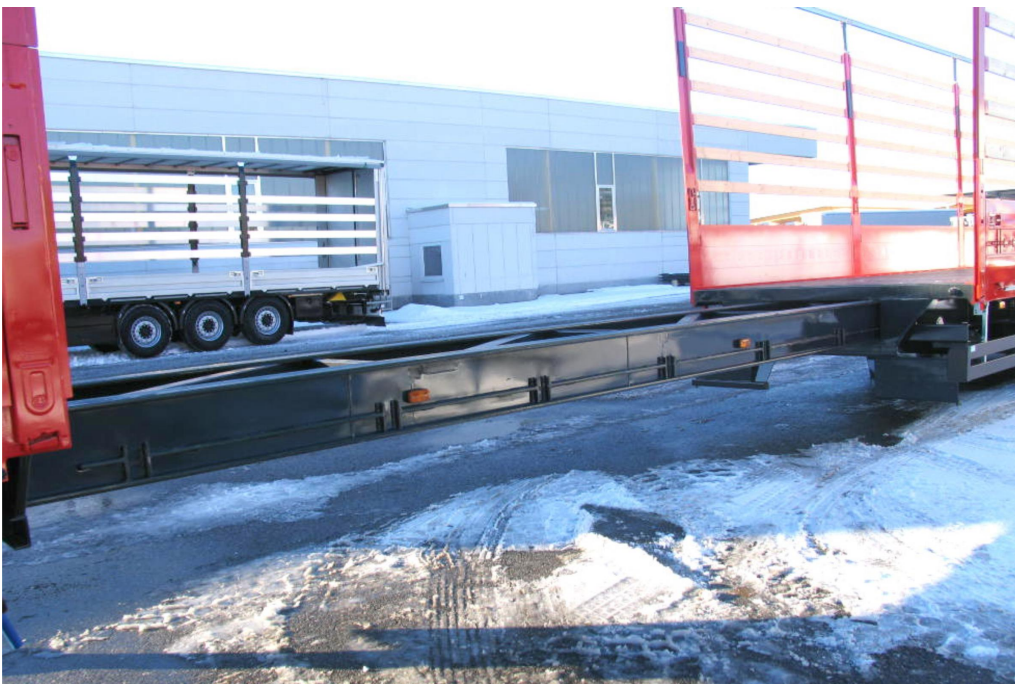
Torsionally rigid, pull-out welded steel frame design, with 7-step pneumatic locking