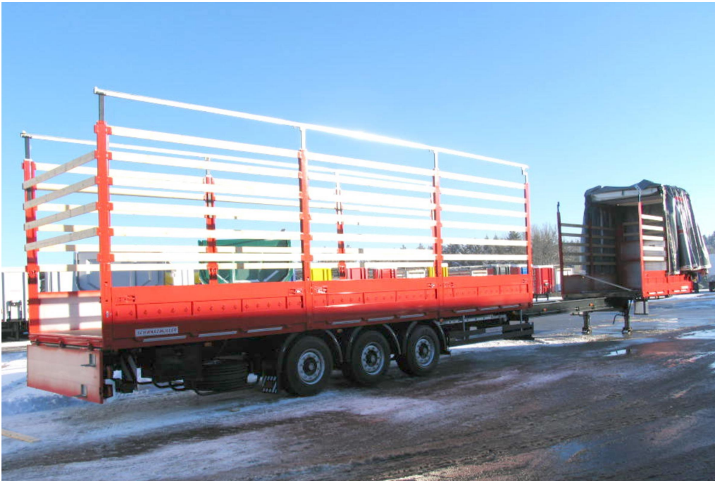
3-axle platform semitrailer - extendible