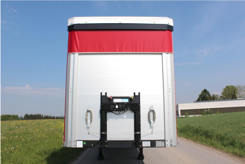
Reinforced aluminium hollow profile front wall with integrated equipment bracket