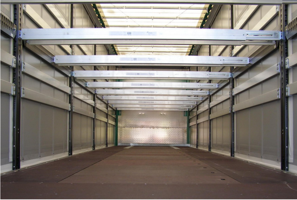
OPTIONAL: Twin-level loading system CTD III for 11 x 3 EURO pallets, load capacity: 400 kg/pallet