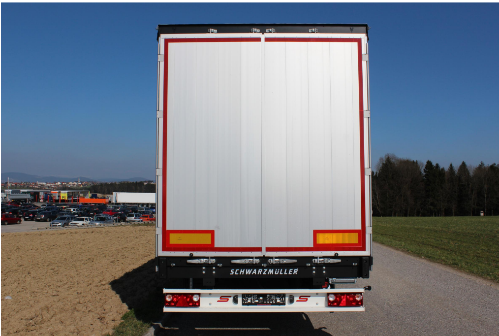
Bolted portal at rear with aluminium corner posts and fully opening double door in profile design