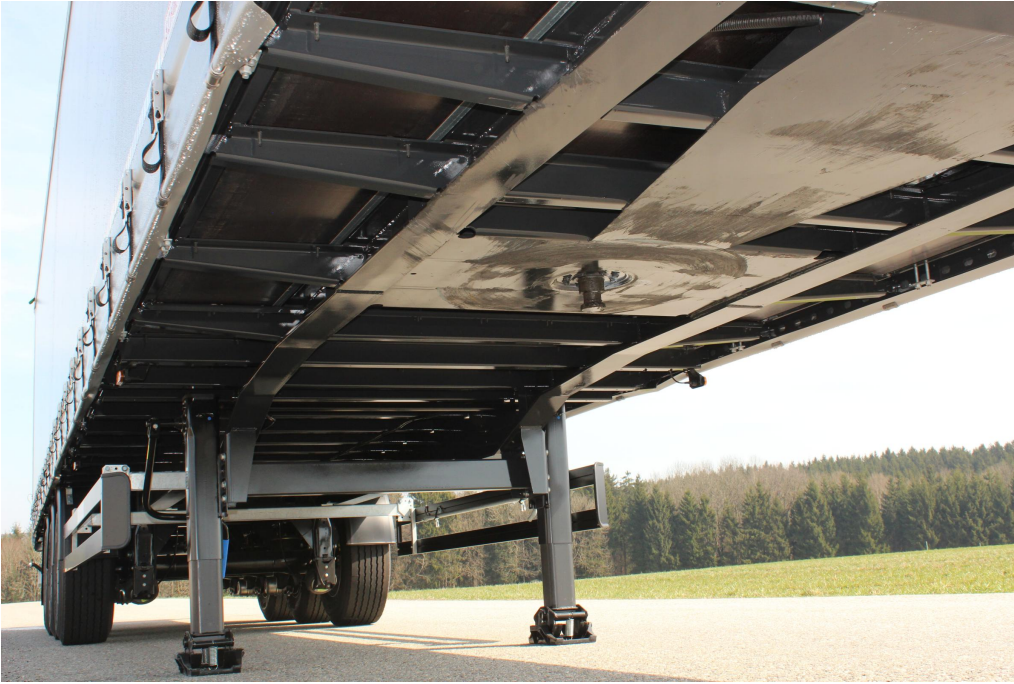
Torsionally rigid, welded ladder frame structure