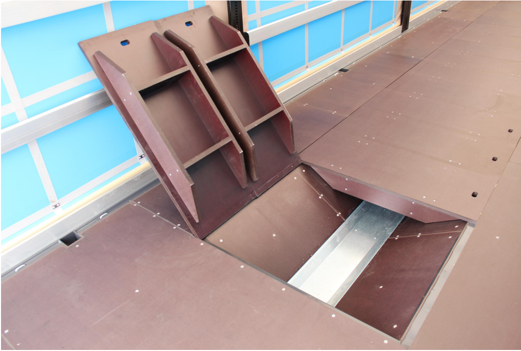
Stacker-bearing recess cover made from 27 mm resin-coated plywood with trussing