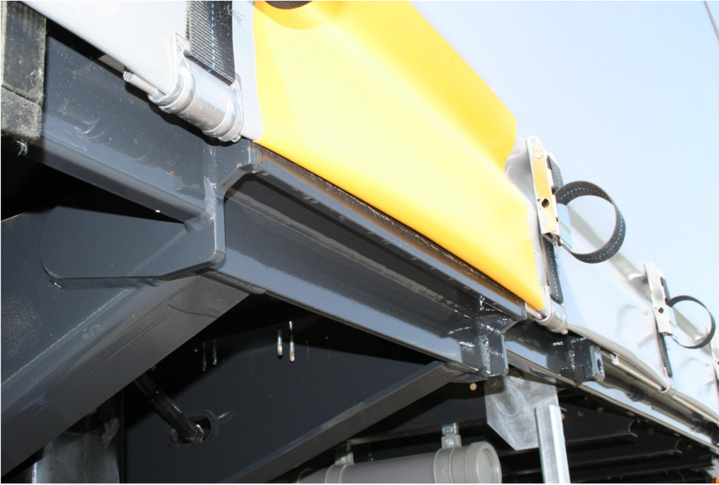
Reinforced frame construction with 4 grip edges for crane-based rail loading