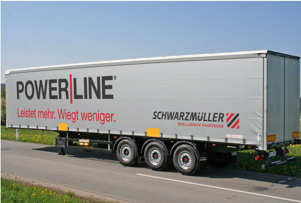
3-axle sliding tarpaulin platform semitrailer - coil - combined transport