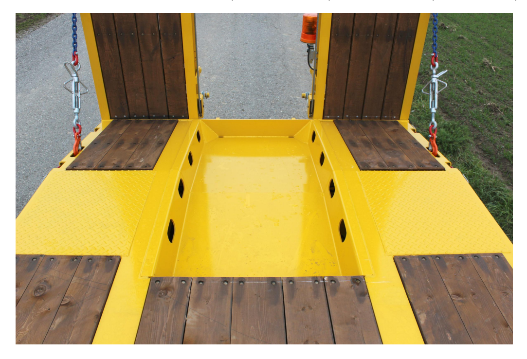
Excavator shovel recess between side members at rear