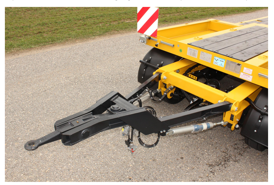
OPTIONAL: Offset drawbar with pivoting eye, 40 + 50 mm