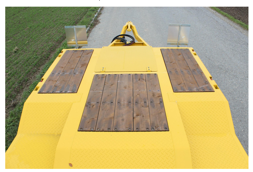
Raised platform at the front incl. offset frame, tapered corners