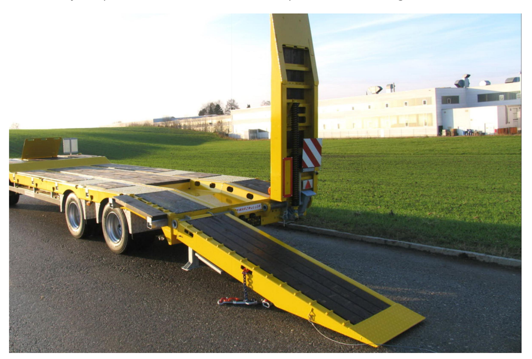
2 folding single-part loading ramps with hardwood flooring