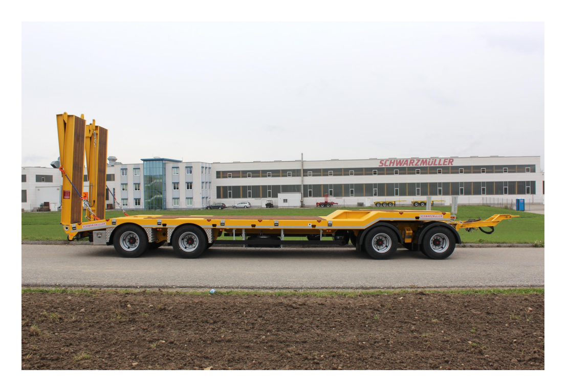
4-axle low loader trailer with offset platform