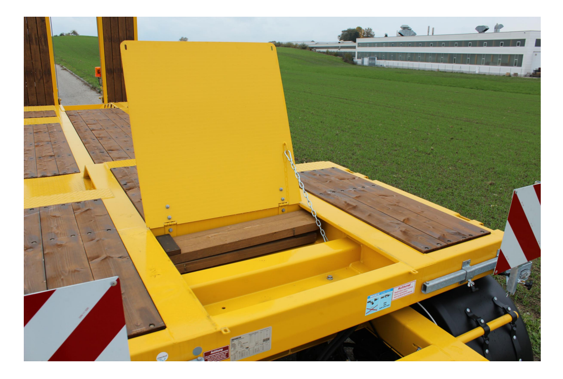
\boldsymbol{1} accessory compartment at front centre of raised platform, with folding lid