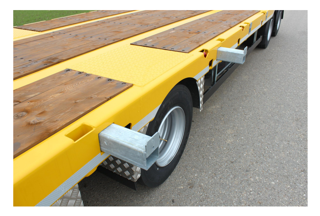
Pull-out extensions, on both sides of drop deck and rear taper, incl. extension planks for transporting wide loads