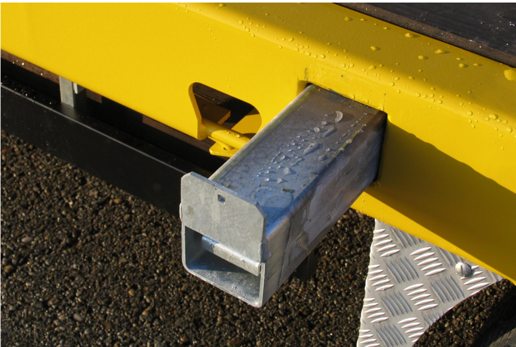
Pull-out extensions incl. extension planks for transporting wide loads