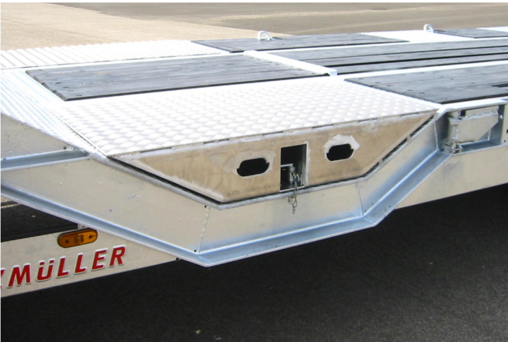
Wheel recesses in different designs for transporting special construction vehicles