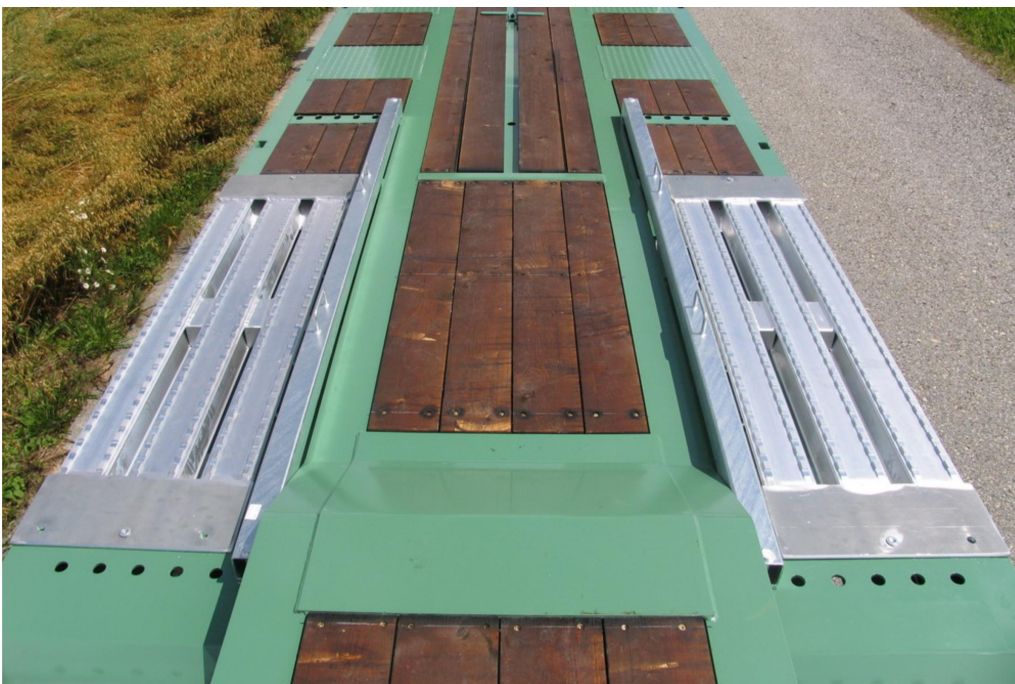
Wheel recesses with drive-on aluminium cover