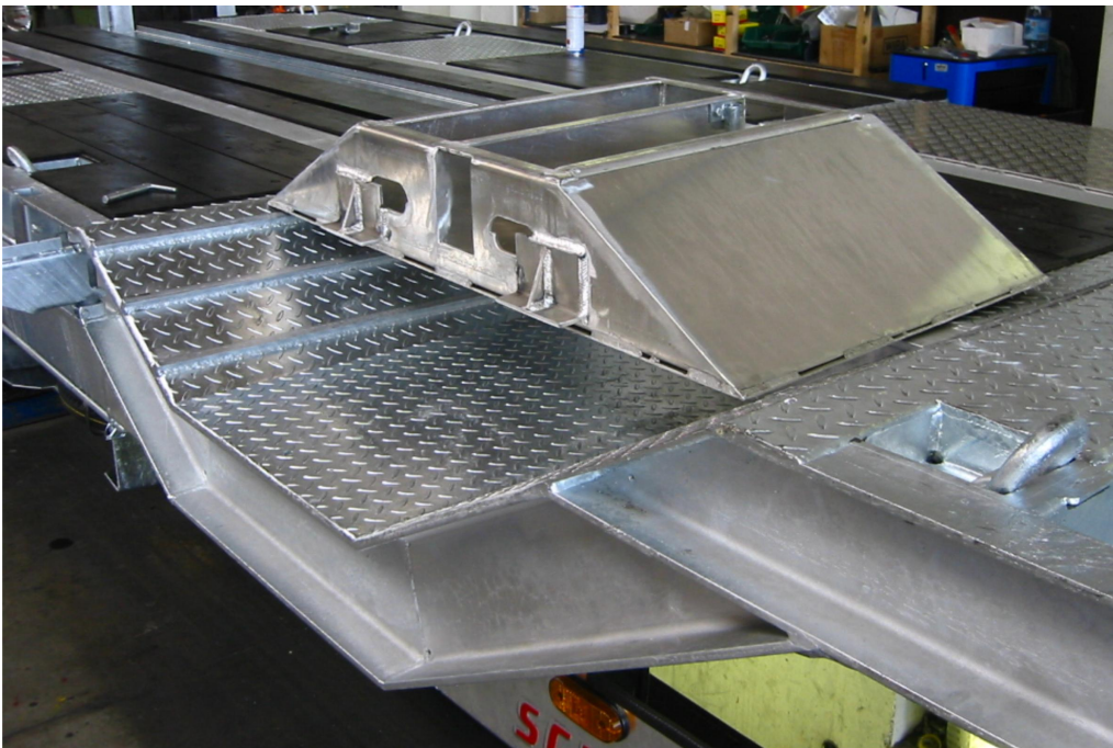
Wheel recesses in different designs for transporting special construction vehicles