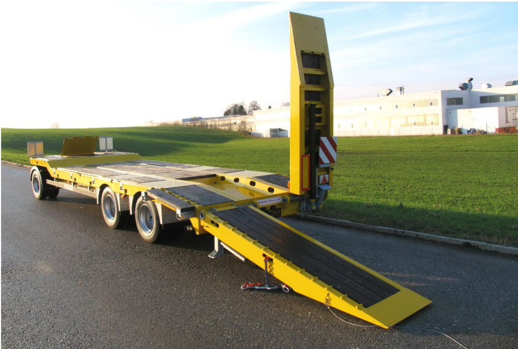
2 folding single-part loading ramps with hardwood flooring