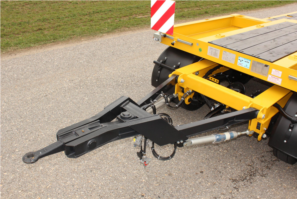
OPTIONAL: Offset drawbar with pivoting eye, 40 + 50 mm