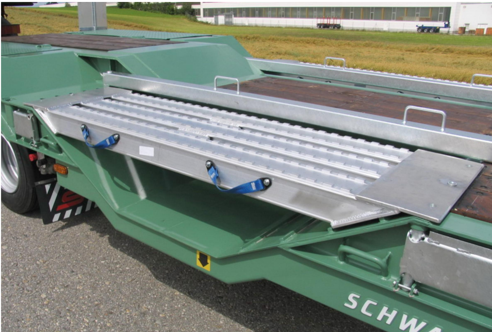
Wheel recesses integrated in external frame, coordinated with floor construction incl. drive-on aluminium cover