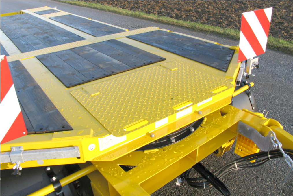
Front offset platform with accessory compartment including lid