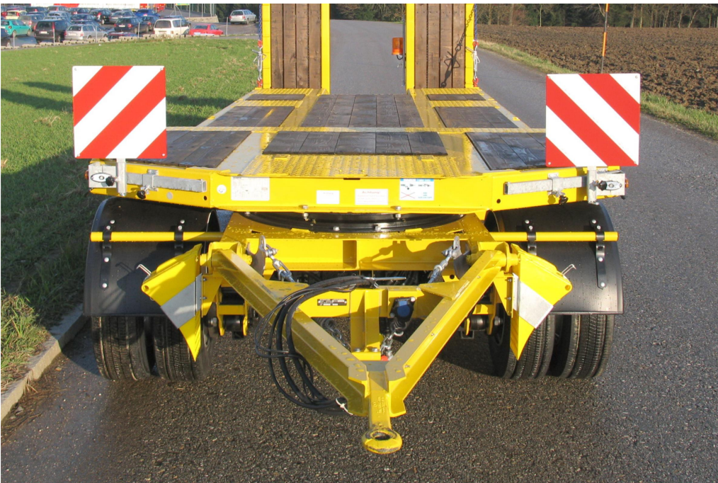
Bogie at front incl. drawbar and pull-out warning signs on frame for transporting wide loads