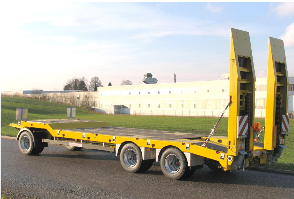
3-axle low loader trailer