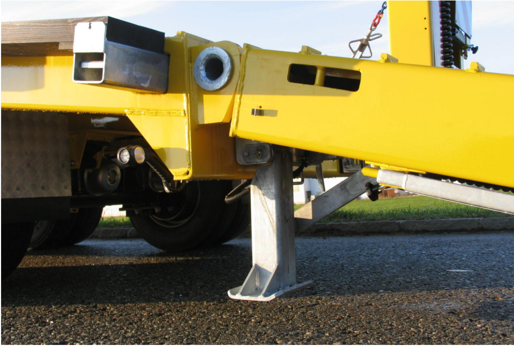
1 automatic folding support per ramp and frame end at rear end