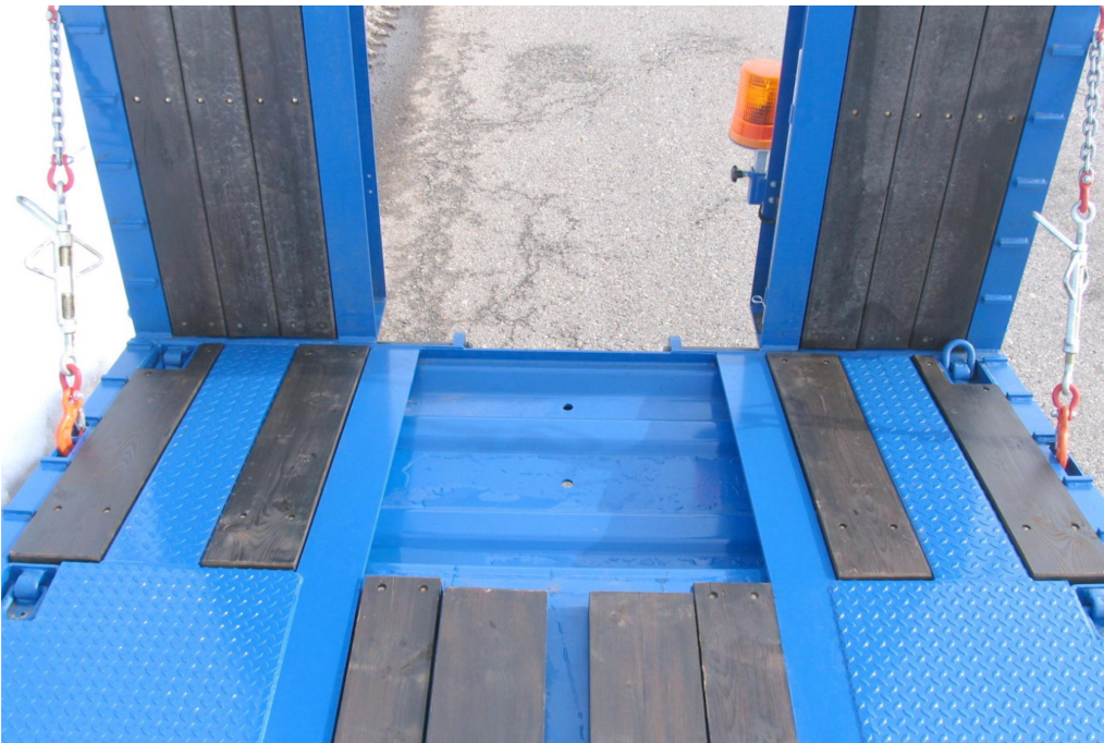
OPTIONAL: Excavator shovel recess between side members at rear