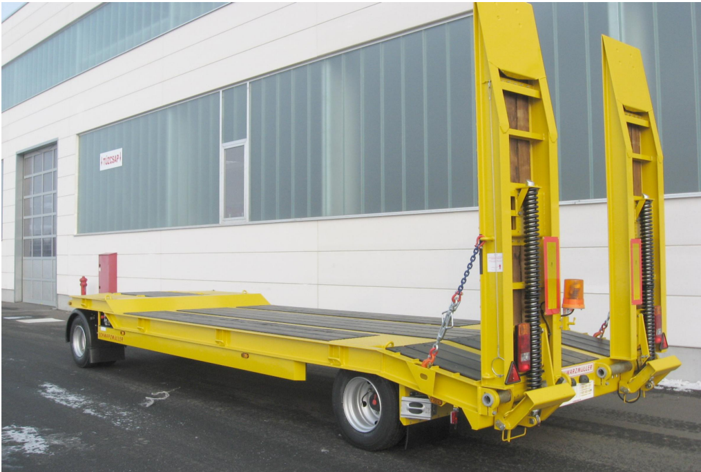
2-axle low loader trailer with offset platform