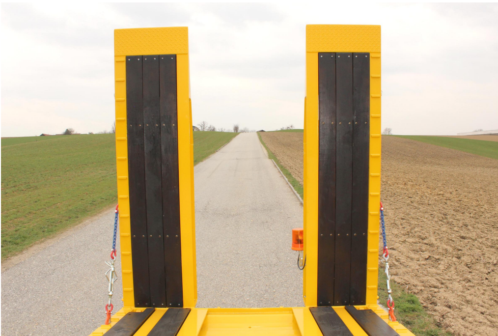
2 folding single-part loading ramps with hardwood flooring