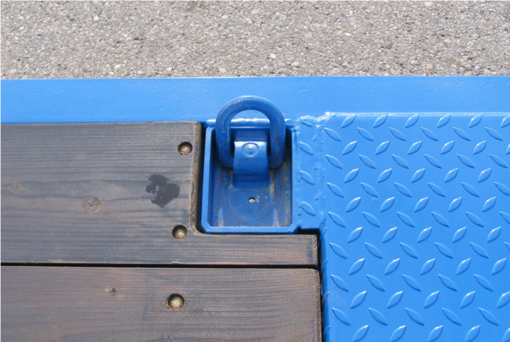
2 pairs of recessed, foldable lashing eyes on the platform