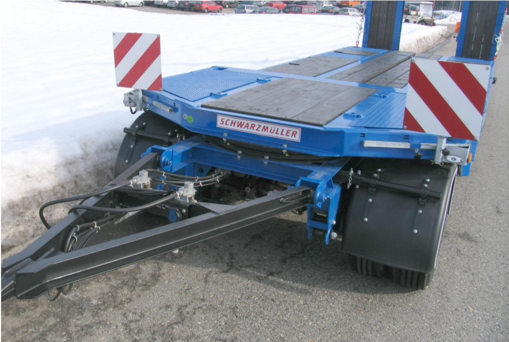
Bogie at front incl. drawbar - OPTIONAL: Pull-out warning signs for transporting wide loads