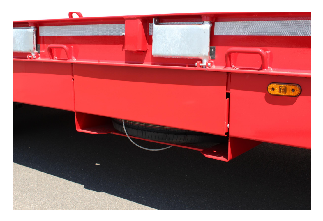
5 pairs of lashing points on the external frame