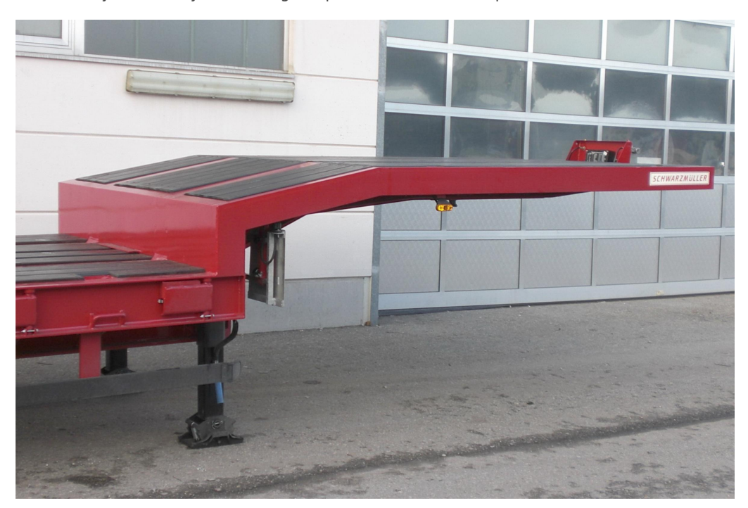
Offset platform raised at the front