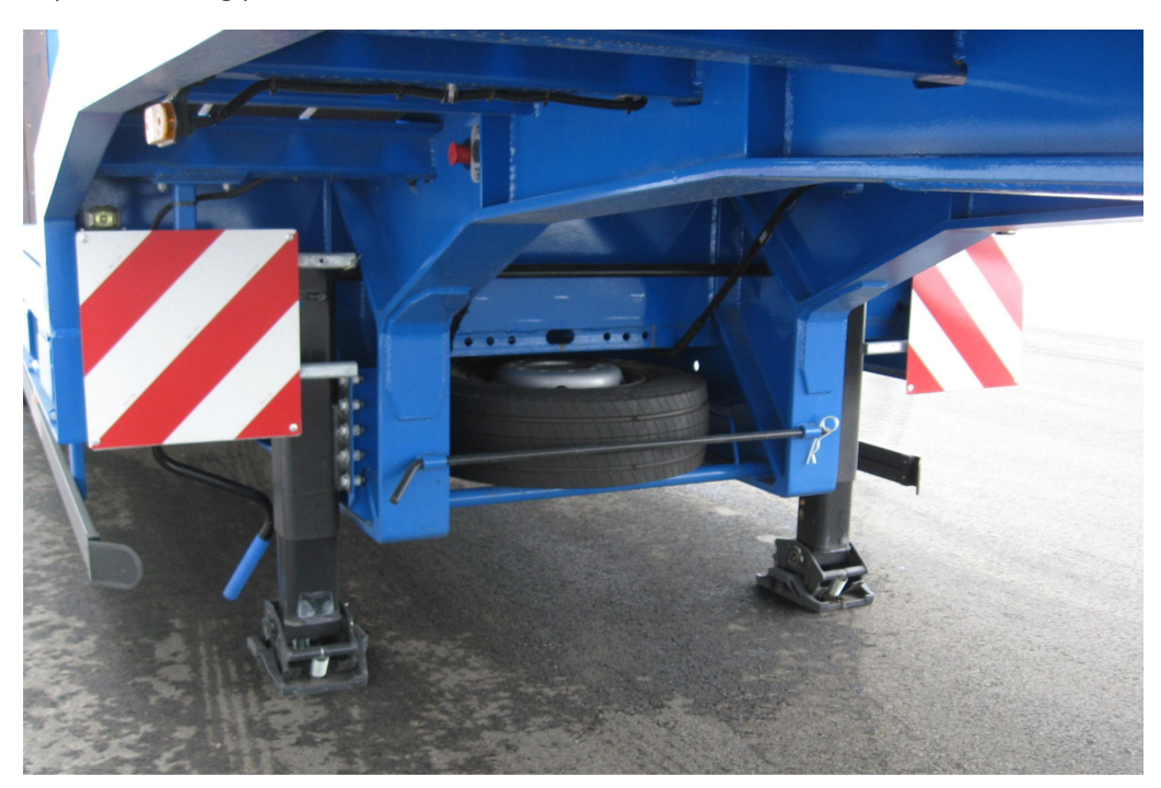
Welded steel construction - high point loading due to narrow cross member spacing