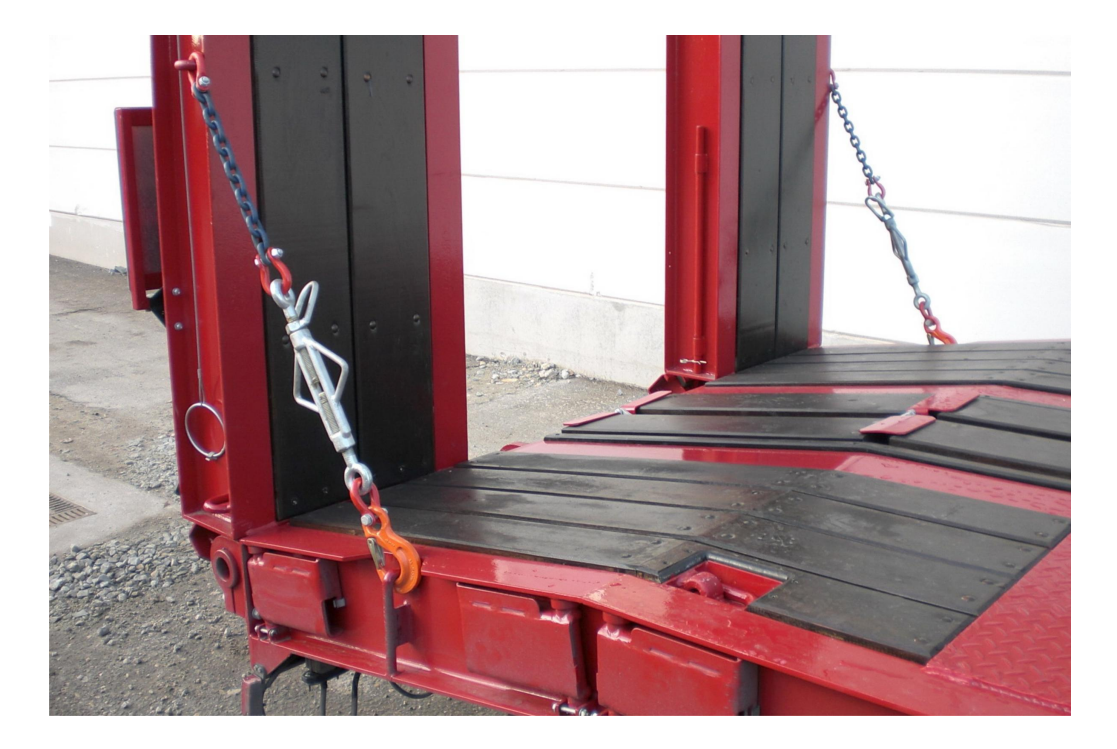
Additionally secured by the loading ramp chains for safe transport