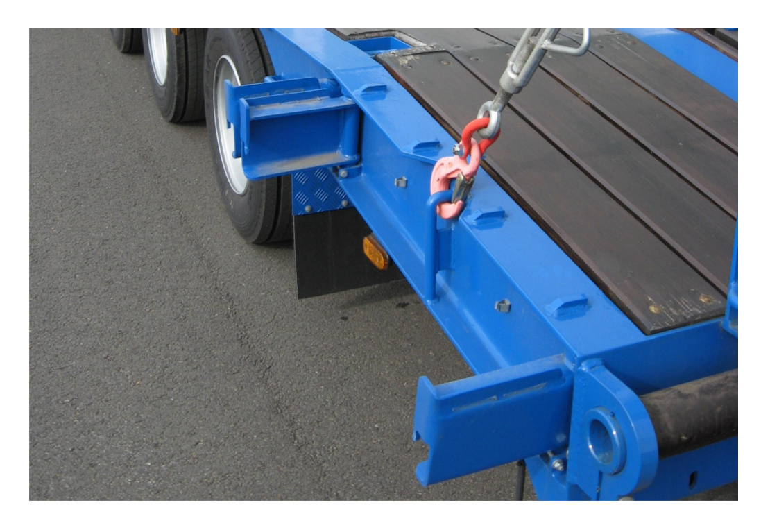
Foldable, pivoting extensions, incl. extension planks for transporting wide loads