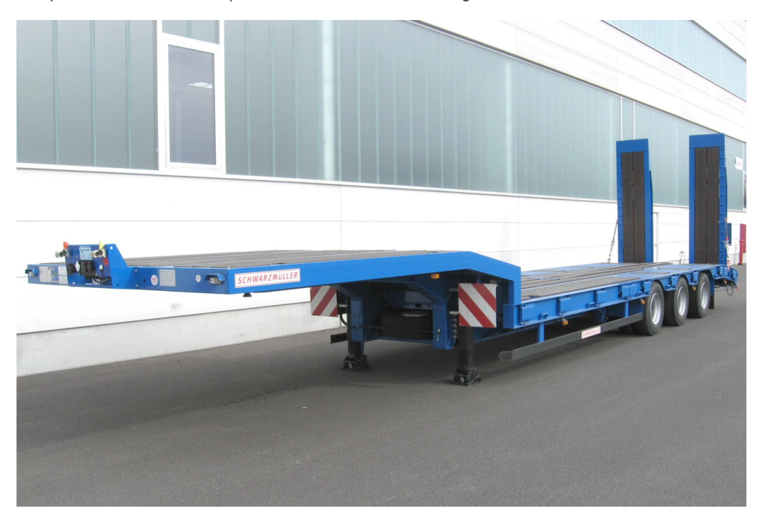
3-axle low loader semitrailer