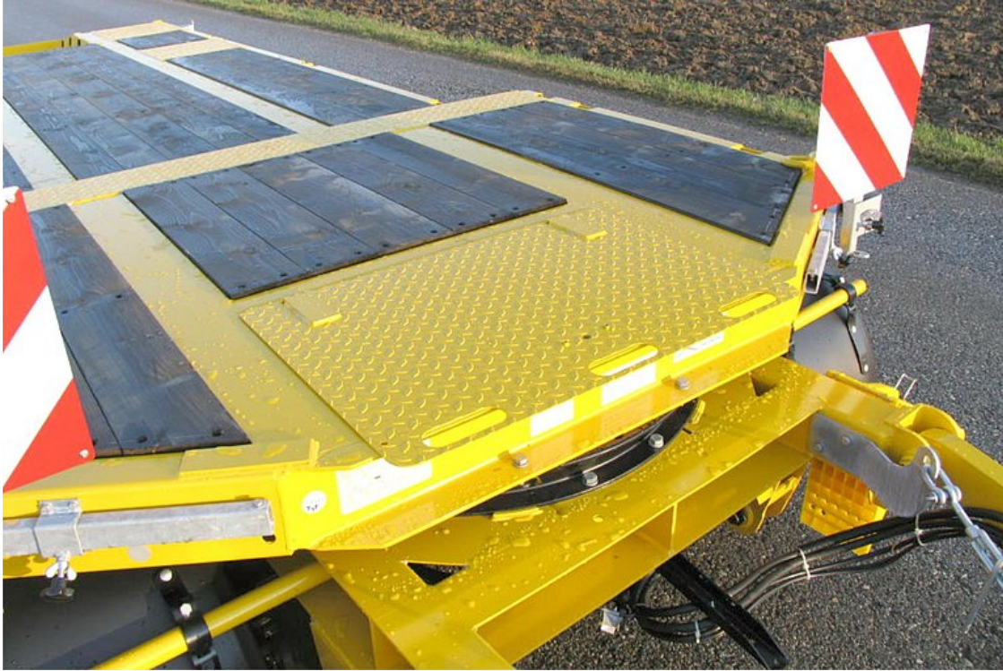
Front offset platform with accessory compartment including lid