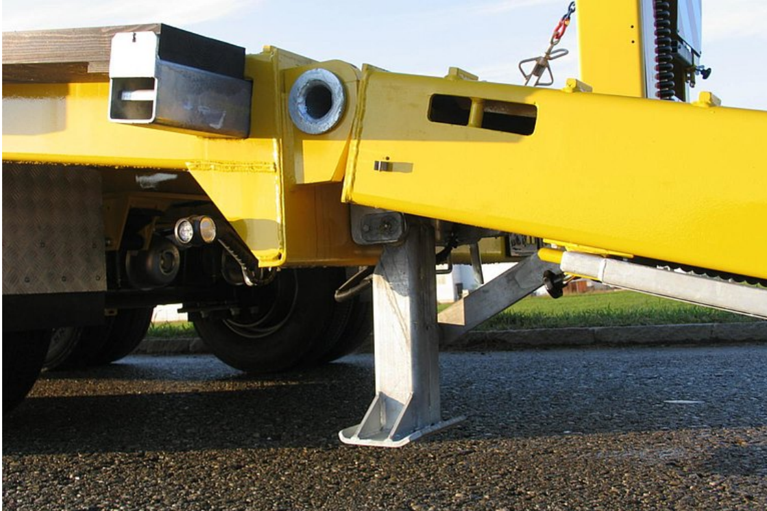
1 automatic folding support per ramp and frame end at rear end