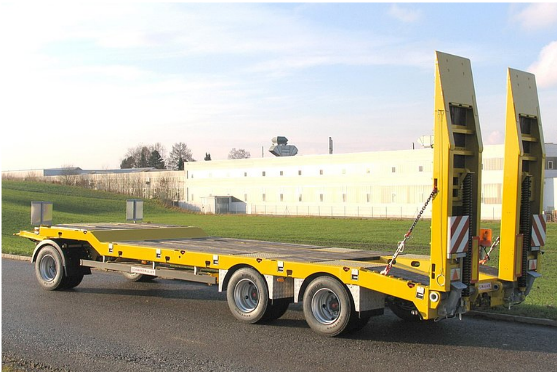
3-axle low loader trailer