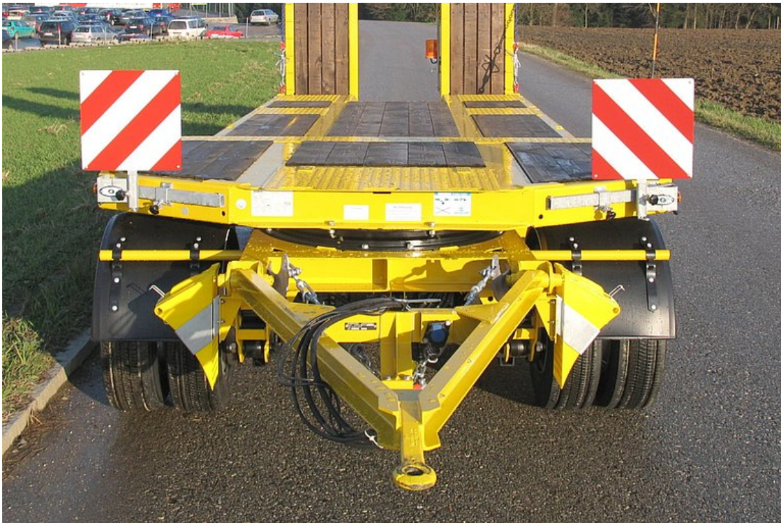
Bogie at front incl. drawbar and pull-out warning signs on frame for transporting wide loads