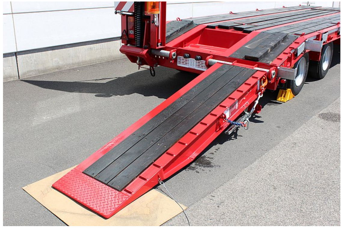
Loading ramps with hardwood flooring and welded square ribs