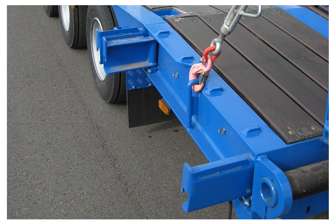
Foldable, pivoting extensions, incl. extension planks for transporting wide loads