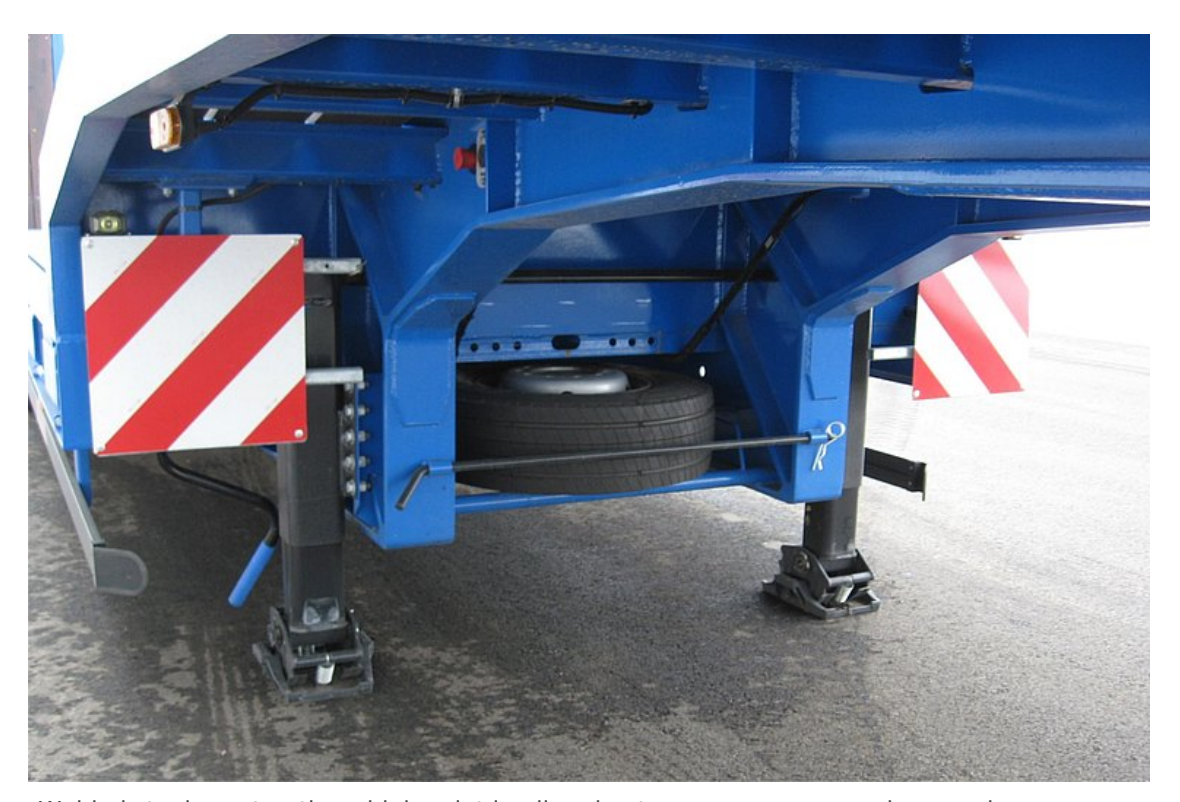
Welded steel construction - high point loading due to narrow cross member spacing