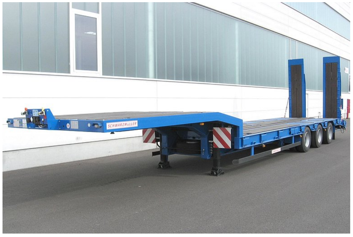
3-axle low loader semitrailer