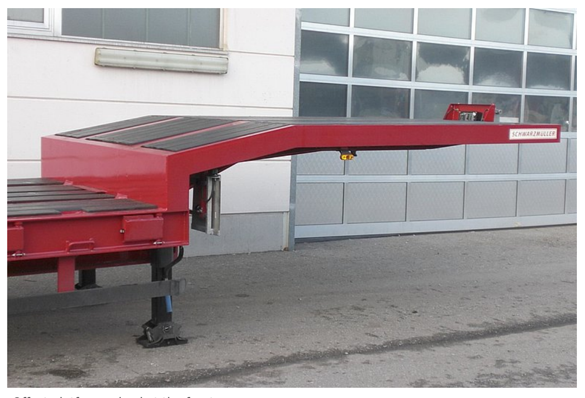
Offset platform raised at the front