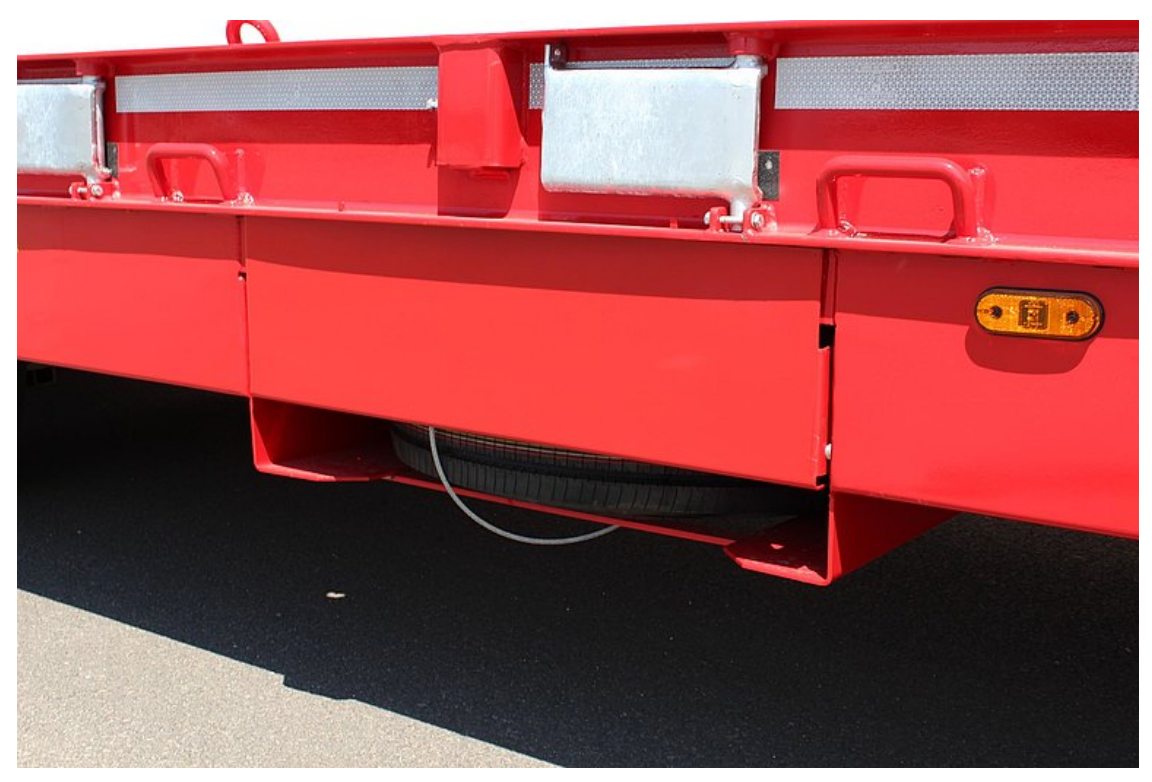
5 pairs of lashing points on the external frame