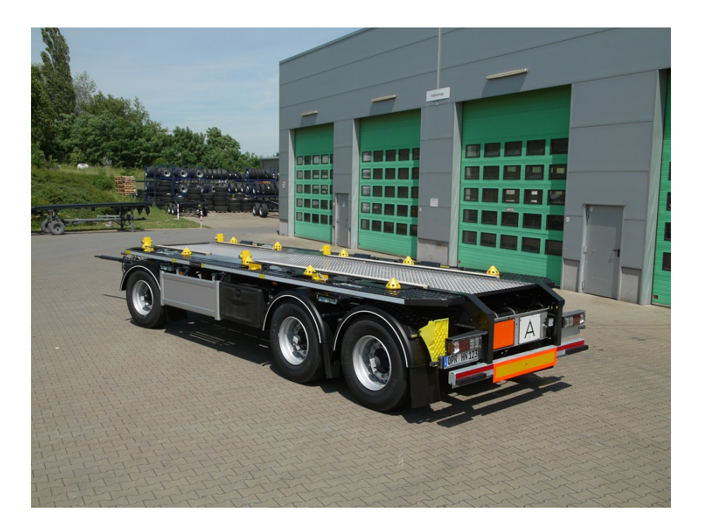
OPTIONAL: Geschlossener Boden und Safety Fix