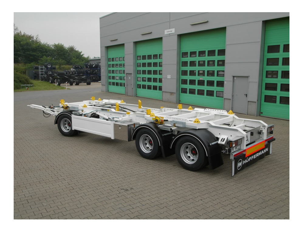
Sonderausstattung Müllpressen - Ausstattung Tailguard Sonderlackierung