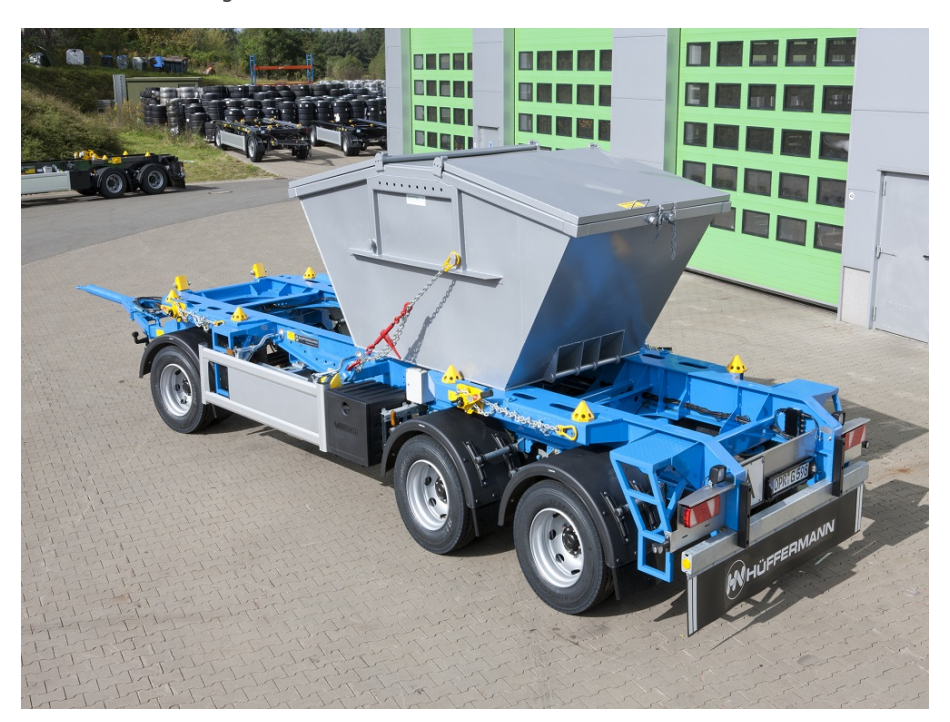
Vario Carrier zum Transport von einem Absetzbehälter im Nutzlastschwerpunkt