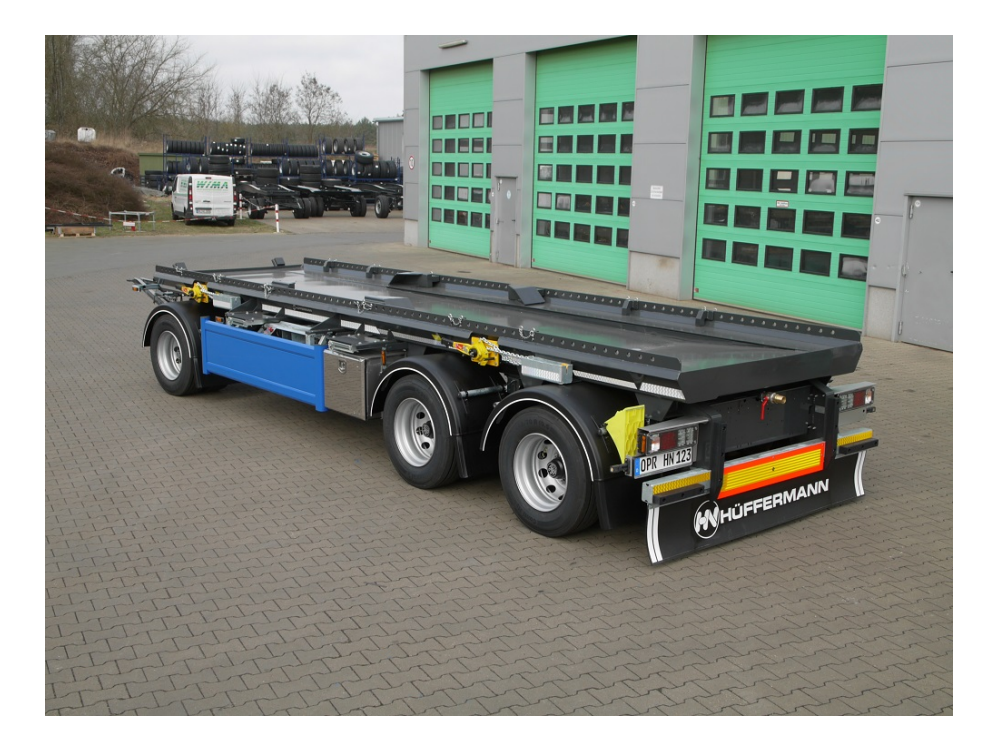
Sonderausstattung mit wasserdicher Bodenwanne