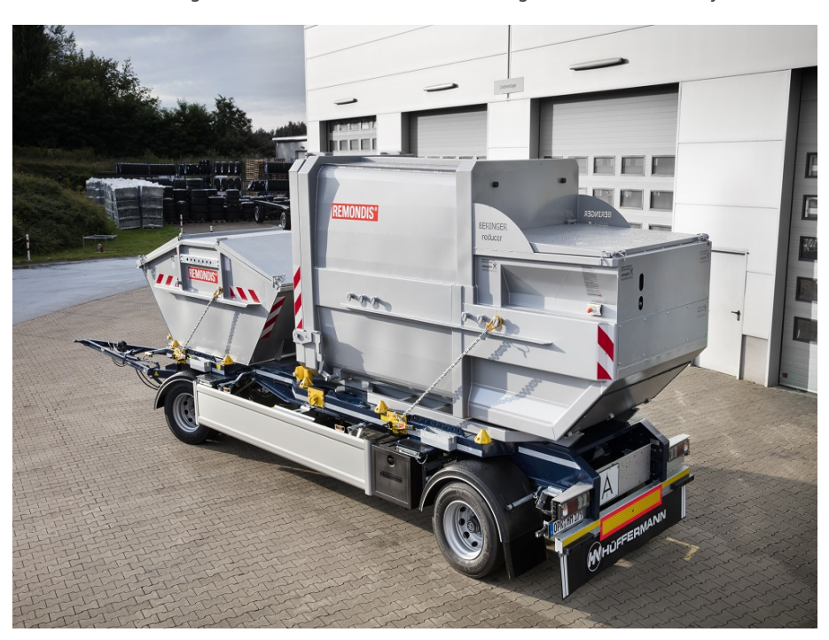
Vario Carrier für zwei Absetzbehälter mit Mulde und Müllpresse