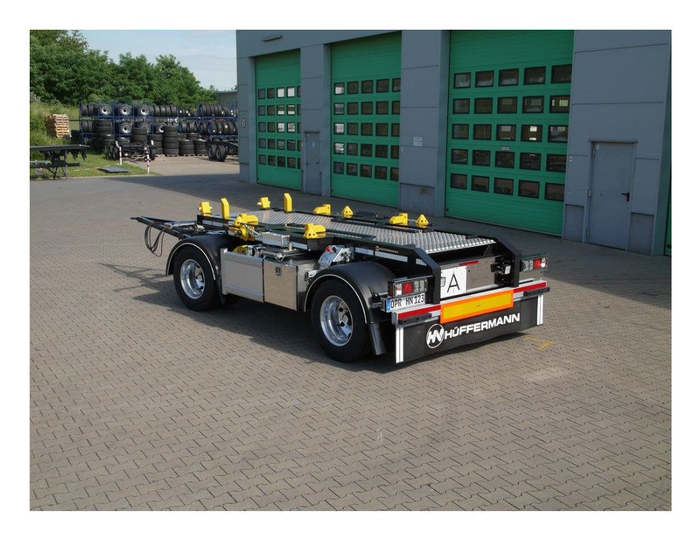
Sonderausstattung für einen Absetzbehälter mit elegance edition, SafetyFix und Boden für Müllpressen