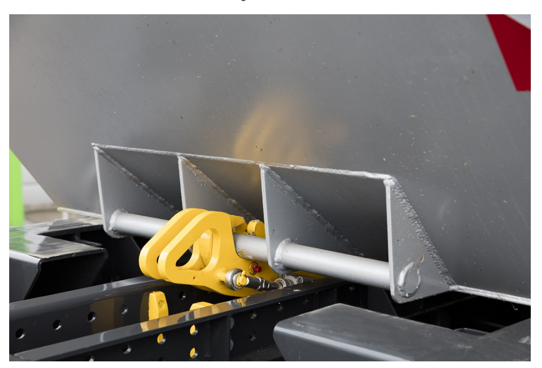
OPTIONAL: Kettenlose Ladungssicherung Multi-Fix