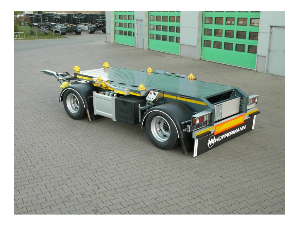
OPTIONAL: Für einen Absetzbehälter mit geschlossenem Boden