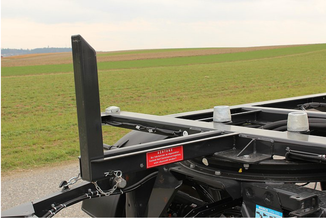
Stop support at front, tiltable and relocatable