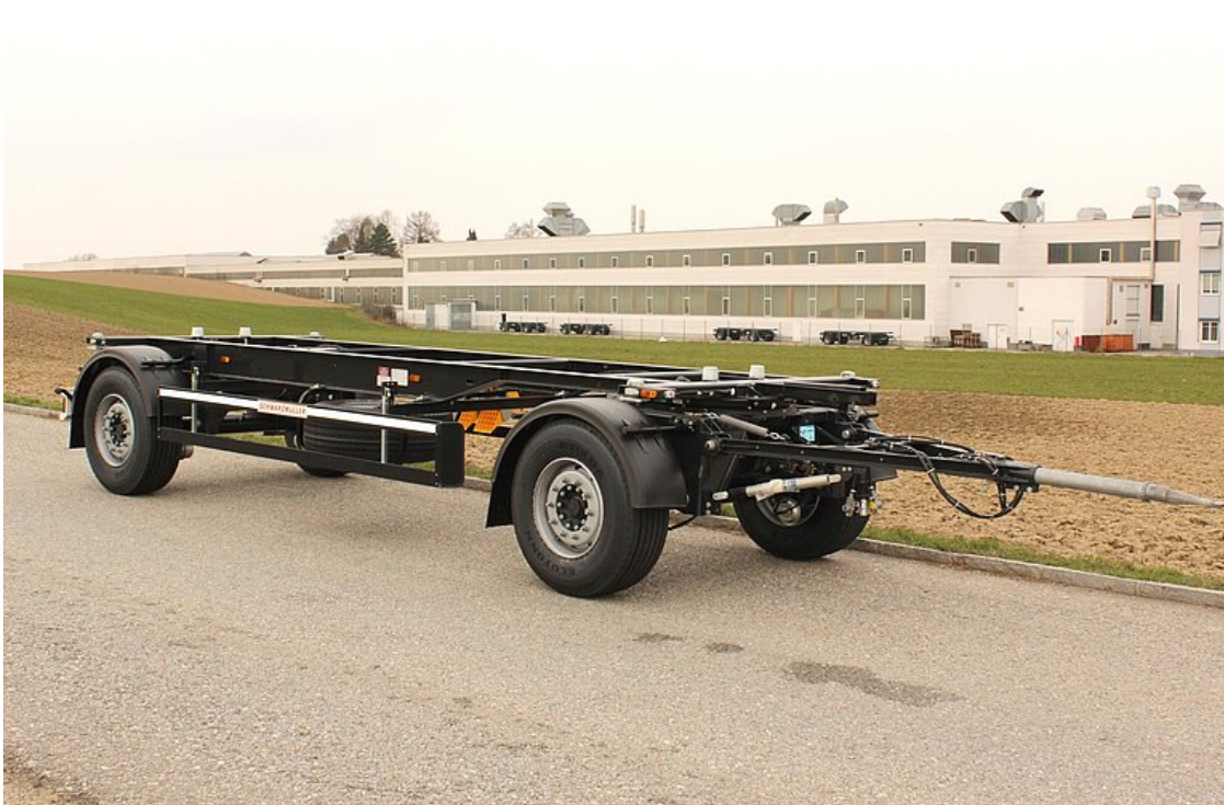
2-axle BDF trailer chassis