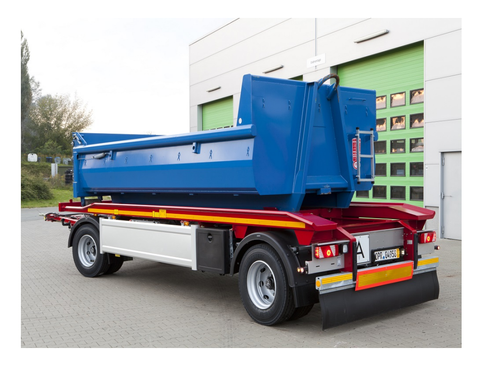
Roll-Carrier flexibel einsetzbar mit kurzem Behälter