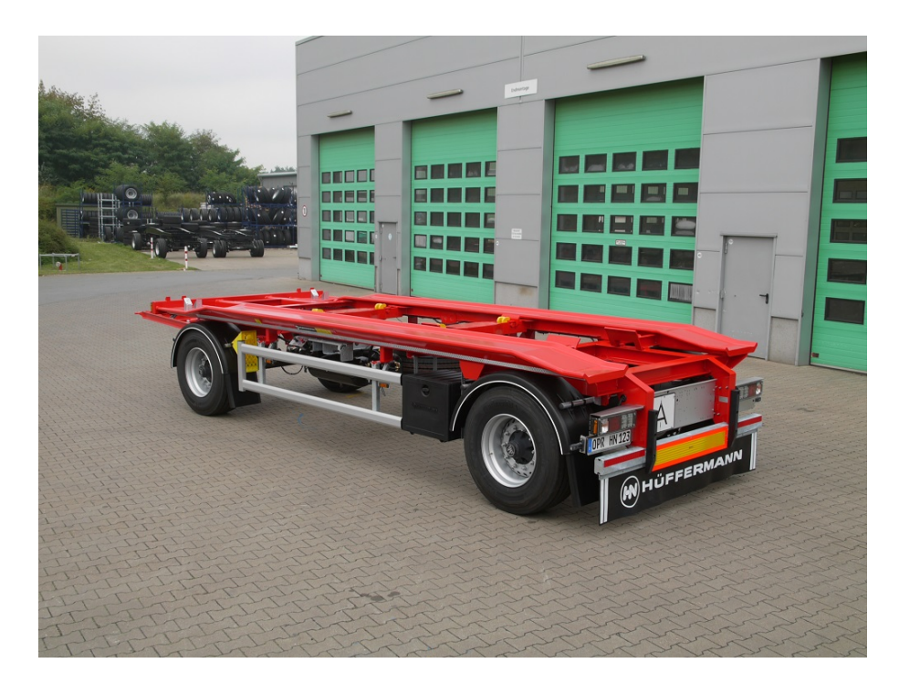
Sonderausführung Laufbahnverbreiterung Innen- und Außenzentrierung