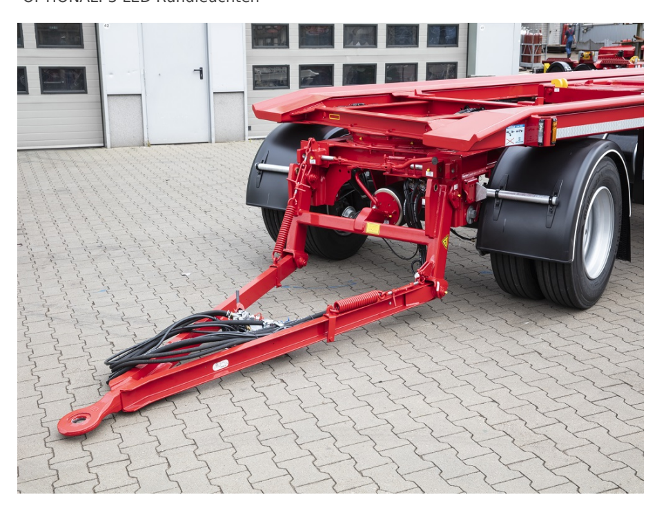
OPTIONAL: Absenkbare Zugdeichsel für Frontbeladung