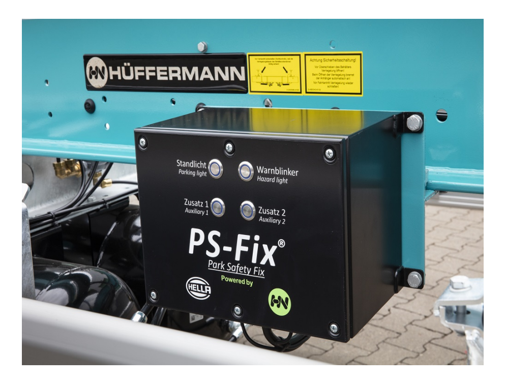
OPTIONAL: Das autarke Beleuchtungssystem für mehr Sicherheit