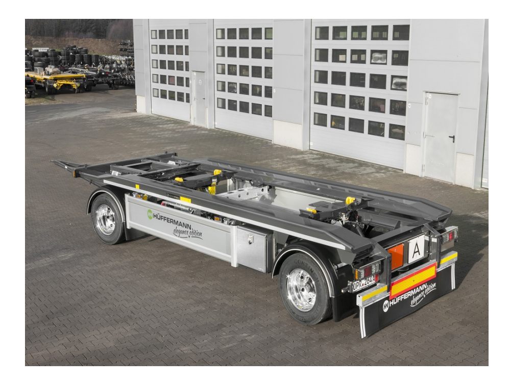
OPTIONAL: elegance edition