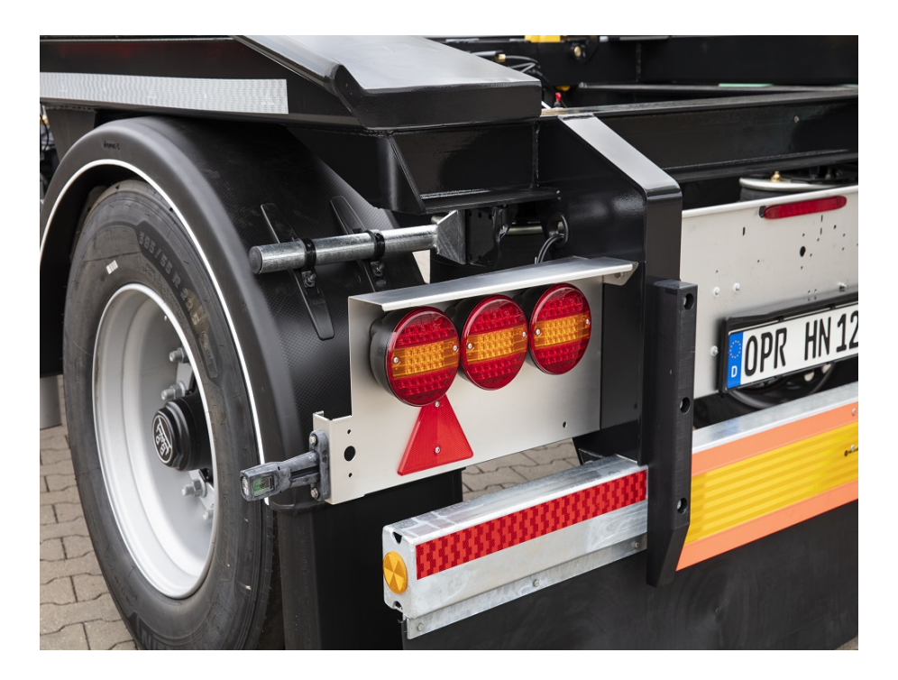
OPTIONAL: 3 LED Rundleuchten