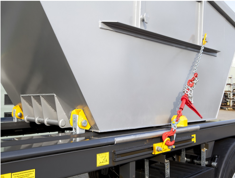
Kombinierte Ladungssicherung mit Zentrier-Fix und Zurrketten