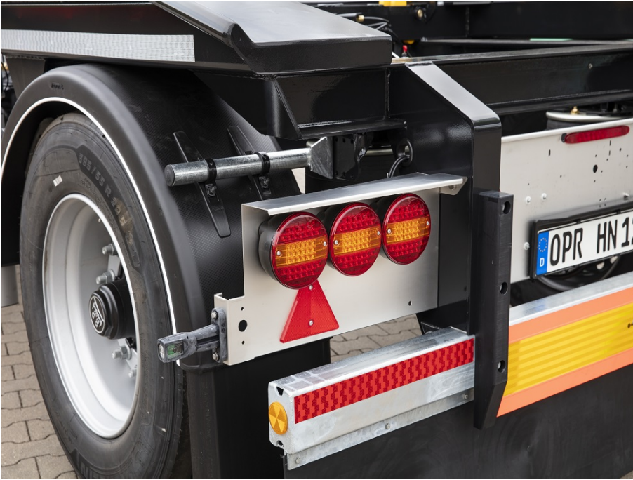
OPTIONAL: 3 LED Rundleuchten