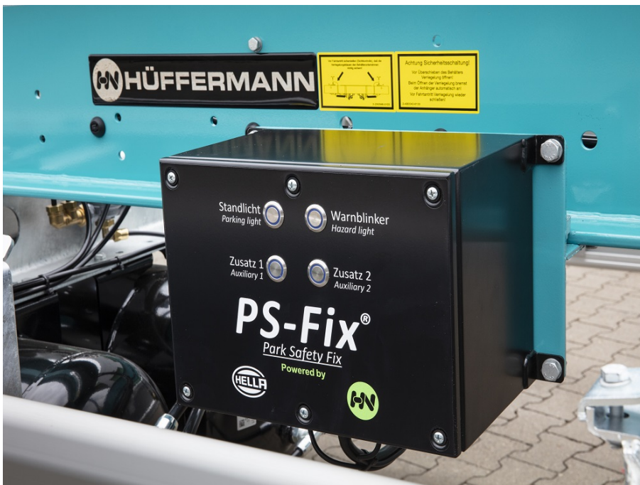
OPTIONAL: Das autarke Beleuchtungssystem für mehr Sicherheit.