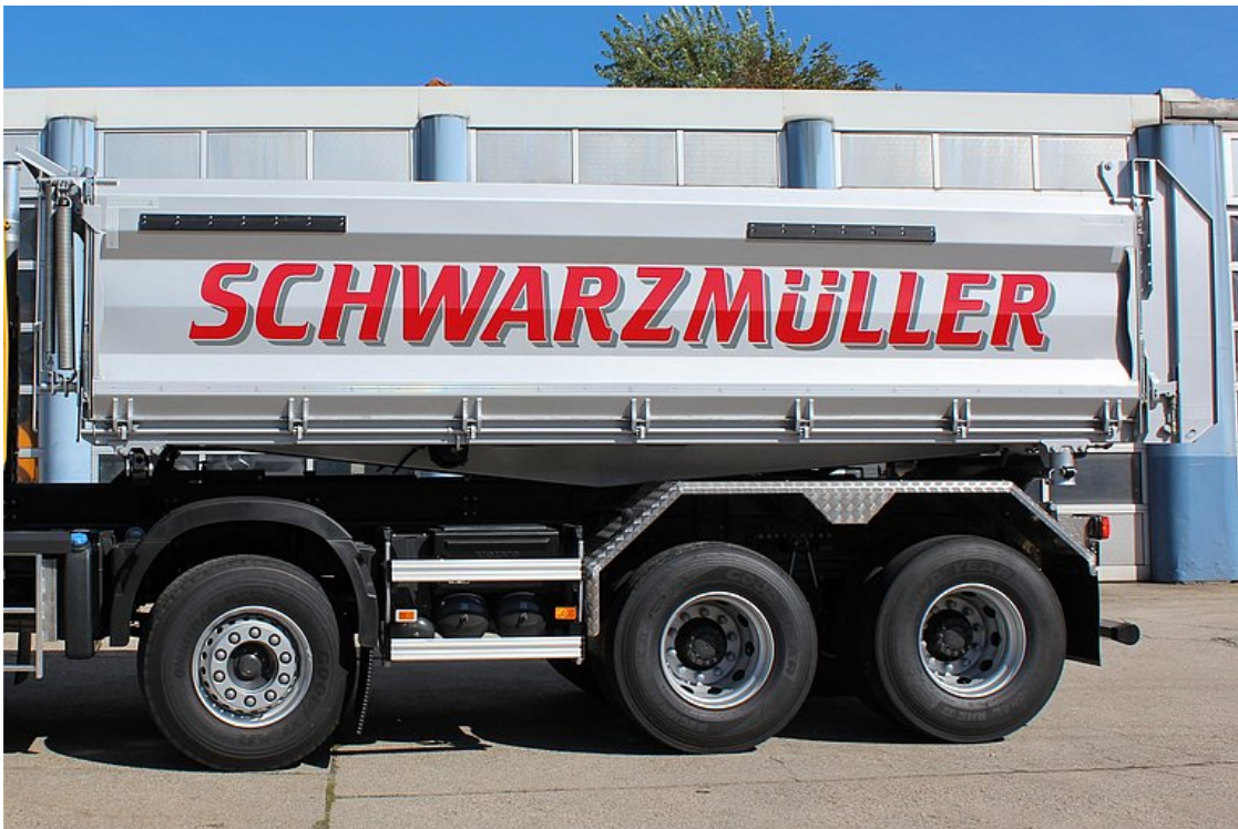
OPTIONAL: Reinforced side walls with material-repellent membrane construction made from fine-grained special steel panels