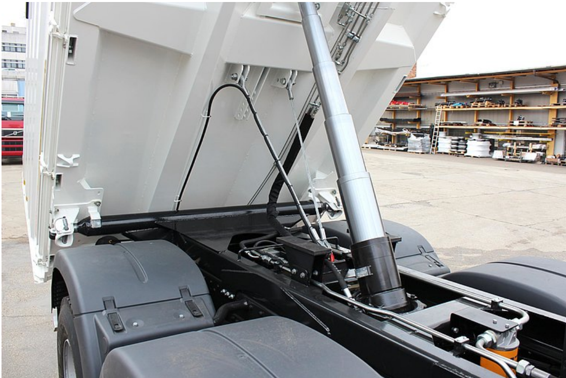
Hard chrome-plated, high-quality tilt cylinder