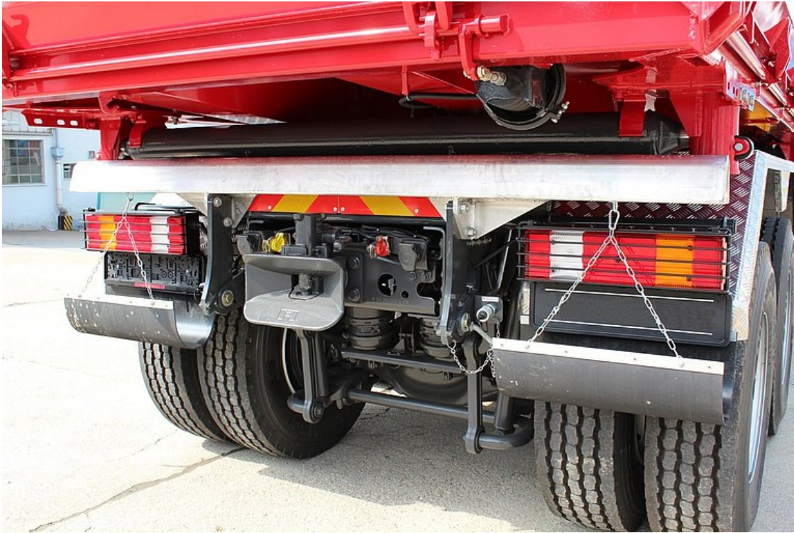
OPTIONAL: Foldable aluminium underride protection for road-finishing use