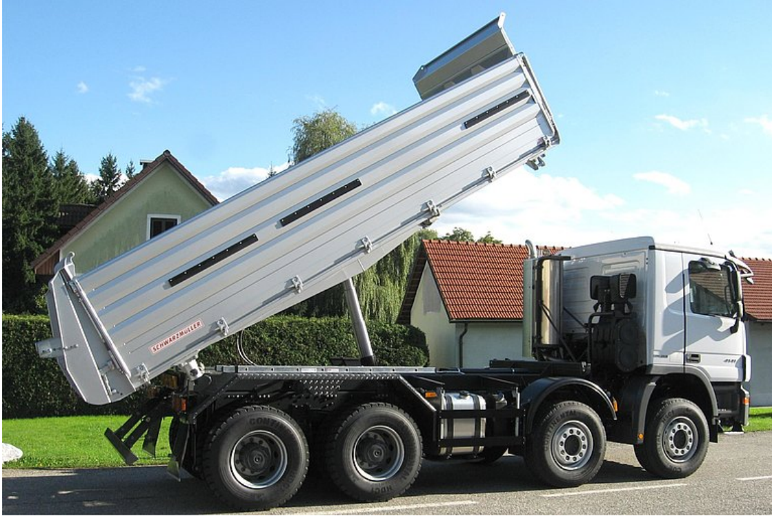
3-way tipper body on 4-axle truck - building site