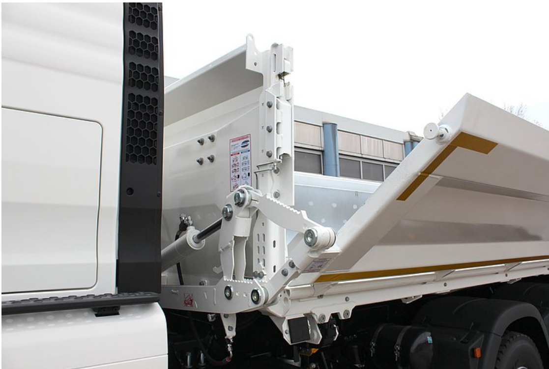
OPTIONAL: Bordmatic (= hydraulically folding side wall) on left side