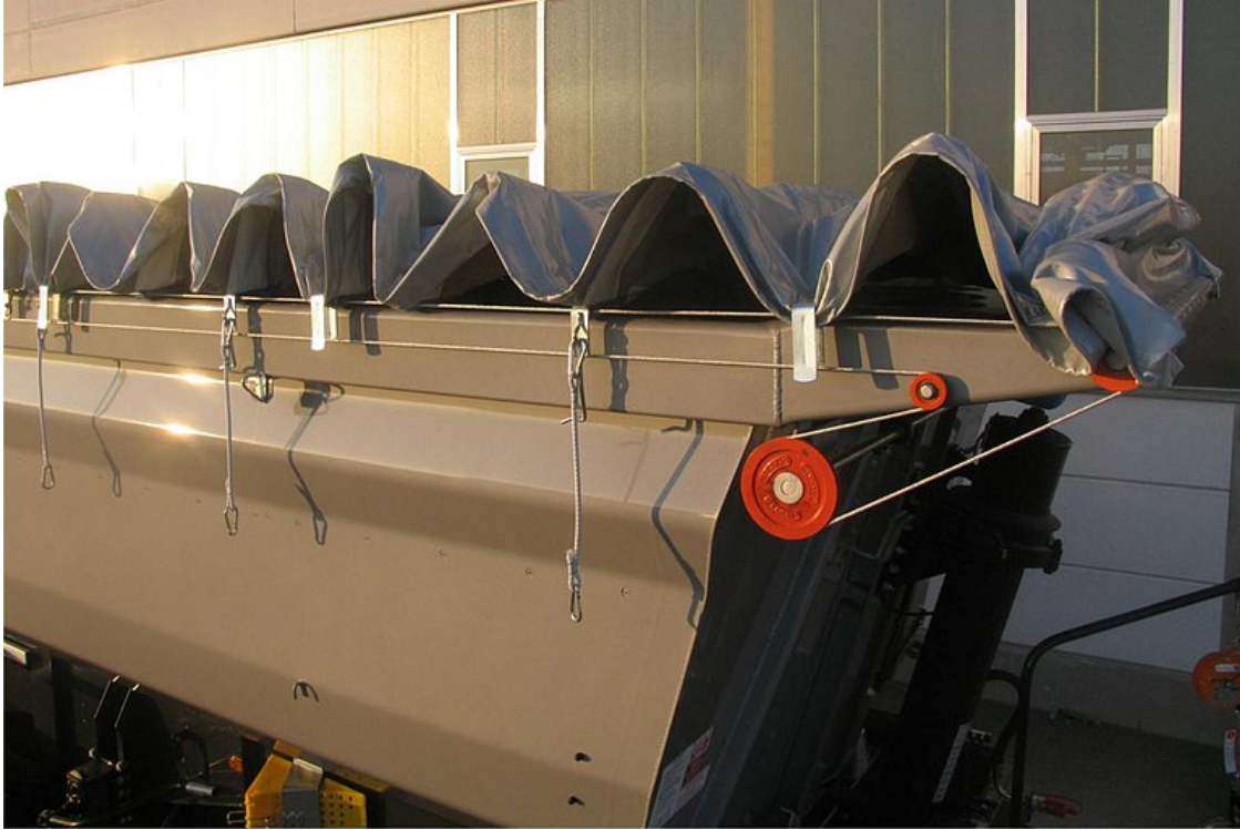
OPTIONAL: Roller cover - operated manually or via electric remote control