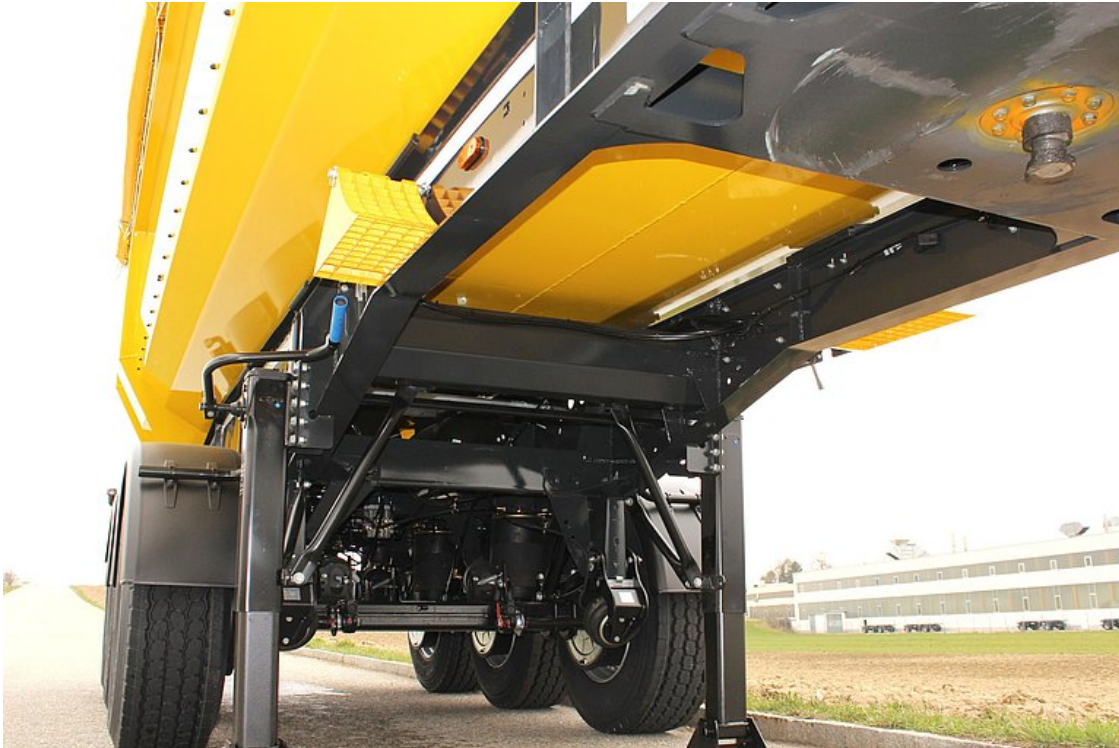
Stable and torsionally rigid chassis design with additional torsion tubes