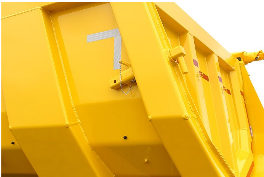
OPTIONAL: Dosing unit for hinged rear wall with pull-out pipe stop