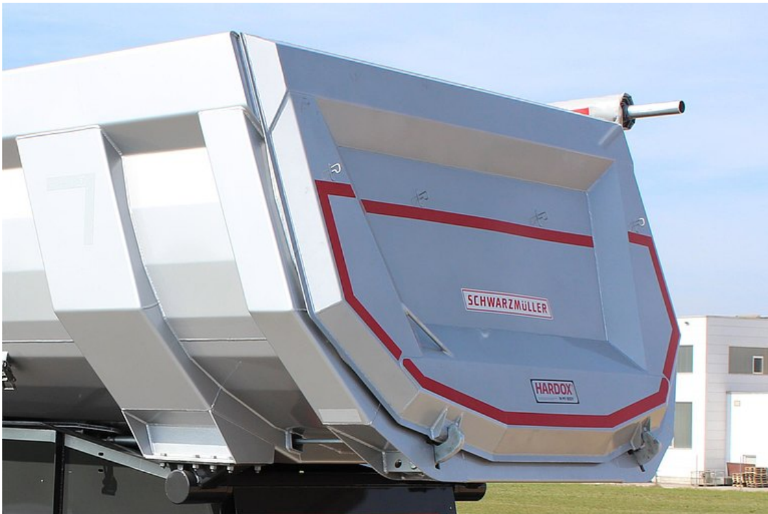
OPTIONAL: External rear wall for higher load volume