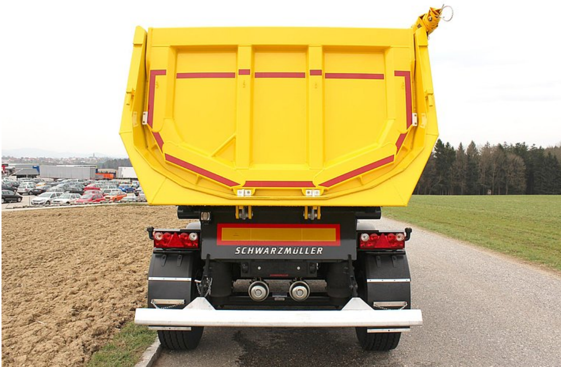
Rear wall = hinged wall with recessed bearing and autom. mech. dual-hook central locking