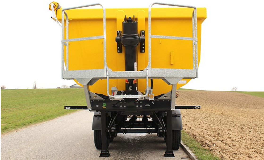
Standing platform on the front wall for operating the roller tarpaulin