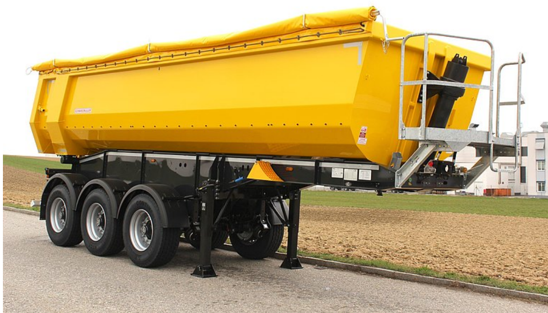
3-axle aluminium segment tipper semitrailer