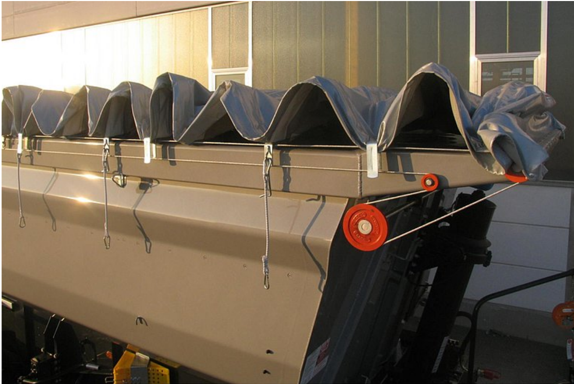
OPTIONAL: Roller cover - operated manually or via electric remote control