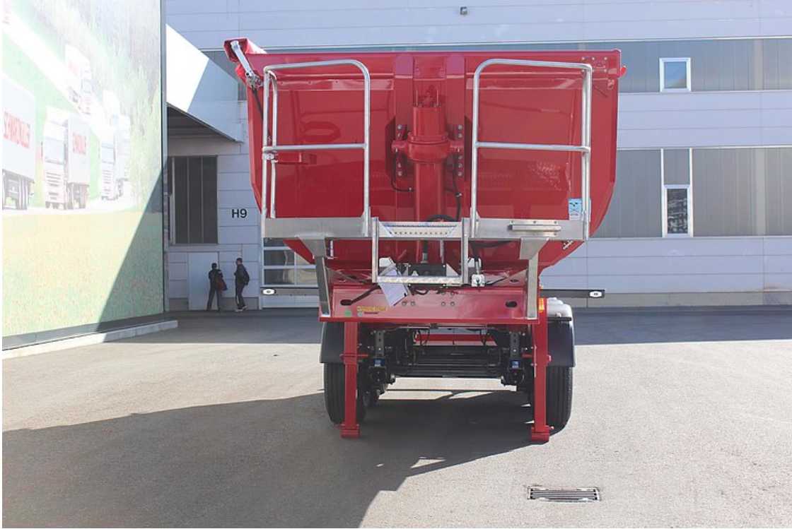
Insulated front wall with hard chrome-plated, high-grade front tilt cylinder