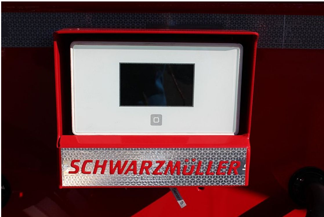
Temperature analysis unit in a sturdy box