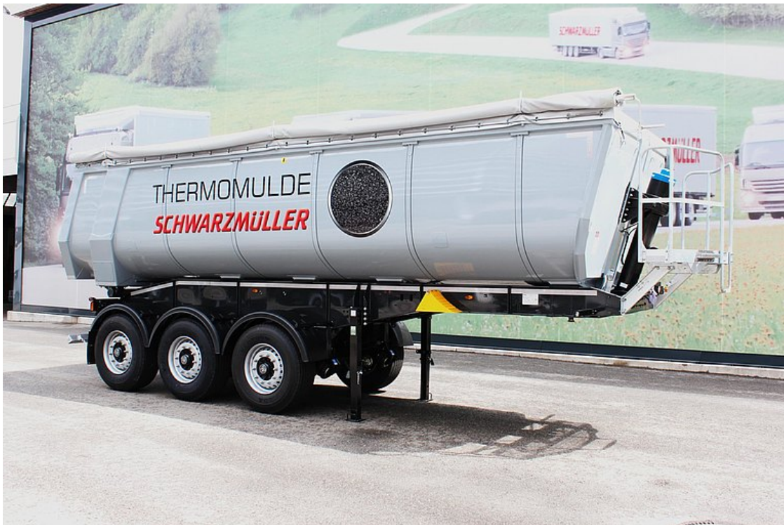
Stable, torsionally rigid Naxtra chassis design with additional torsion tubes for high tipping stability