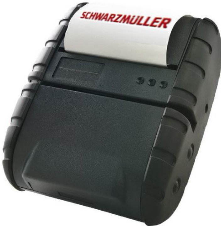
Mobile printer unit