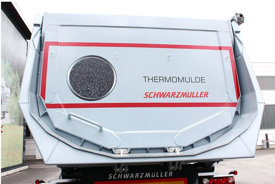
Insulated rear wall = hinged wall with recessed bearing and autom. mech. 2-hook central locking