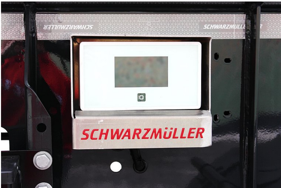
Temperature analysis unit in a sturdy box