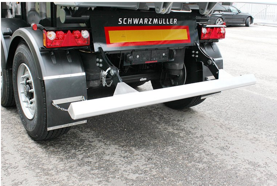
Folding aluminium trapezoidal underride protection, can be folded up pneumatically as an option