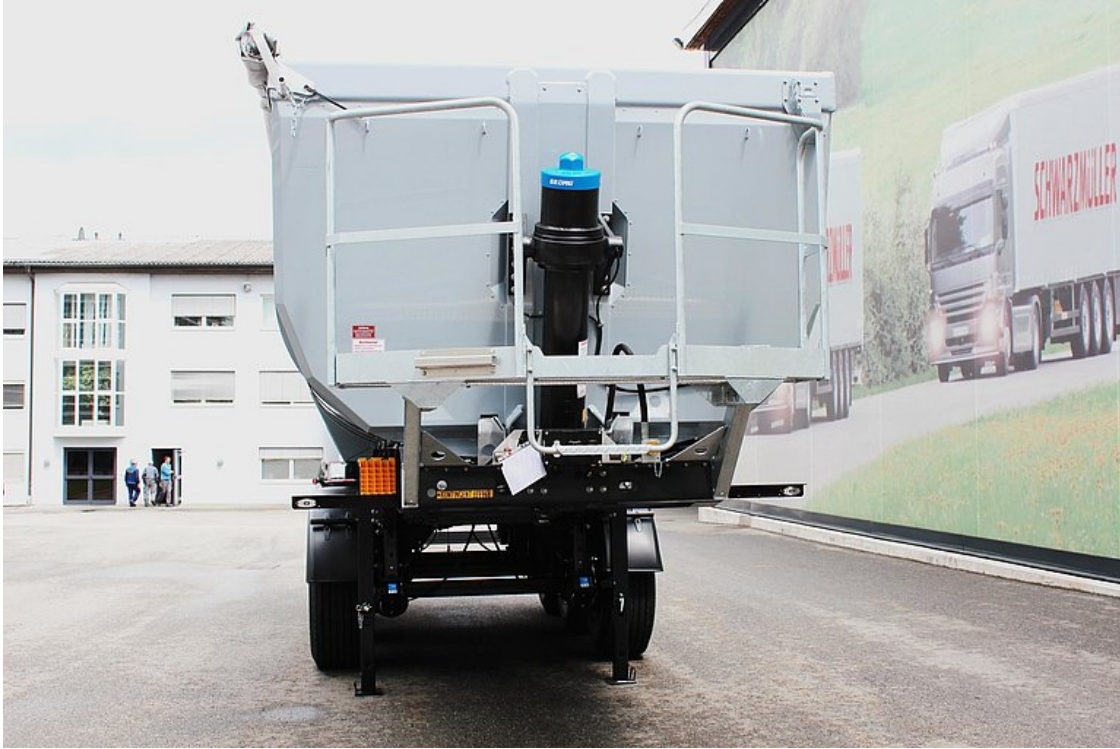
Insulated front wall with hard chrome-plated, high-grade front tilt cylinder