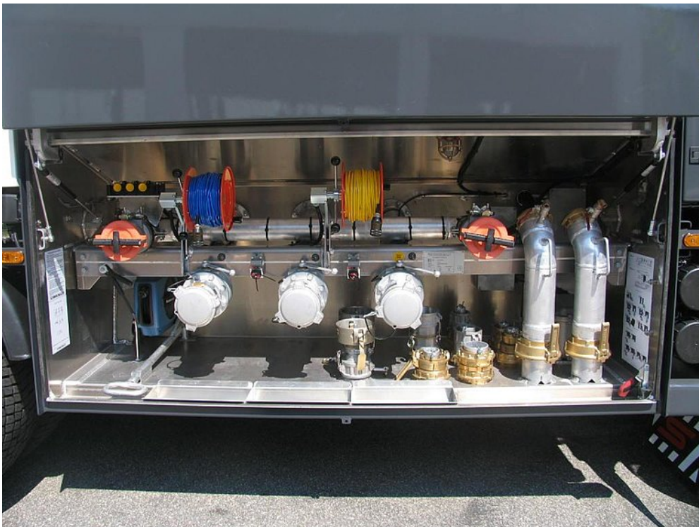
Fittings cabinet with parallel sliding cabinet doors