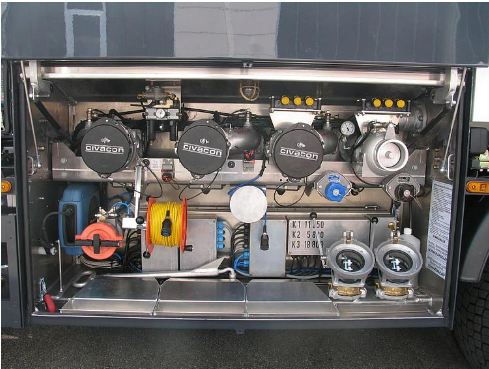
Structured and clear arrangement of fittings for efficient and fault-free operation