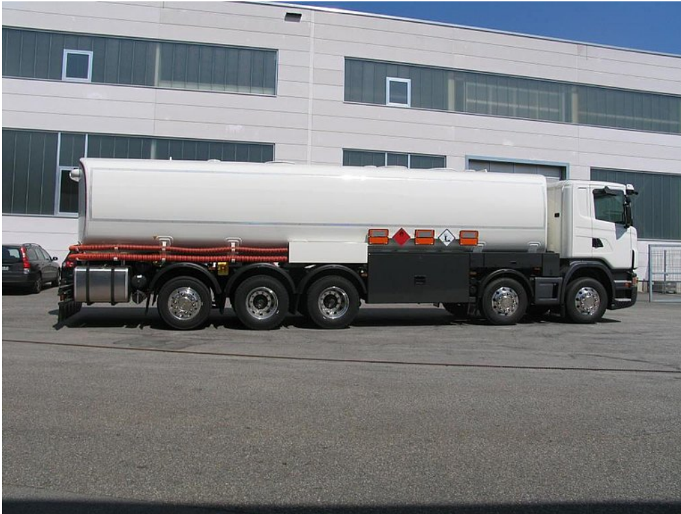
Modern design and maximum vehicle functionality