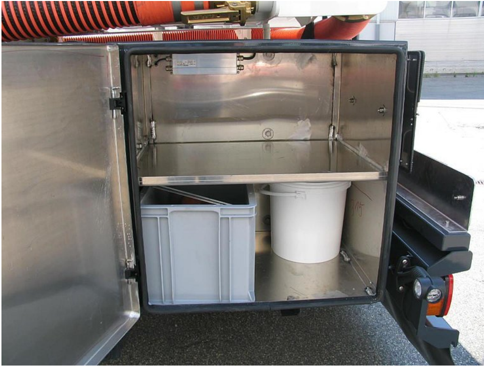
OPTIONAL: Accessories box with side-opening door offers plenty of storage space