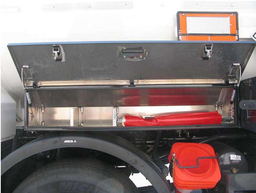
OPTIONAL: Special accessories box with side-opening door offers even more storage space