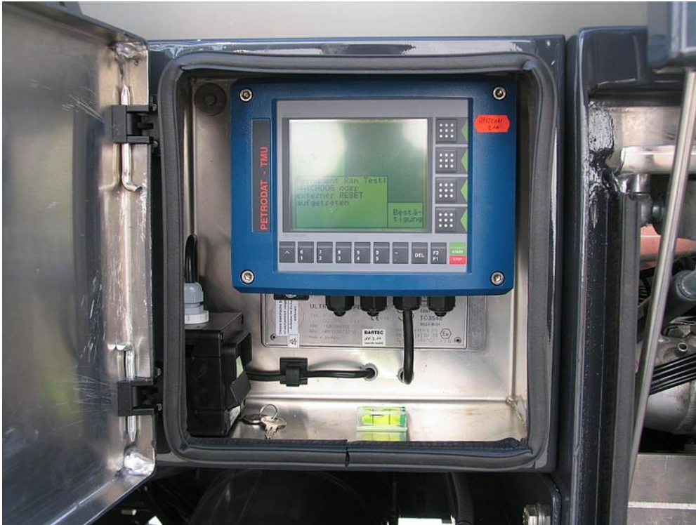
Separate aluminium boxes on the left and right for dipstick operation with a small spirit level