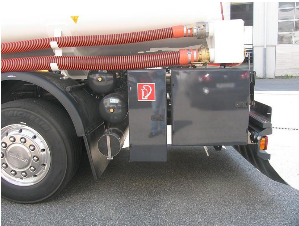
Aluminium box for 12 kg fire extinguisher and accessories box