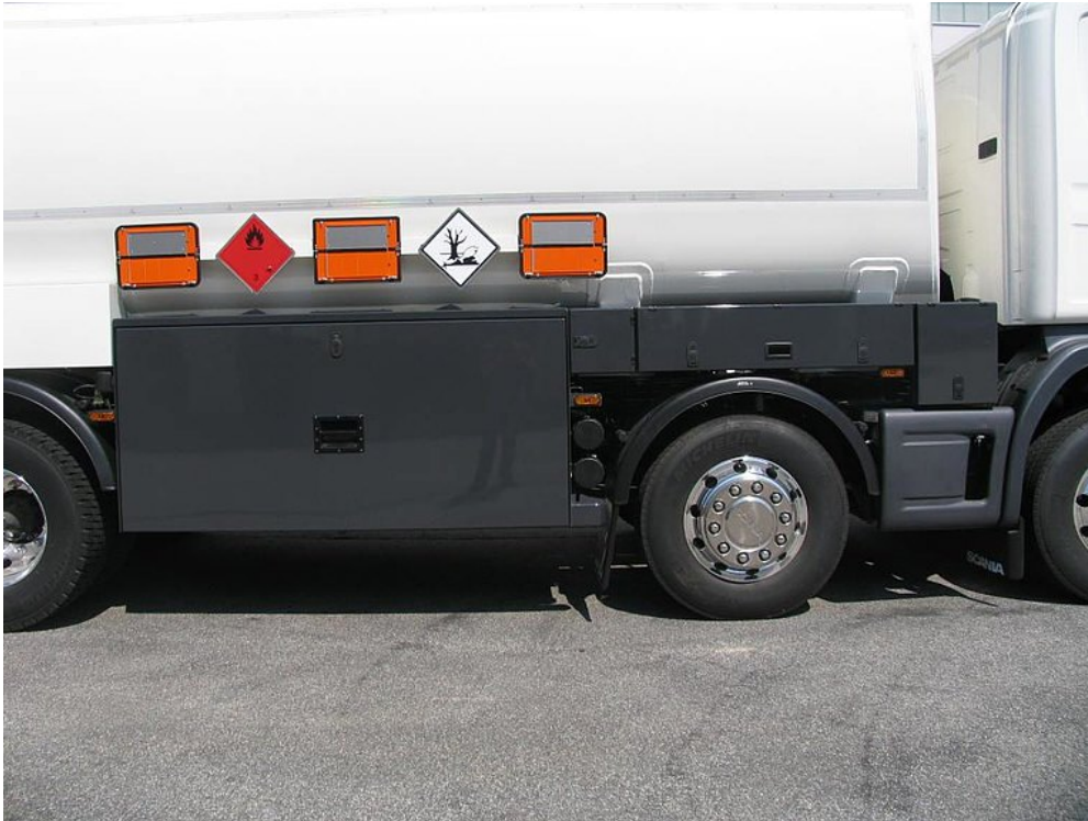
Ideal arrangement of signage