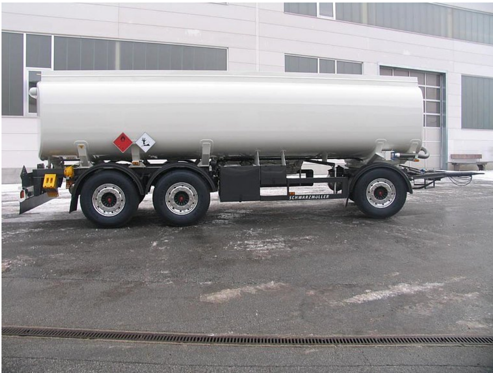
Modern design and maximum vehicle functionality