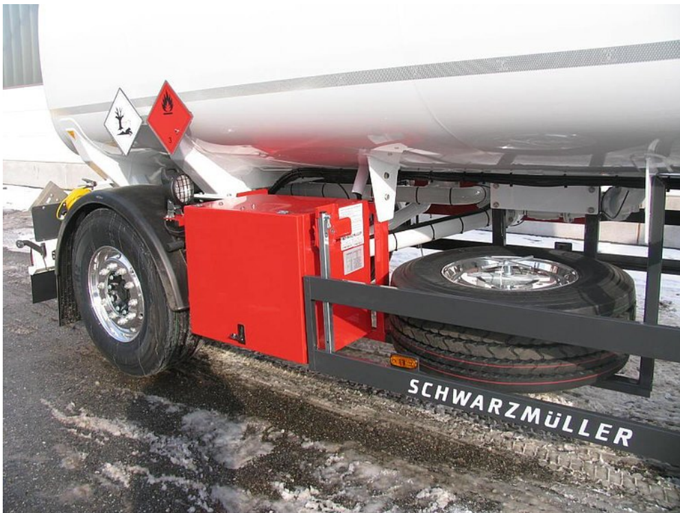
OPTIONAL: Facility for mounting spare wheel bracket