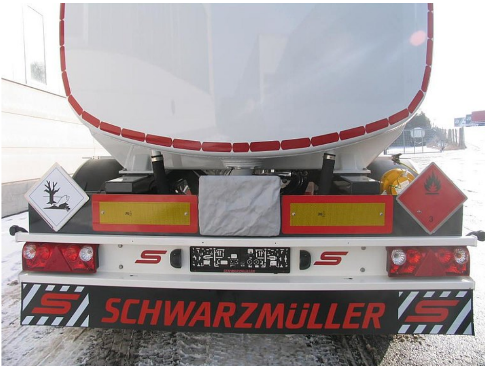
OPTIONAL: Choice of aluminium or steel bumper