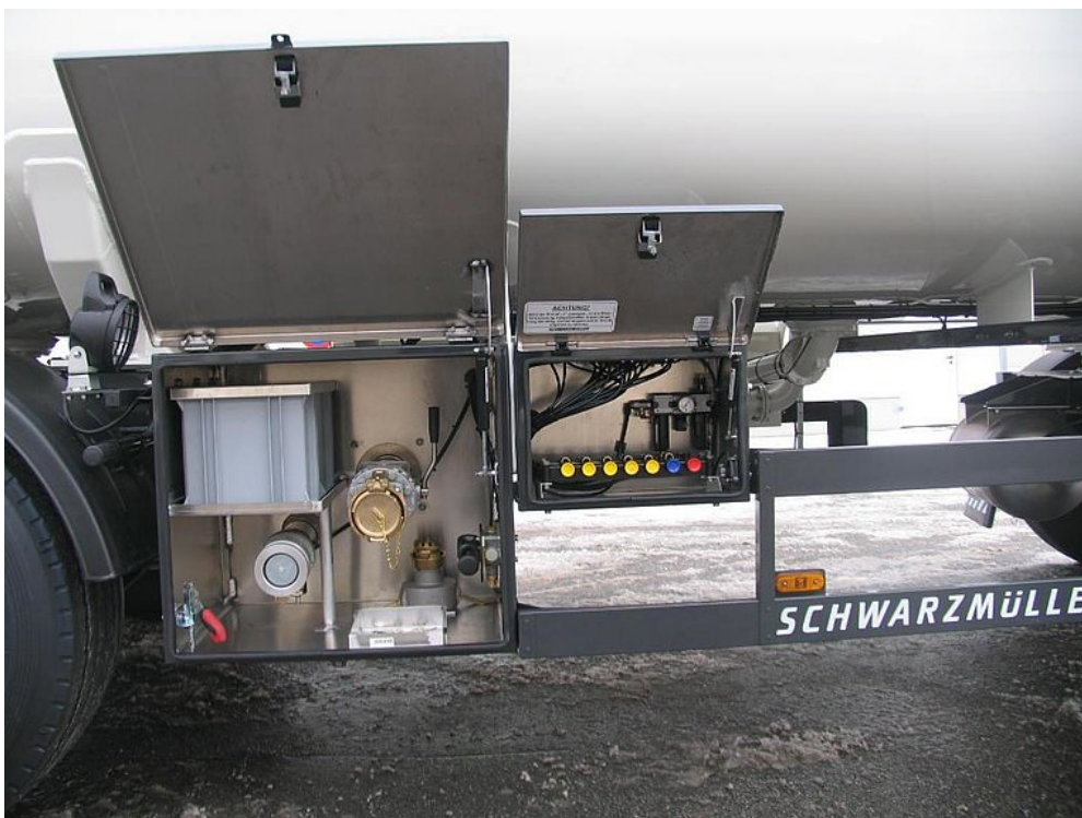
Discharge box with upward-opening door to protect the fittings incl. box for pneumatic valve control