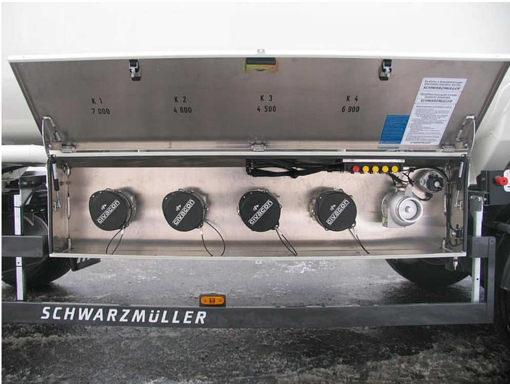
Structured and clear arrangement of fittings for efficient and fault-free operation