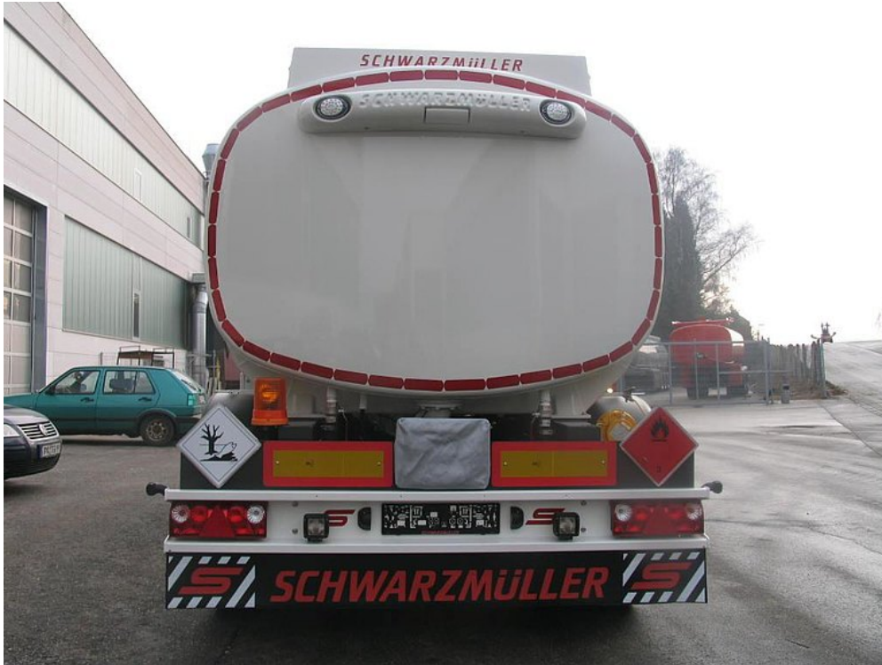
OPTIONAL: High-set LED light holder with optional integration of reversing camera