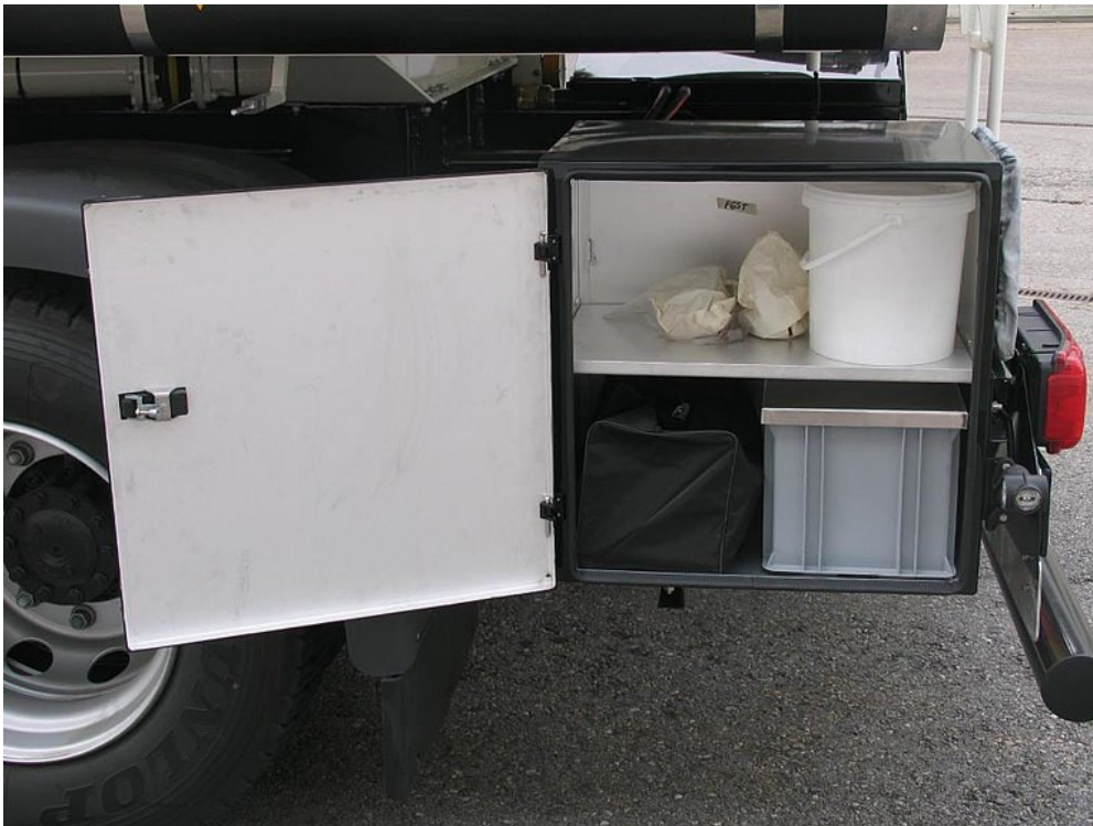
Accessories box with side-opening door offers plenty of storage space