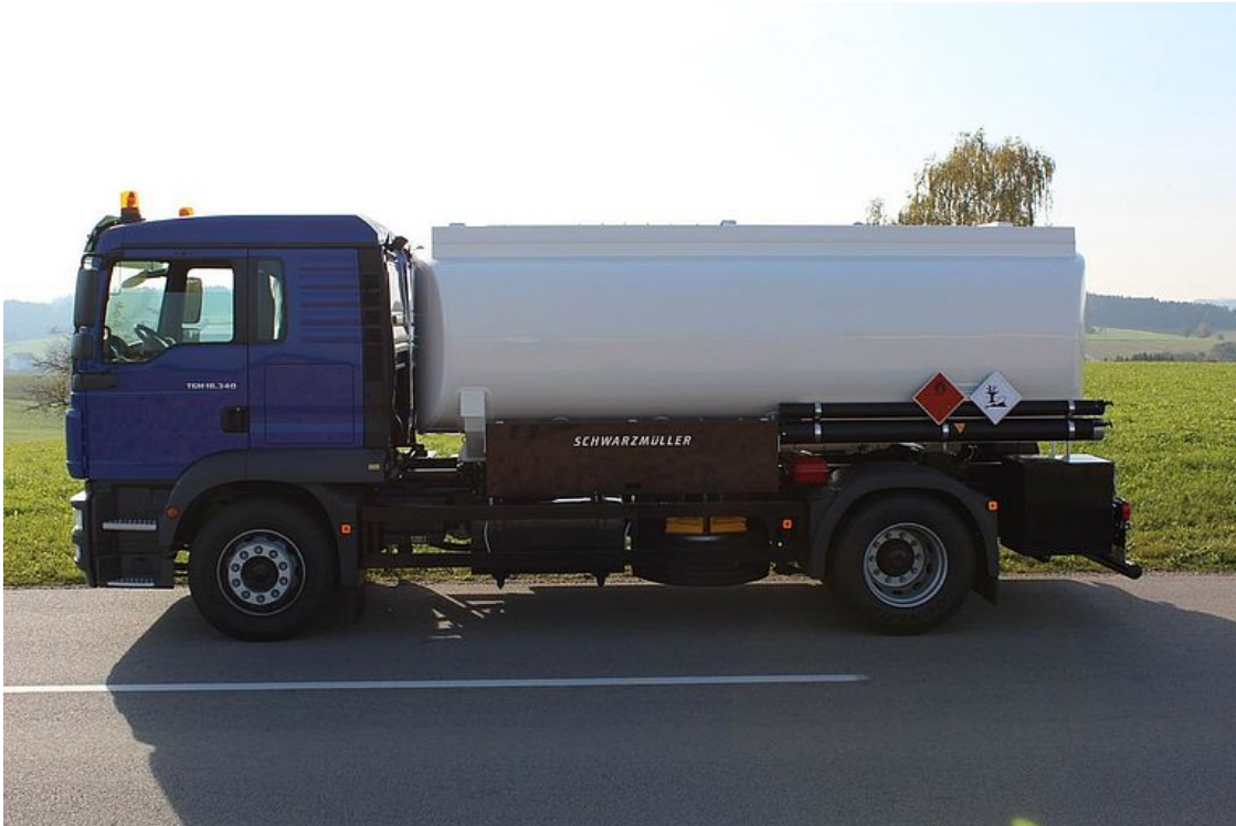
Modern design and maximum vehicle functionality