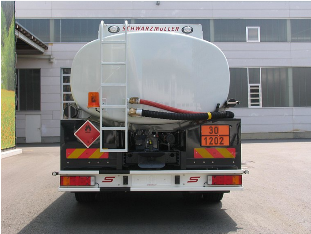
OPTIONAL: 2 high-set tail lights mounted in overflow pan