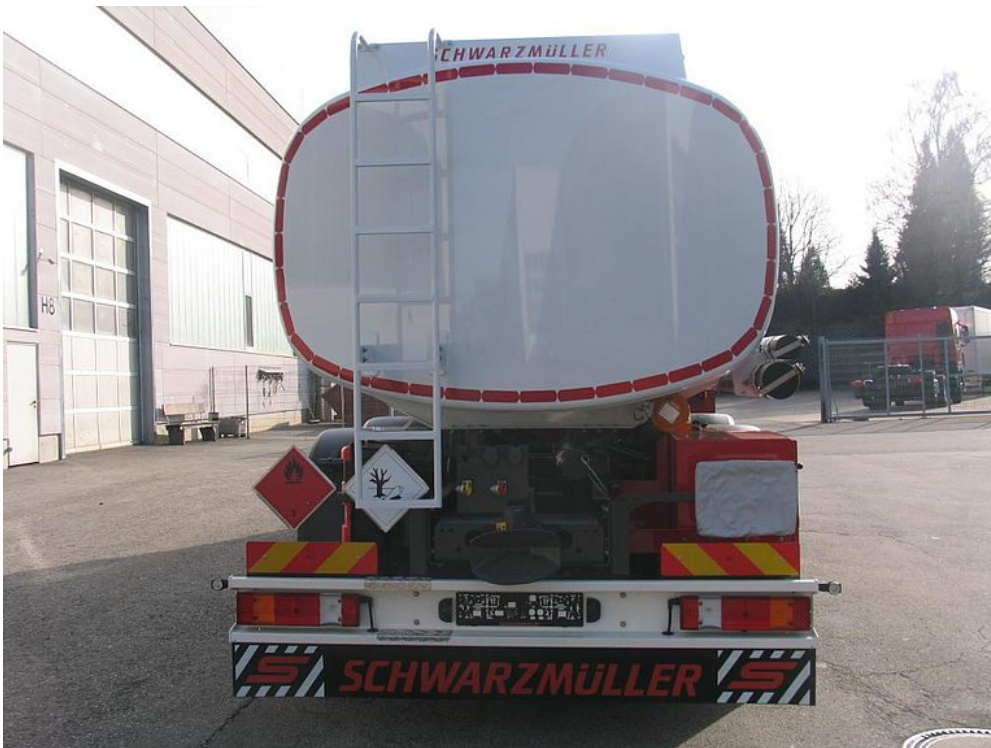
OPTIONAL: Choice of aluminium or steel bumper