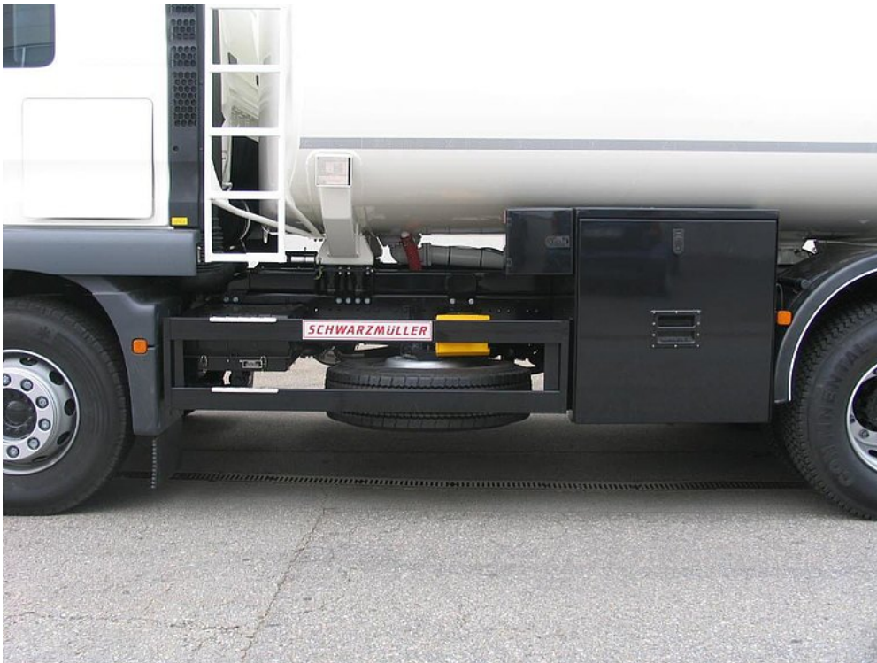
OPTIONAL: Facility for mounting spare wheel bracket