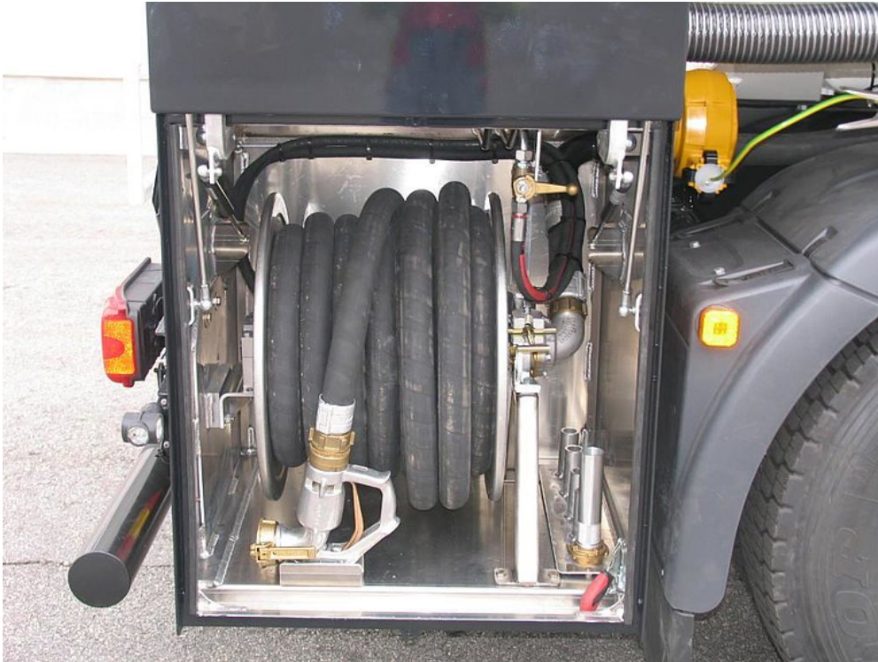
OPTIONAL: Ideal hose reel cabinet with parallel sliding door