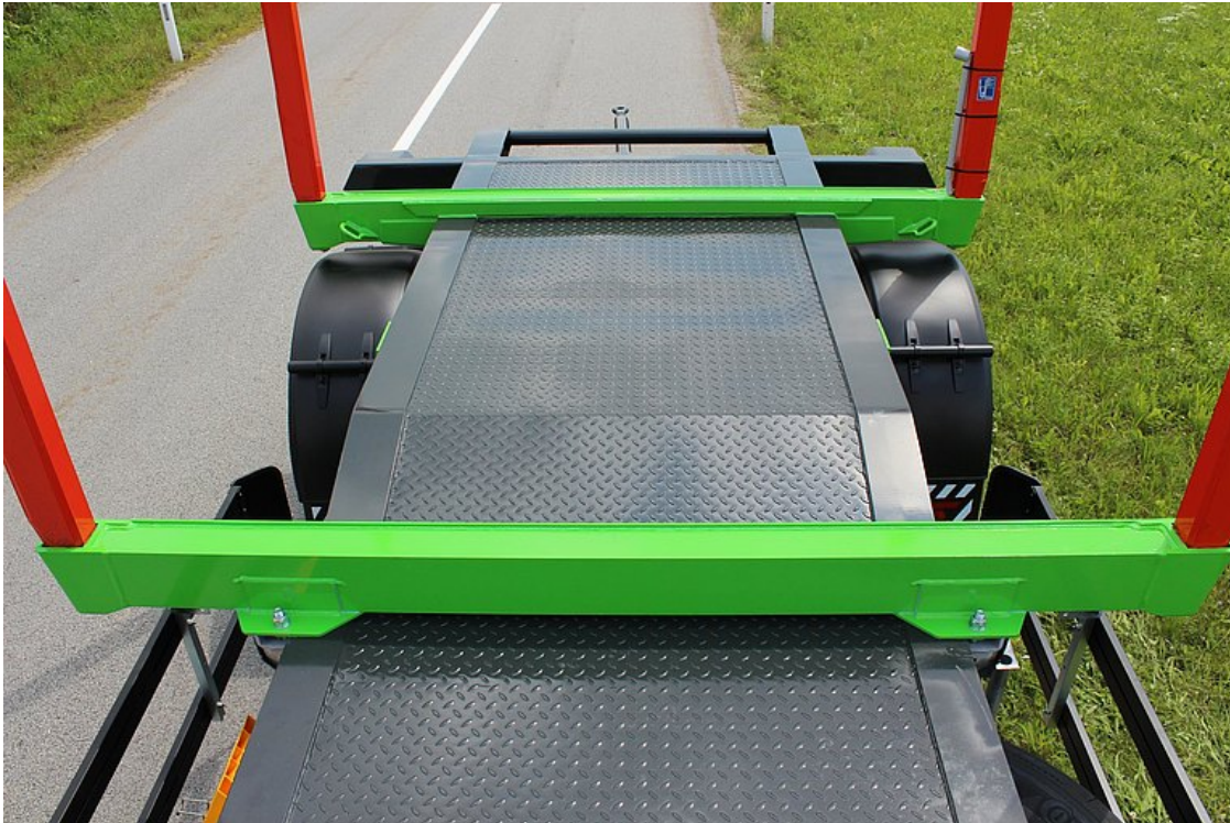
Steel stud plate cover between frame side members