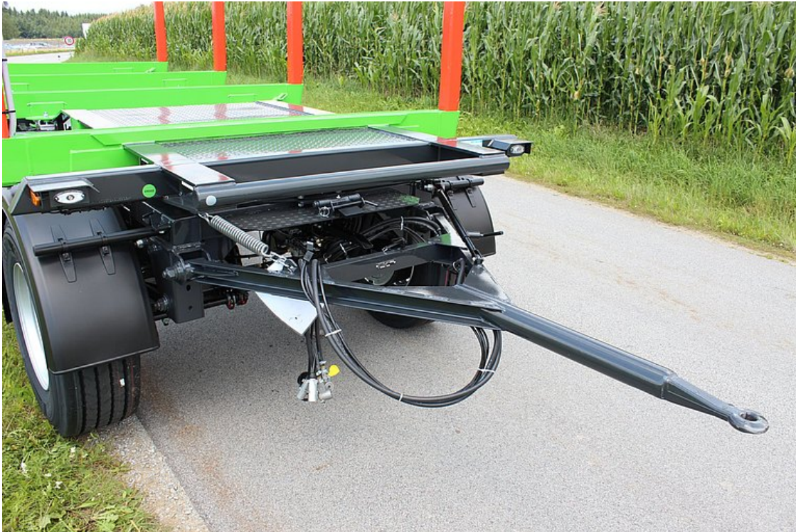
Bogie at front incl. fitted drawbar