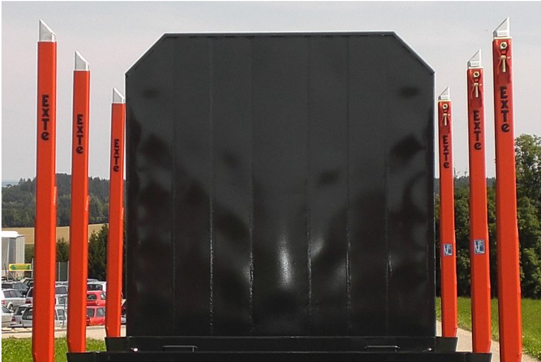
OPTIONAL: Extra-strong steel profile front wall, approx. 2,500 mm high with centre supports