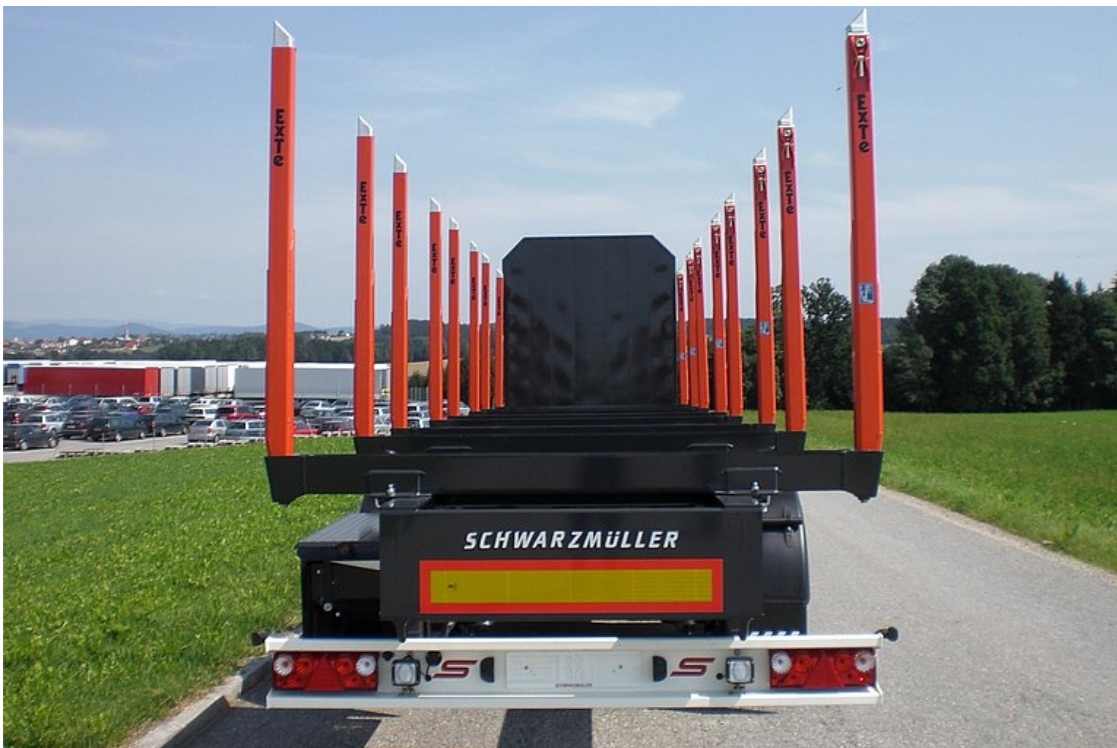
Rear closing element incl. fitted aluminium underride protection