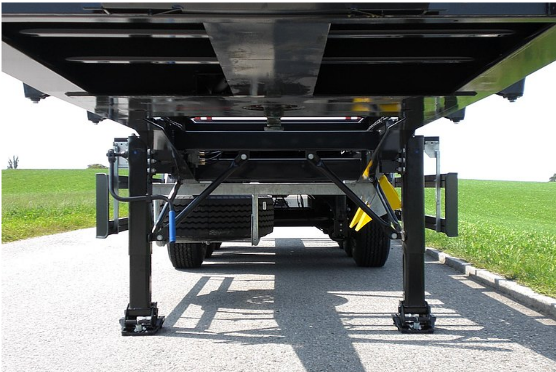
Lightweight frame made from special high-strength NAXTRA steel provides payload advantage of up to 500 kg