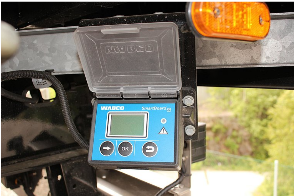
OPTIONAL: SmartBoard for reading data on vehicle display (mileage, axle assembly load, brake diagnostics etc.)