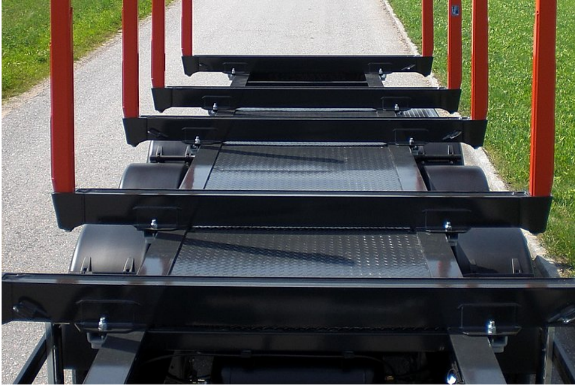
Chequered steel plate cover between frame side members over the chassis and at the front