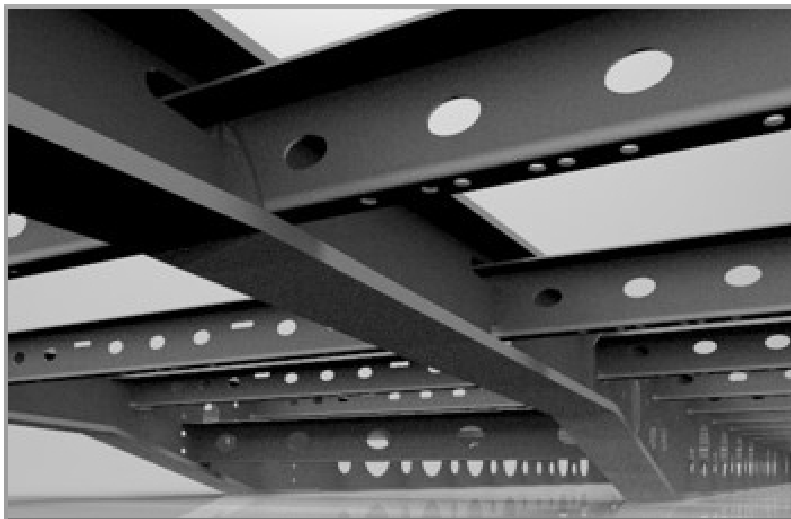
Lightweight frame: Finite element method calculations and road tests confirm its stability.