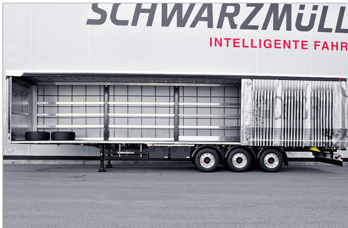
OPTIONAL: Quick slider: System for opening or closing the side tarpaulin within 5 seconds.