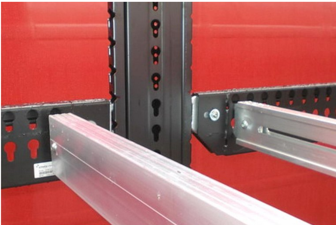
Height-adjustable clip-in pole brackets