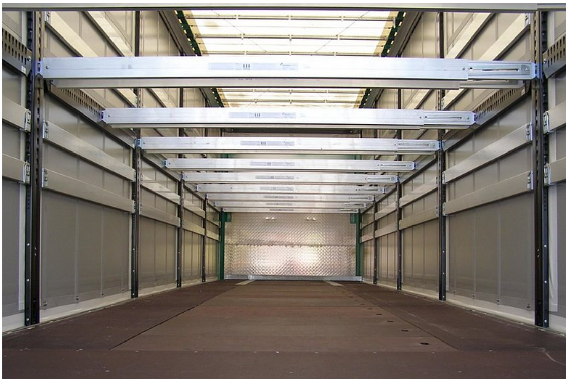
Twin-level loading system CTD for 33 Euro pallets on the 2nd loading level