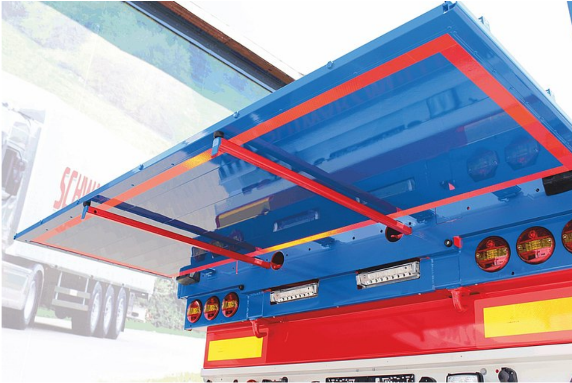
2 slide-out supports for rear wall (non-load-bearing)