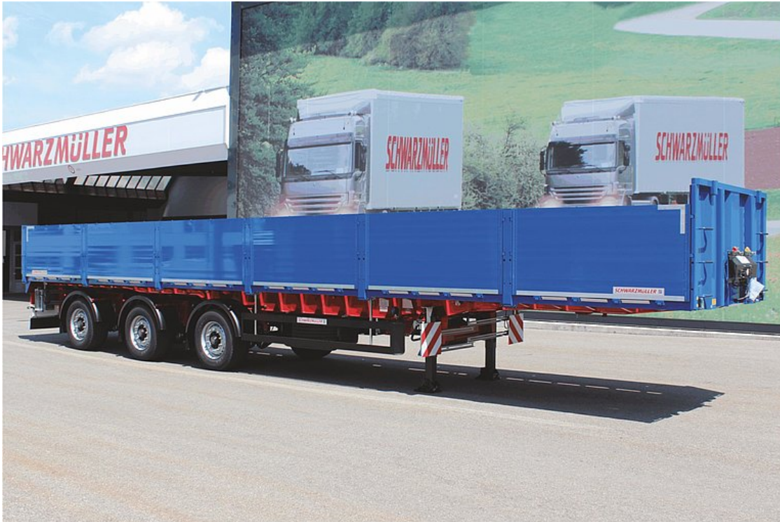
3-axle platform semitrailer with/for mobile crane