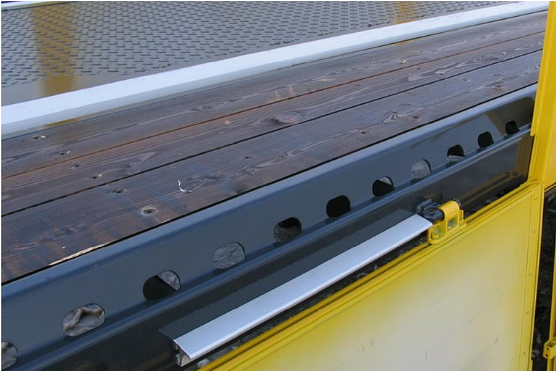
Perforated external frame with approx. 100 mm hole spacing, 50/30 mm slot, for securing 2 t