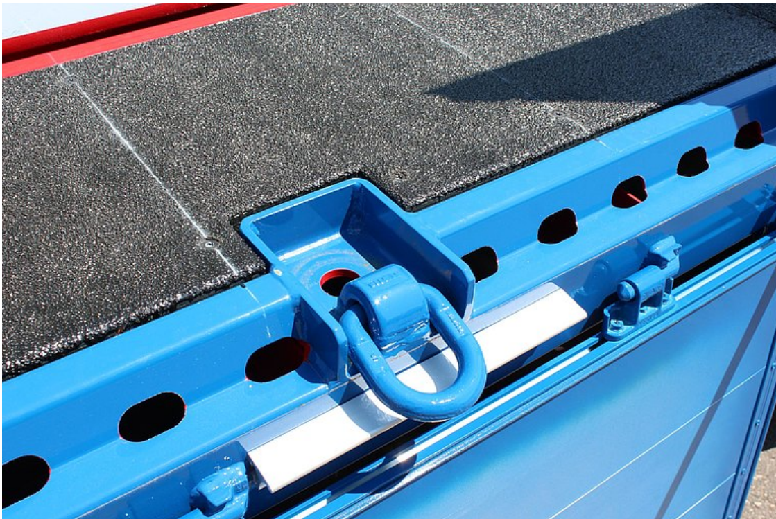
5 t lashing rings that can be folded up, installed horizontally in outer frame, can also be folded outwards