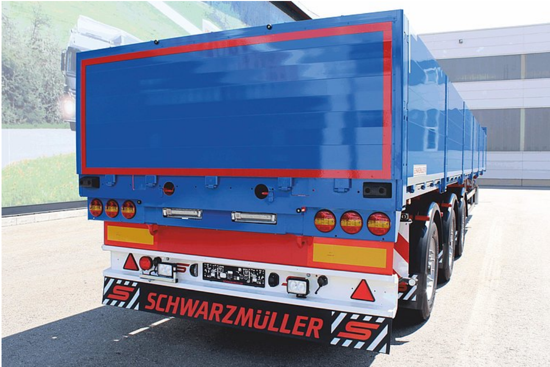
Reinforced, aluminium hollow profile rear wall, 1,000 mm high