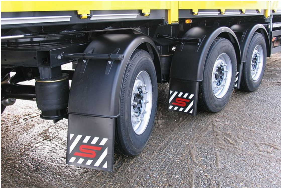
3. Semitrailer axle with mechanical forced steering