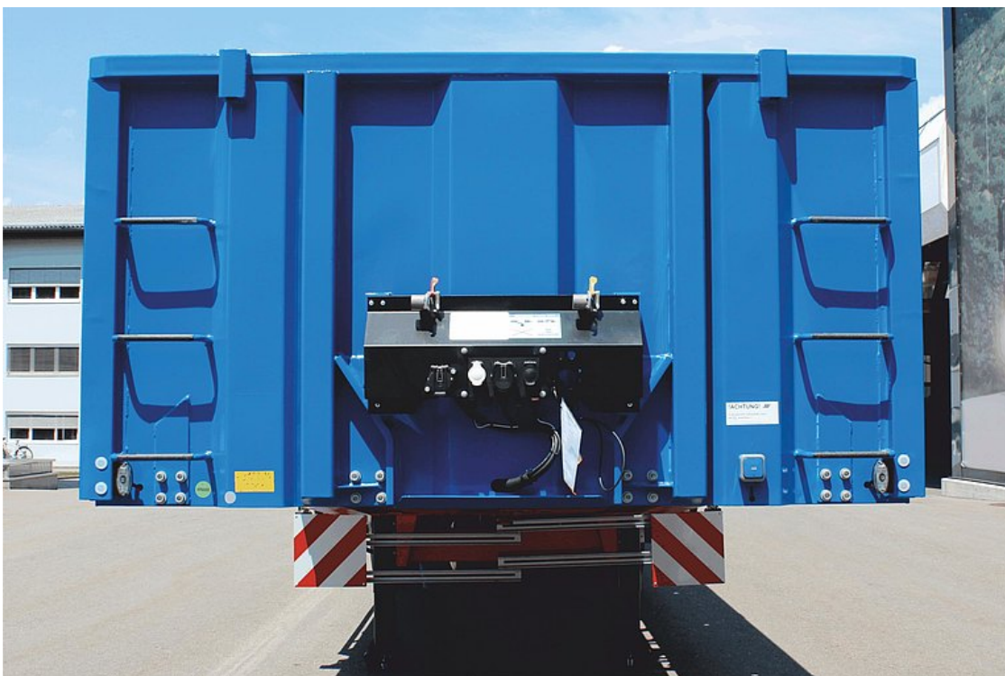
Fixed, reinforced aluminium hollow profile front wall