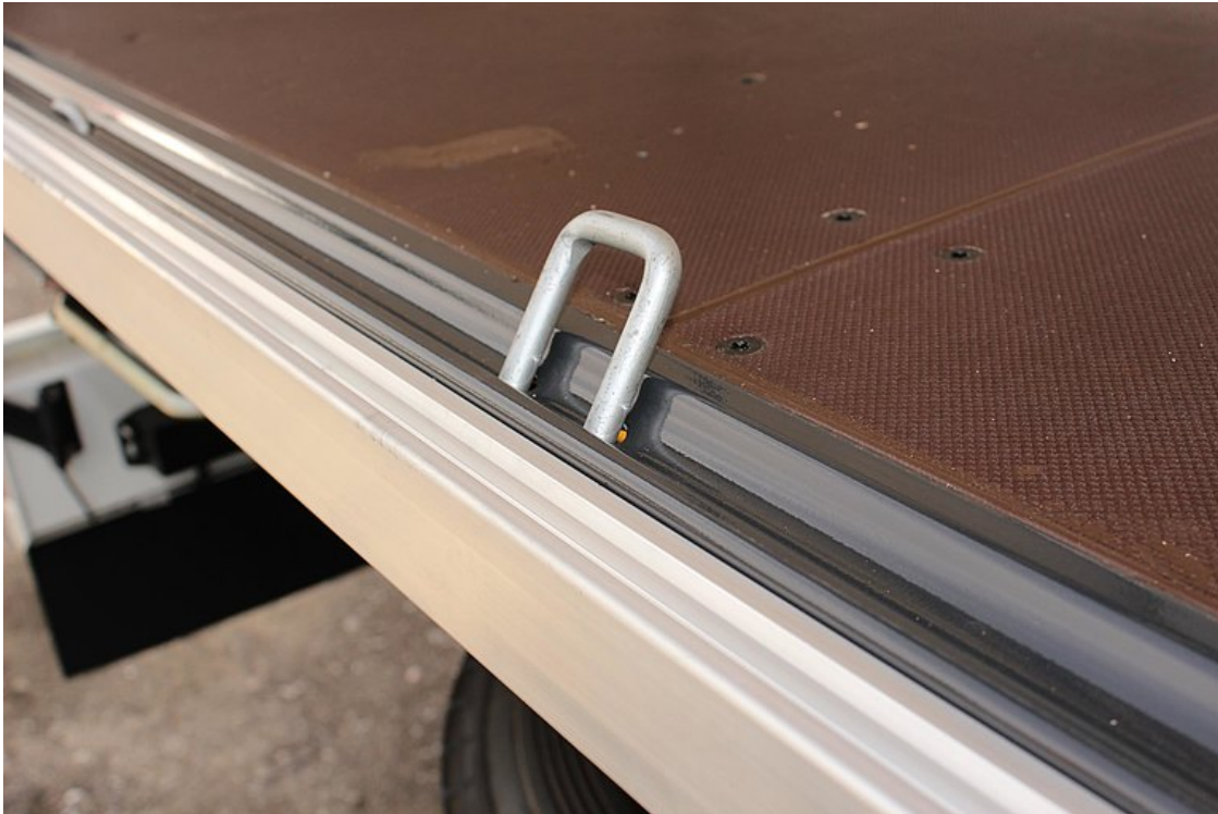
Additional protection in the form of aluminium combination bumper strip, bolted on both sides, with integrated tarpaulin mounting and pole fixation