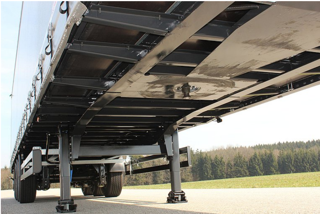
Torsionally rigid, welded ladder frame structure