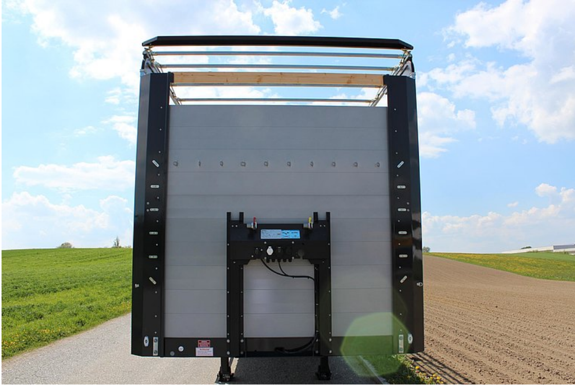
Reinforced aluminium hollow profile front wall with integrated equipment bracket