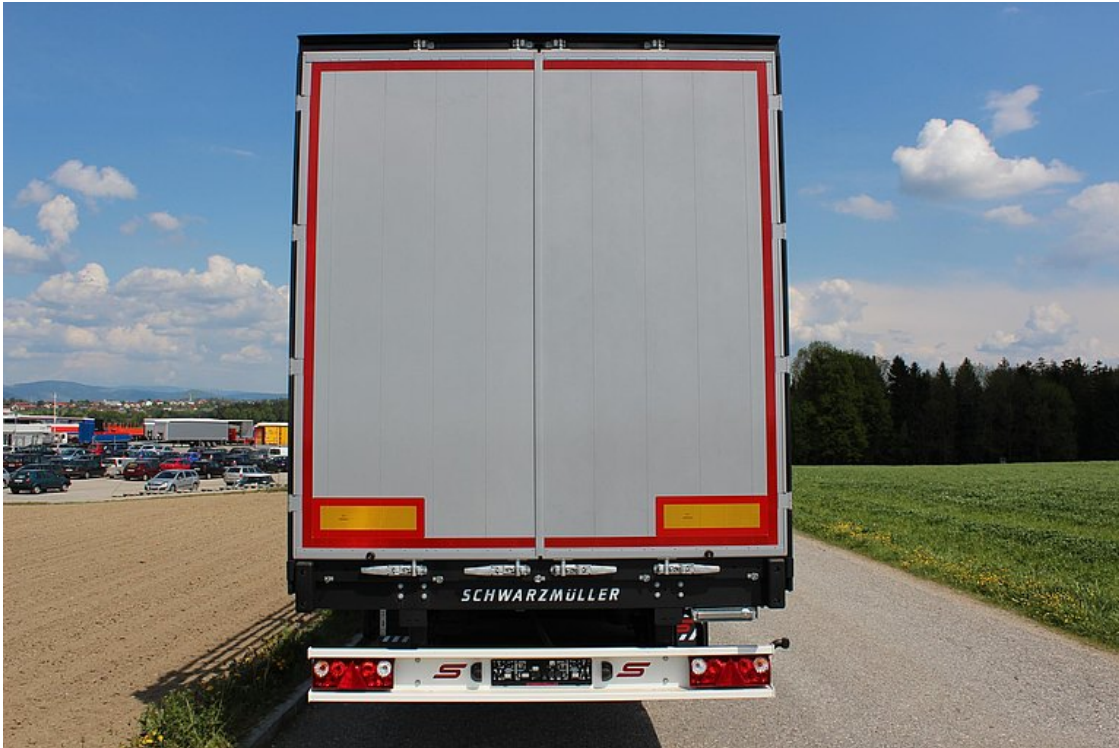
OPTIONAL: Portal frame with double door - bolted portal at rear with fully opening double door in aluminium profile design