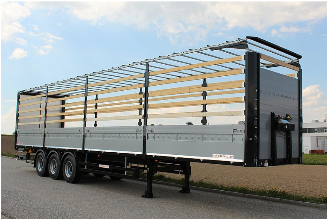
3-axle platform semitrailer