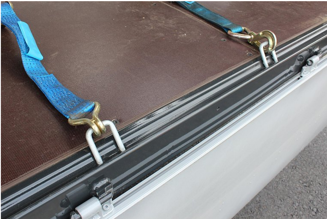
External frame with 23 pairs of recessed 2.5 t lashing points for load securing