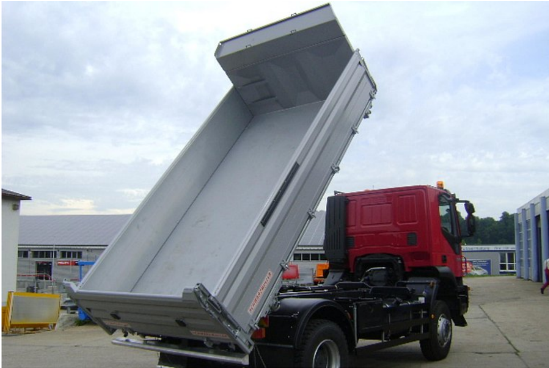
3-way tipper body on 2-axle truck - building site