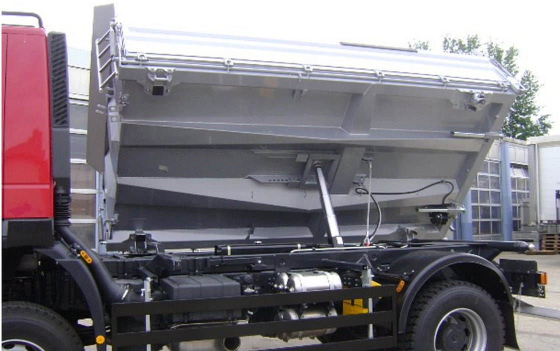
Tipper body design with conical trapezoidal profile side members in high-strength, lightweight design with small bottom panels for high dent resistance and shock absorption