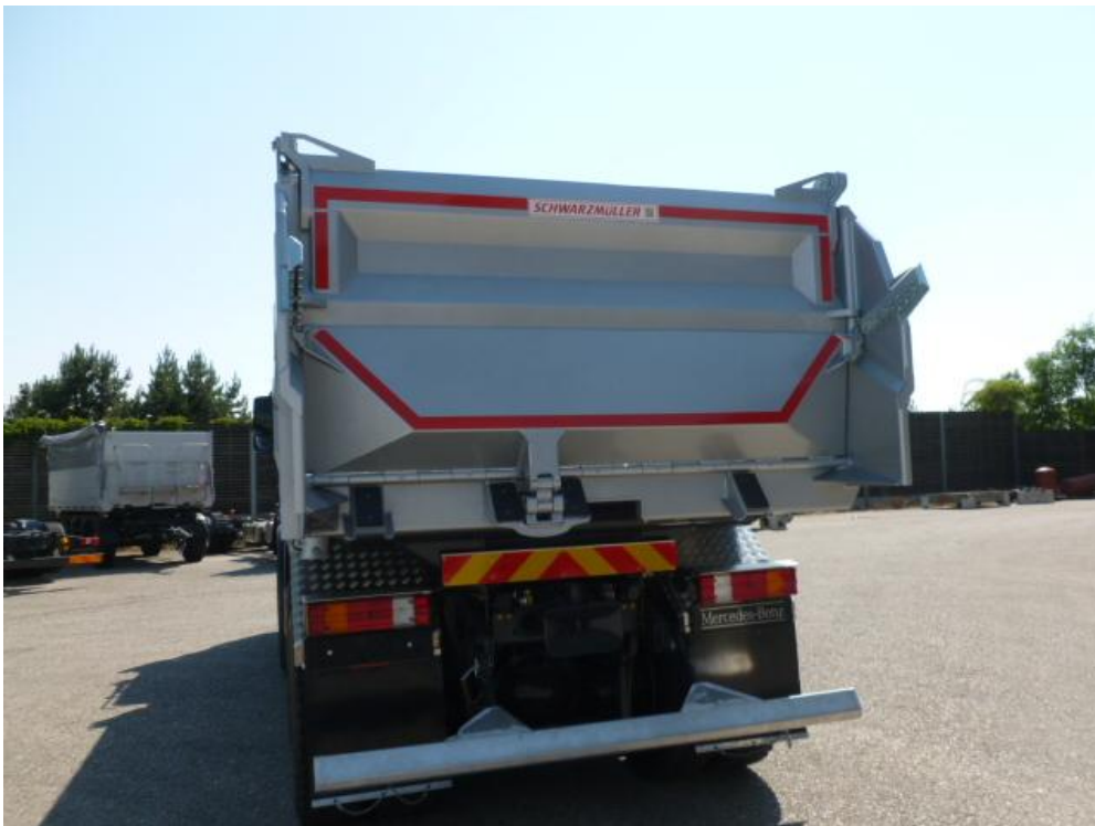
4 mm steel sheet rear wall, approx. 980 mm high, hinged with raised bearing and pneum. lock that can be operated from the cab and unit can be partially folded down