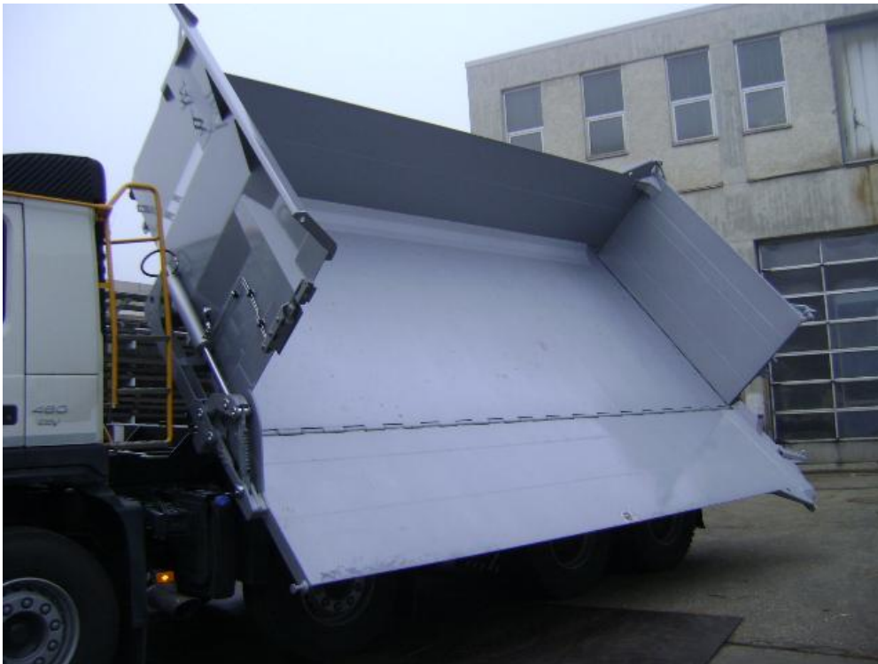
OPTIONAL: Without fixed corner post front left, left corner post integrated into side wall/Bordmatic