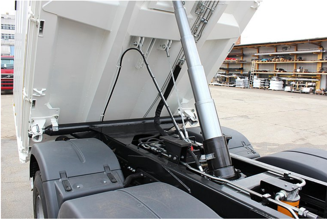
Hard chrome-plated, high-quality tilt cylinder