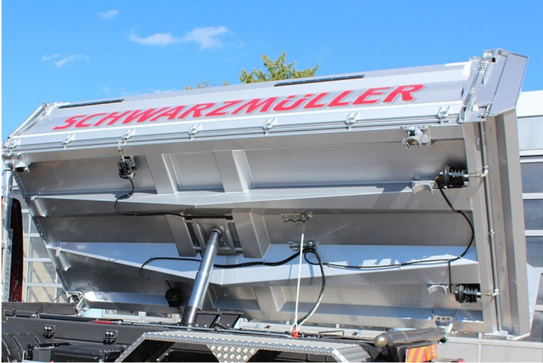
Tipper body design with conical trapezoidal profile side members in high-strength, lightweight design with small bottom panels for high dent resistance and shock absorption