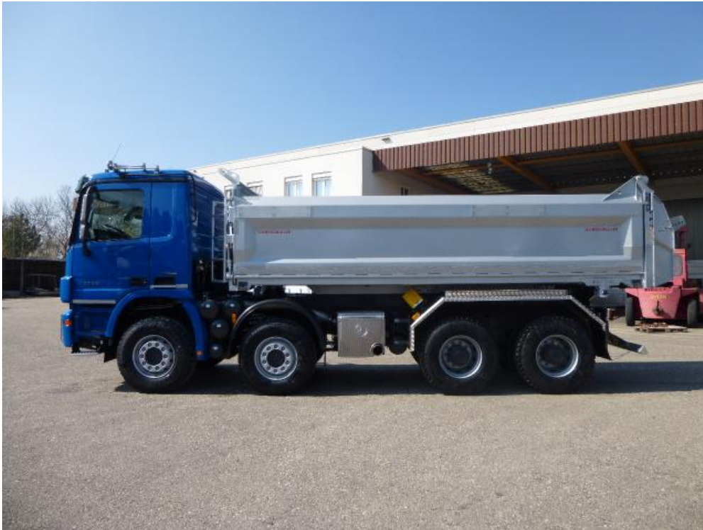
2-sided tipper body on 4-axle truck