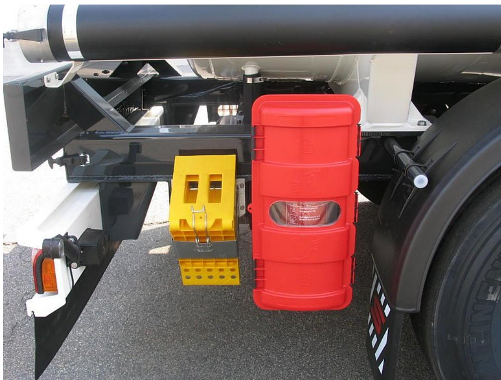
OPTIONAL: Fire extinguisher box with viewing window