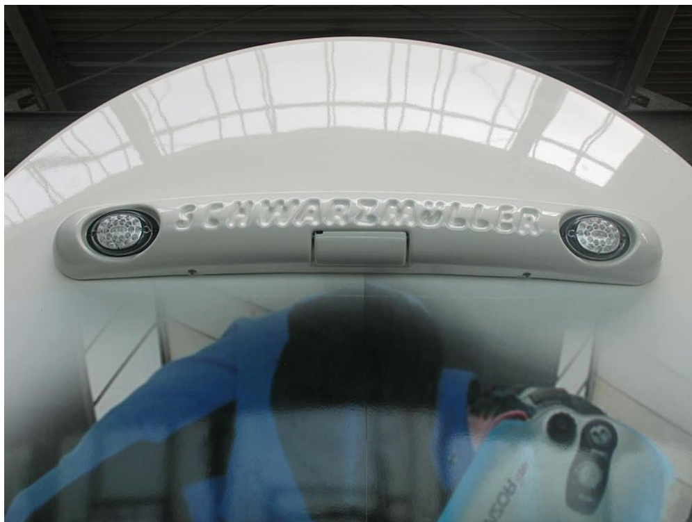
OPTIONAL: High-set LED light holder with optional integration of reversing camera