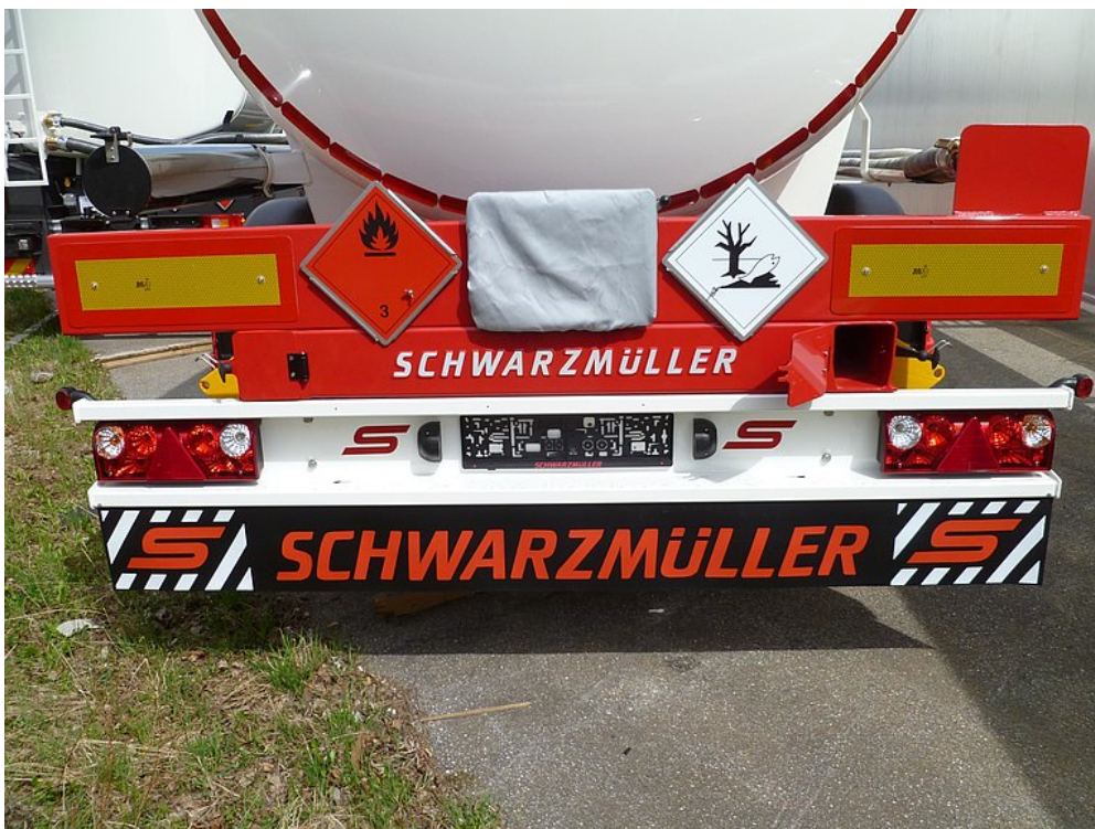
Hose cabinets integrated into the chassis frame