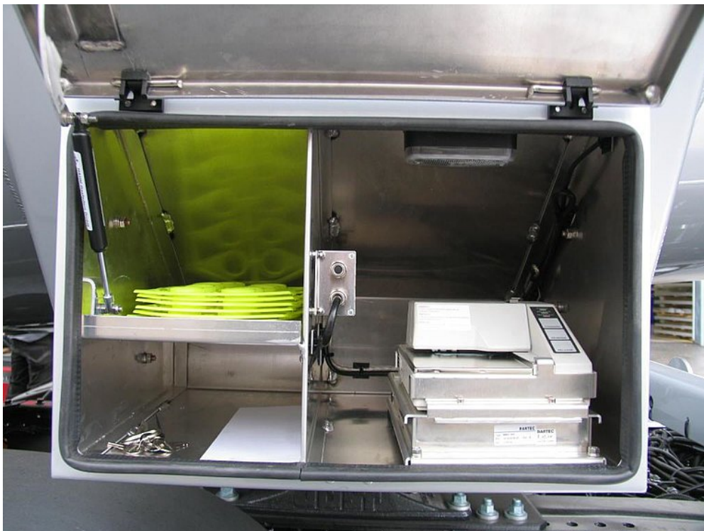
Separate printer box for optimum protection against mechanical damage and the weather