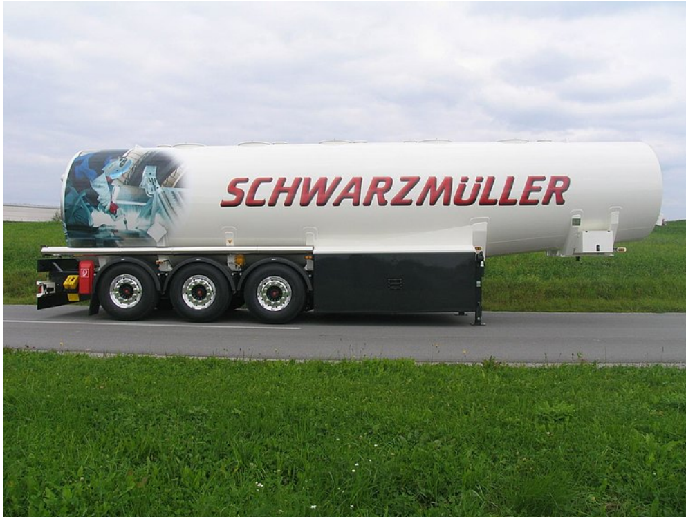
Optimum drainage due to double-wedge construction