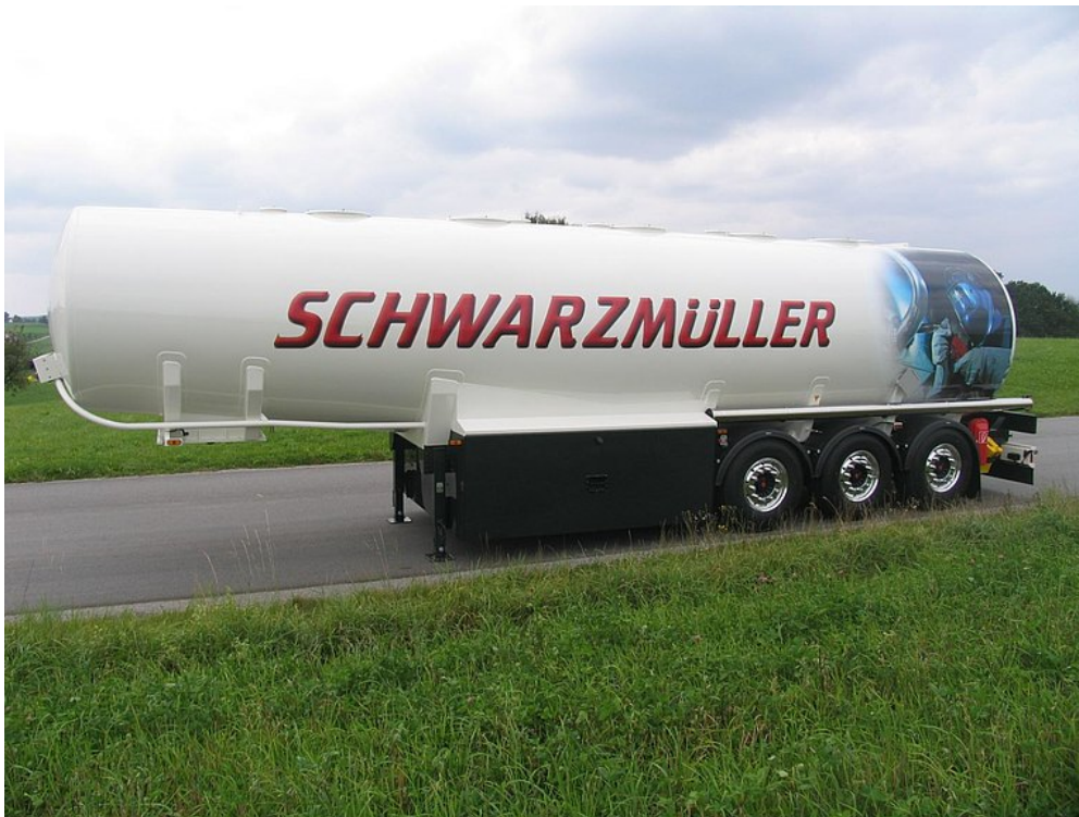
Modern design and maximum vehicle functionality