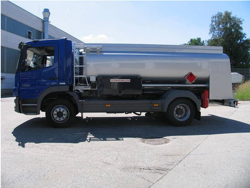
Modern design and maximum vehicle functionality