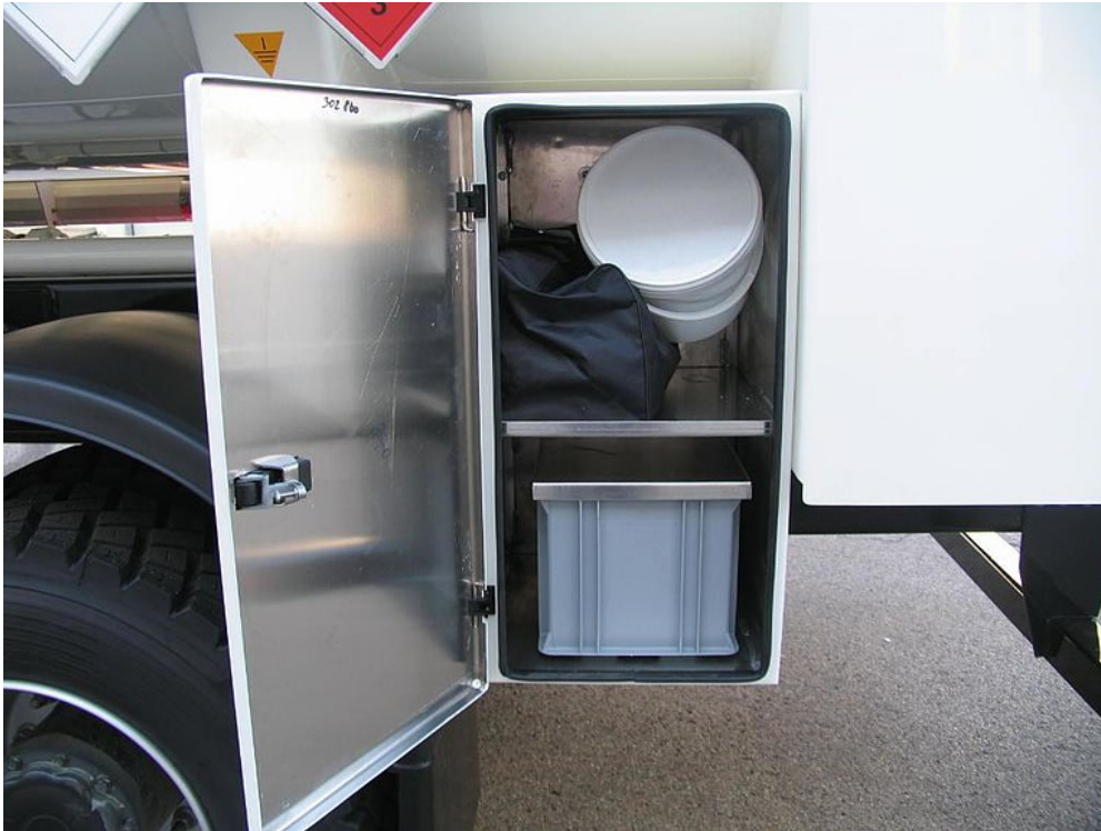
Accessories box with side-opening door offers plenty of storage space