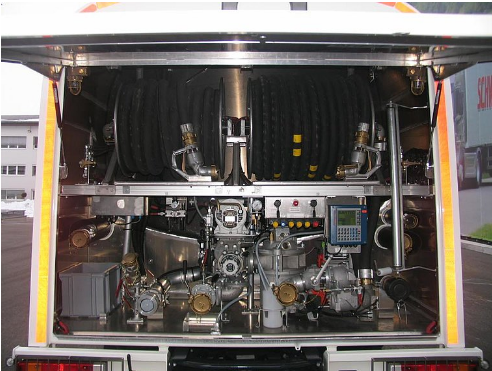
Rear-mounted cabinet with folding door for measuring systems and hose reel