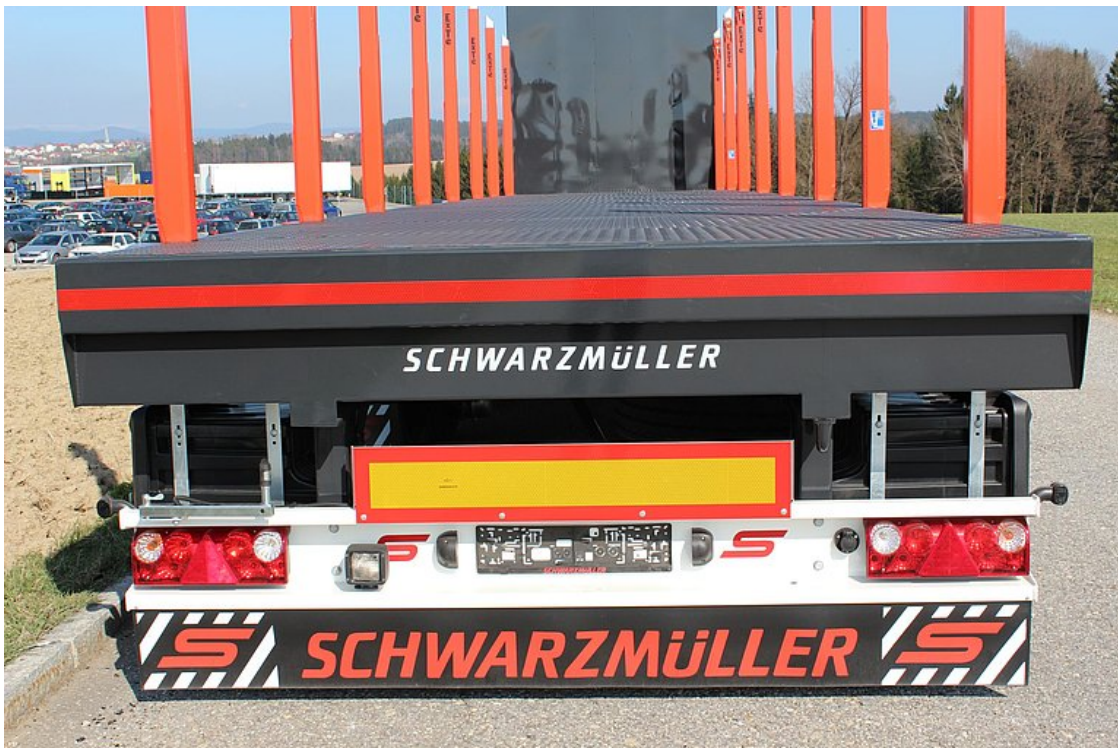
Rear closing element incl. fitted aluminium underride protection